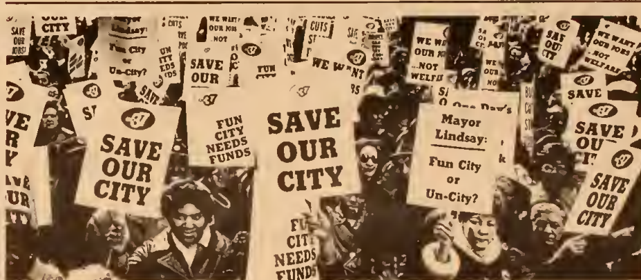
DC37 (AFSCME) WORKERS PROTEST BUDGET CUTS

front can NMU members escape the double trap of their declining industry and treacherous union leadership. This is why the program of Morrissey's "Committee for NMU Democracy" is fundamentally deficient and even dangerous. For once the seamen have waged an all-out struggle to unseat the Curran machine, it may be a decade before they are prepared to undertake such a fight again. The Curran machine stands nakedly revealed as corrupt, despotic and conservative; to topple it only to raise in its place a "good guy" leadership which does not differ from Curran on fundamental class questions would be a gigantic betrayal of all NMU seamen.