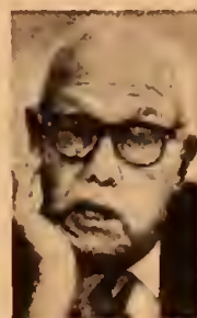
George Meany, head of A.F.L.-C.I.O., backed the use of anti-inflationary wage and price controls.

will be the first to call for smashing the unions themselves, and sending American labor back into the conditions of the last century,