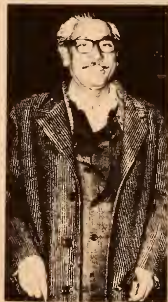
Mujib journeys from Rawalpindi to Dacca via London

In June Bengali officials agreed in Delhi to integrate the Bangla Desh economy into the fifth Indian five-year plan. Indian personnel now staff key ministries in Dacca, while Indian aid to the tune of $275 million has been directed at rebuilding the transportation and communications links needed to accomplish the integration. On the one hand, Bangla Desh will be useful as a protected market for India's high-priced industrial production; on the other hand, Bengali natural resources will be utilized to develop fertilizer and paper manufacturing, sorely needed