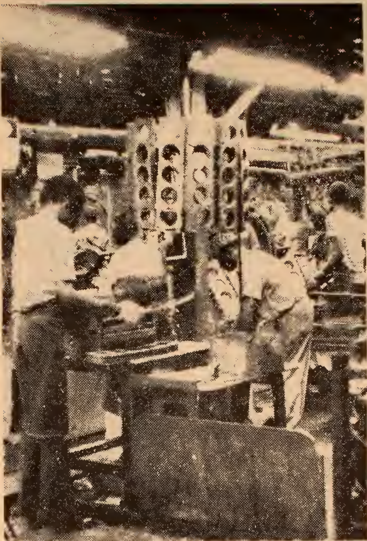
Foundry at Ford River Rouge: Conditions as bad as ever