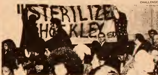
"Sterilize Shockley"—Now PL/SDS concentrates on liberal campaign against racist professors, ignoring class struggle and fundamental needs of black masses.