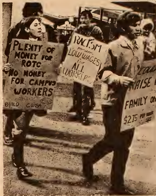
While PL was in its left phase, SDS drew the class line against liberals and New Left, yet failed to transcend simple economism, exemplified by the CWSA campaign.

Materialism, the peasant question, self-determination—these are not abstract questions; they are matters of life and death in the real world. The Spartacist League has for years exposed the Soviet Union's betrayal of the indochinese revolution by our demand for massive Soviet aid to North Vietnam, including the most advanced weapons, in defense against U.S. imperialism. PL, on the other hand, calls on Vietnamese revolutionaries to reject this aid (no unity with the revisionists and, of course, the will of the people is more powerful than technology). Thus PL wishes Vietnamese peasants and workers to fight U.S. B-52's with bamboo spears and rifles! This is madness. As Lenin said of the ultra-lefts of his day, who opposed the Brest-Litovsk Treaty in 1918 (PL opposes