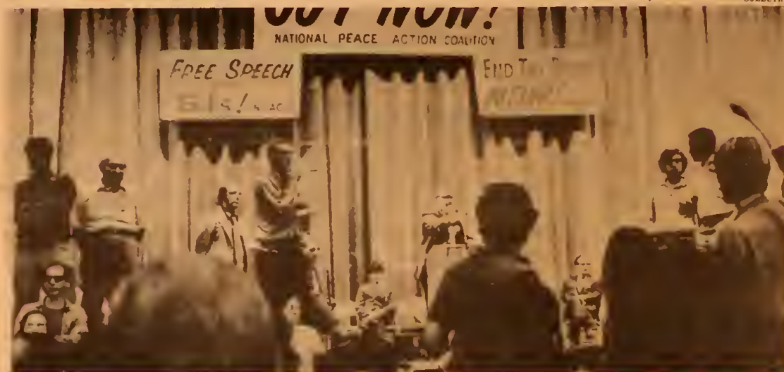
Marshalls at July 1971 NPAC meeting attacked SL and PL supporters protesting presence of Senator Hartke, UAW's Victor Reuther at the mike.