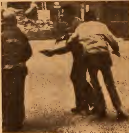
UAW bureaucrat gunning for militant during contract dispute.

As we reported in our previous issue (WV No. 33, 23 November) the atmosphere surrounding the re-votes in Local 600 was, according to one source,