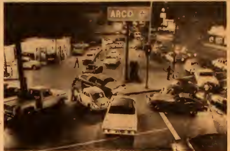
Top: Symbol of National Iranian Oil Company. NIOC may open gas station chain in New York, while Saudi capital invests in North Sea oil. Bottom: cars line up for gas during shortage.

of foreign natural resources, including not only a section of the American bourgeoisie, but also the Persian Gulf sheiks and Latin American juntas.