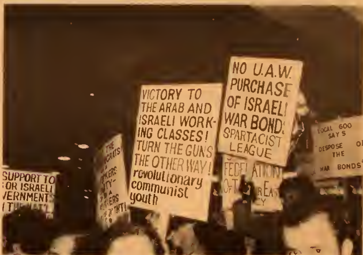
SL/RCY pickets call for international working-class unity.

It would be a disaster for black workers to fall into the chauvinist temptation to adopt a hostile attitude toward Arab workers in imitation of white chauvinism and the anti-foreignism of the labor aristocracy. The fact that desperate black workers were often used by the auto companies to break strikes of white workers in the 1920's and 1930's merely made the slogan of black-white unity all the more important, in fact vital for the advancement of labor. Today it is likewise crucial to fight for real black-