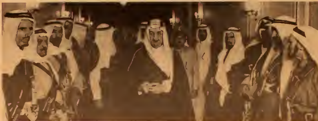
Saudi King Faisal and his palace guards.