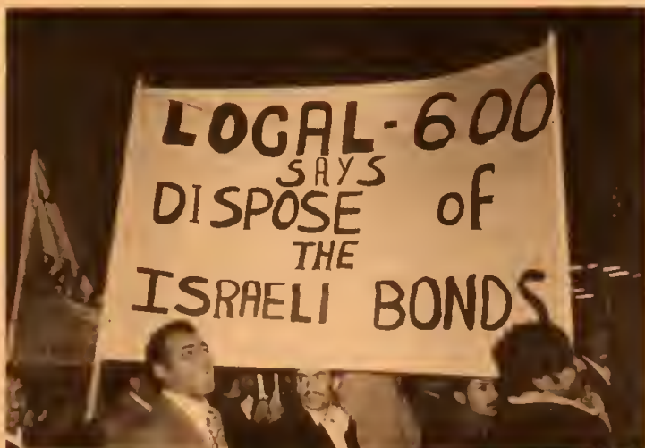
Arab workers demonstrate in Detroit against Woodcock support for Israel. A mass walkout by Arab workers shut down Dodge Main earlier in the evening.