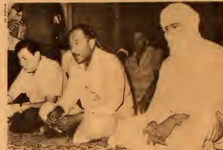
Libyan leader Qaddafi (right) and Egyptian president Sadat (center).

Faisal's boycott serves a useful purpose in showing up the Stalinist and revisionist notion of an "implacable" conflict between the "progressive nationalist republicans" and the "pro-imperialist feudal reactionaries" as so much hot air. A Faisal-Sadat axis now dominates the Arab world and, from a nationalist standpoint, that is how it should be. Faisal's oil weapon has done more harm to Israel than Egyptian arms or "Arab socialist" rhetoric, and every serious supporter of Arab nationalism should hail the god-given ruler of the last bastion of chattel slavery as his rightful leader. Those, like the SWP, who claim that "consistent" nationalism leads to socialism should now invite the Arabian king into the socialist movement. No doubt Healy and Wohlforth will claim that the ever-deepening "Arab Revolution" (a revolution not directed against the Arab ruling