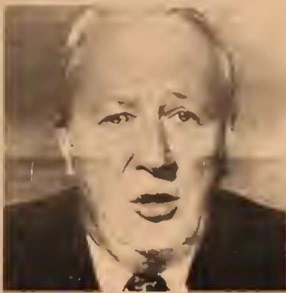
British Prime Minister Edward Heath