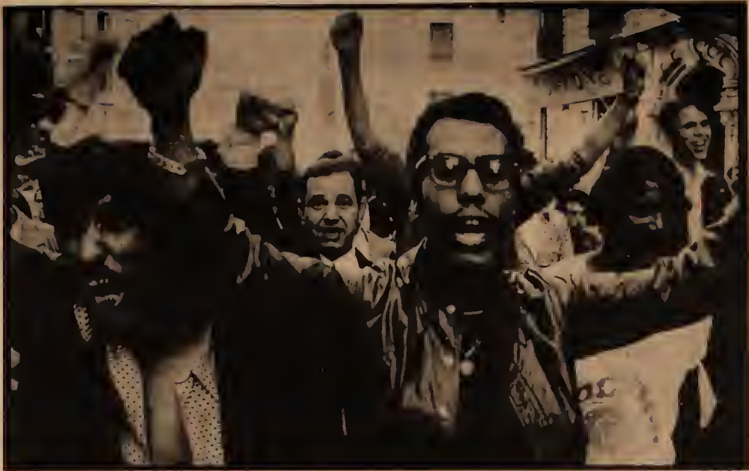
Immigrant workers demonstrate in France.