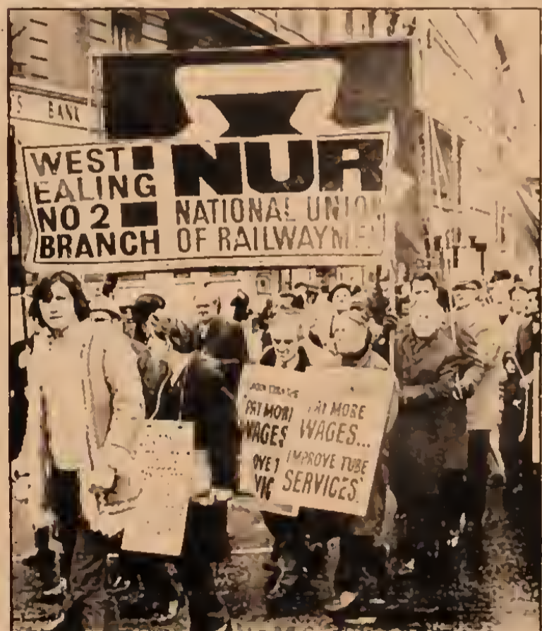
Railway workers demand higher wages.