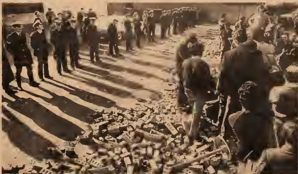
Australian Ford workers strike last summer.

tical credit to force "voluntary" wage controls on most of the working class. At a time when the working class is weakened by higher unemployment levels (for example, in next year's expected recession) the ruling class will attempt to impose a tougher policy, with