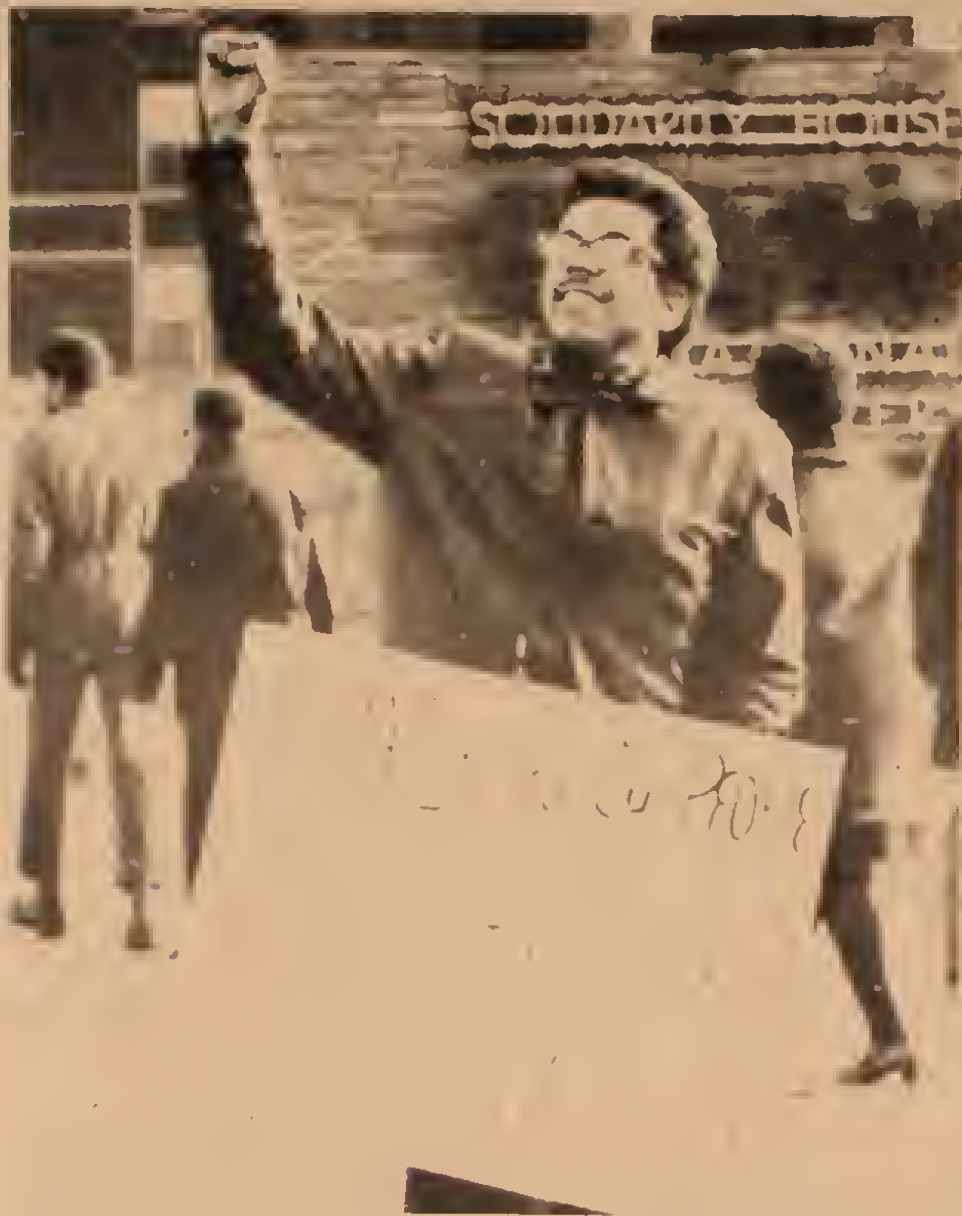
NATIONAL ORGANIZING COMMITTEE (DETROIT)

League of Revolutionary Black Workers pickets UAW Solidarity House