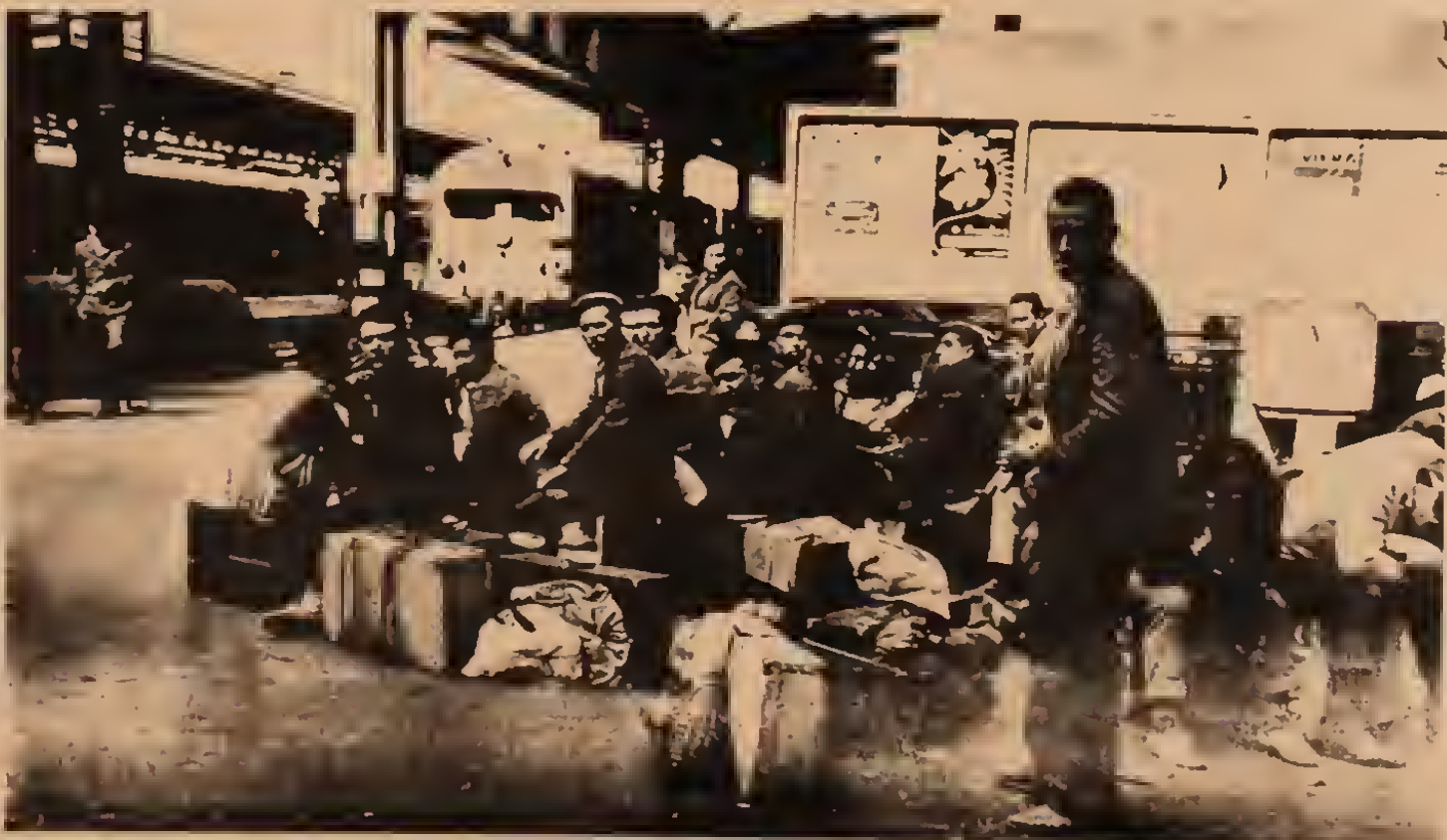
Portuguese workers en route to Germany: Gare de l'Est, Paris.

At the same time, the bureaucracy's fear that young, educated Soviet citizens would flock to the capitalist West if allowed to do so is a fitting testimony to the moral bankruptcy of the Stalinist regime. A revolutionary workers government, enjoying massive popular support and pursuing internationalist and socialist policies (as opposed to the short-sighted nationalism of the parasitic bureaucracy) should have little difficulty persuading its educated youth not to sell themselves, regardless of the price, to the stockholders and militarists of the capitalist states. The revolutionary enthusiasm which should motivate these young people, however, can only be recreated in the Russian people in the course of a political revolution which shakes off the leaden hand of the bureaucracy