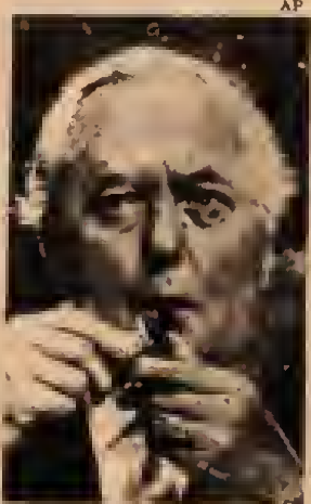
Labour Party head Harold Wilson

of the proletariat) in Britain at this time indicates either a belief that the Wilson-Jones-Murray leadership of the labor movement can be pressured into overthrowing the capitalist system, or that this can be done spontaneously over the head of the recognized leadership of the labor movement. The IMG tends toward the latter approach, displaying a near-syndicalist indifference to the powerful reformist Labour Party/Trades Union Congress leadership. The adventurist line of Chartist , on the other hand, reflects its illusion that the Labour Party, as presently constituted, is a potential soviet which could seize state power after electing a revolution-