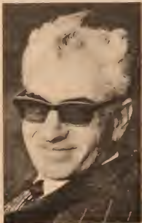
Shah Reza Pahlavi of Iran