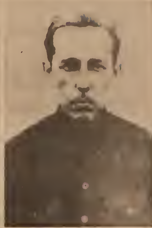
Aleksandr Solzhenitsyn as officer in 1944 (left), under detention in 1946 (center), and after 1953 release (right).

in the Gulag Archipelago began to pour out in literary works after his release. His first literary productions did not explicitly attack the bureaucracy or socialism in general, although it is now known from Solzhenitsyn's own account that he had already moved away from socialism to a belief in abstract democracy.