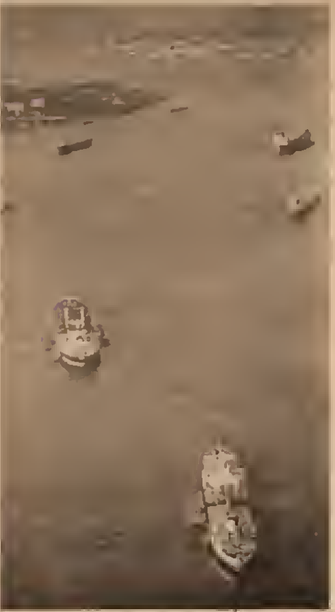
Oil tankers waiting to unload...

On the other hand, the Shah is no pacifist and has been rapidly expanding his arms budget, increasing from $8.5 million in the early 1960's to $168 mil-