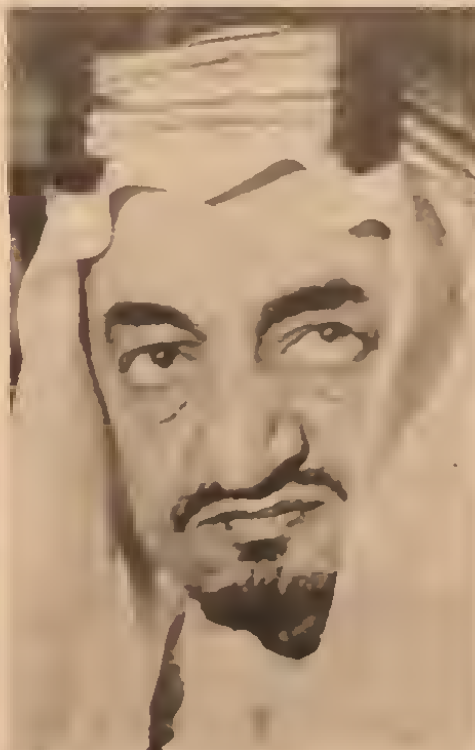
King Faisal of Saudi Arabia