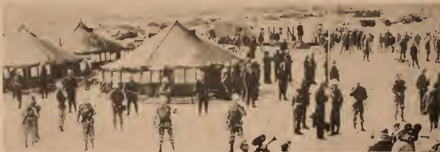
UN troops guard tent at Km. 101 where Egypt, Israel generals sign disengagement agreement.