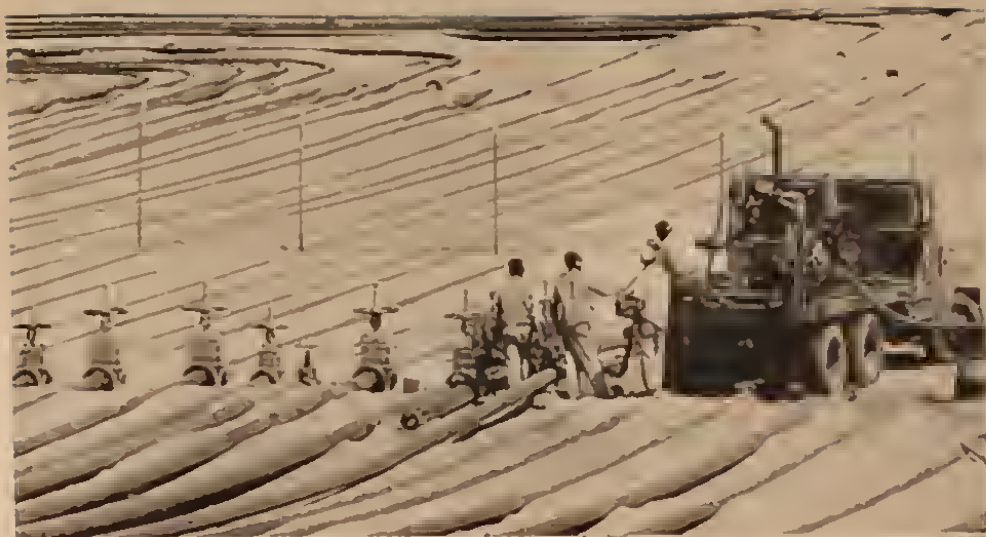
Exxon pipelines in Libya.