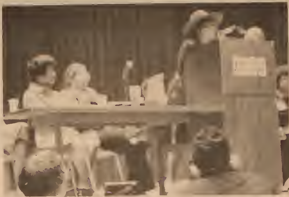
Democrat Bella Abzug speaking at N.Y. Trade Union Women's Conference.

"The Cornell program proposes taking women from the trade unions into graduate study to 'train them for leadership.' Presumably after such training they re-enter the unions as part of the international affairs departments, etc. This type of 'training' has a precedent in the 'training' of Latin American leaders in Washington by the American Institute of Free Labor Development, the major union cover for CIA intelli-