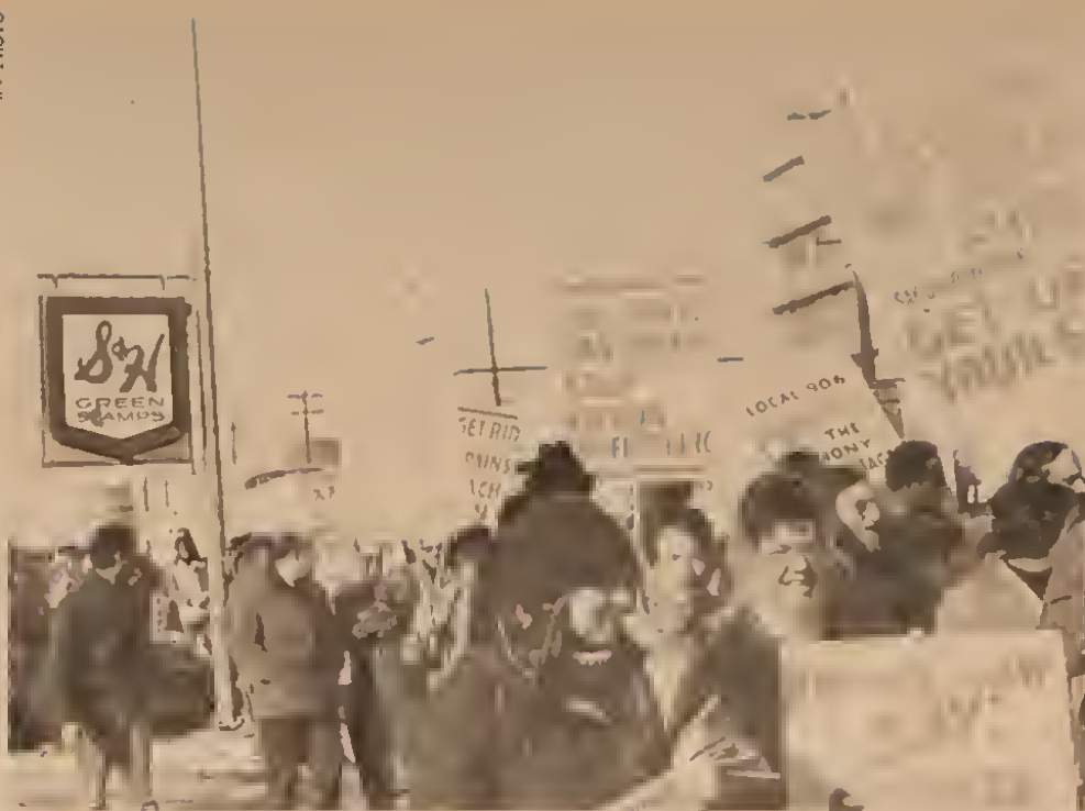
Recent demonstration against "fuel shortage" called by UAW-IUE bureaucrats in Linden, N.J.

The tensions within the so-called "Atlantic Alliance" are nothing new. Since DeGaulle took French troops out of NATO and tried to build up an independent French franc by accumulating mountains of gold in the mid-1960's, the likelihood of the Western imperialists' acting in a unified manner in a world political or economic crisis has been questionable. In particular, there has been a sharp reaction of the European ruling classes to Kissinger's Metternichian plans for a new counter-revolutionary Holy Alliance under U.S. leadership. When the U.S. Secretary of State proposed a "new Atlantic Charter" in a speech last spring, the European reaction was almost uniformly nega-