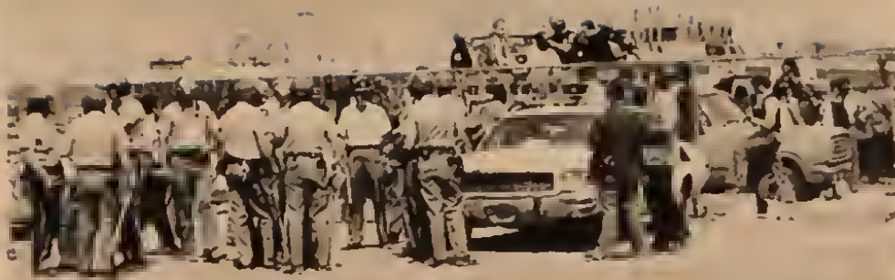
Cops mass as Judge Stair orders arrest of militant strikers.

As a cover to help break the Dodge Truck walkout the local UAW bureaucracy even allowed an "official" strike vote about a week later. The vote was overwhelmingly pro-strike, one of the demands to be the reinstatement