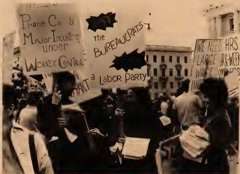
MAC supporters at 28 April 1973 labor rally, Bay Area.