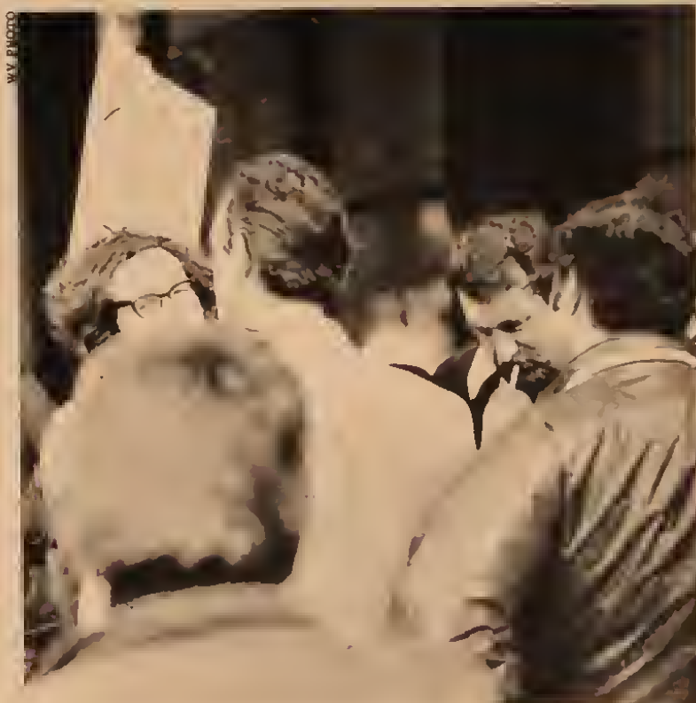
CP goon squad confronts Spartacist/RCY supporters at Chicago Chile march.

A comic sidelight on this maneuvering was provided by the antics of the "Revolutionary Marxist Collective," a local group in the Bay Area which supports the politics of the Mandelbrot majority of the "United Secre-