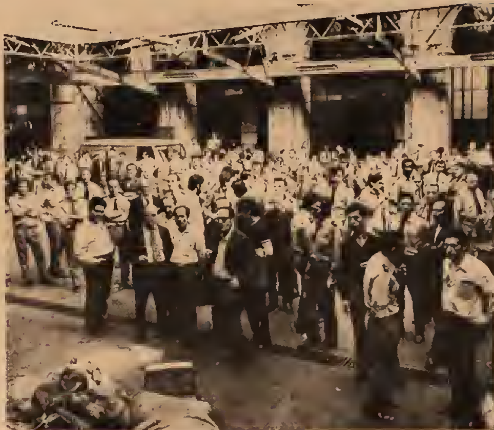
Postal workers gather during Lisbon strike.

Even more devastating to the strike effort than the threat of troop intervention, however, was the smear campaign of the Communist Party traitors. Having obtained two seats in President General Spínola's cabinet, including the Ministry of Labor, the CP was naturally "in perfect unity" with the government line that interruption of work in vital sectors of the national economy contradicted "normal progress toward