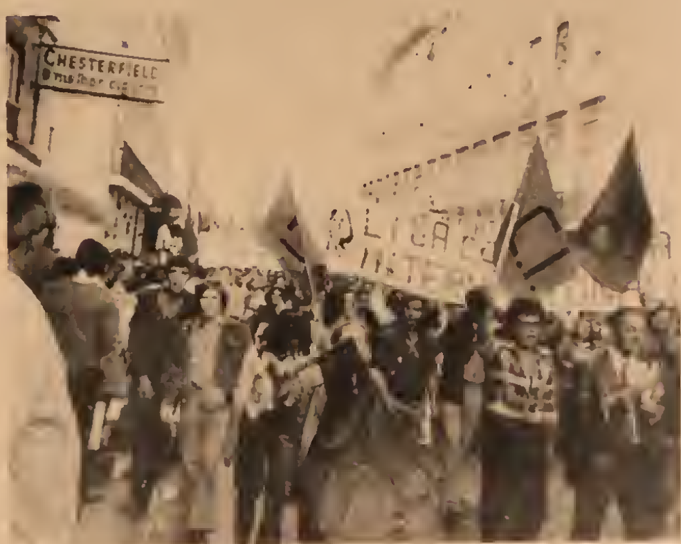
LCI contingent at Lisbon demonstration in June.

While the demands are just, and could be the object for occasional joint action, the "unity" they represent is entirely bogus. Most likely this will not develop beyond an informal propaganda bloc in which the several organizations opportunistically submerge their political differences. But if a common formation should emerge (similar to the Chilean MLR, founded in 1965 by Maoists, Castroites and "Trotskyists") it would only split apart at the first serious political test: for instance, in a "July Days" situation where the Maoists, anarchists and Castroites might well attempt some kind of adventurist action; or over political demands, such as a call for immediate elections to a constituent assembly.