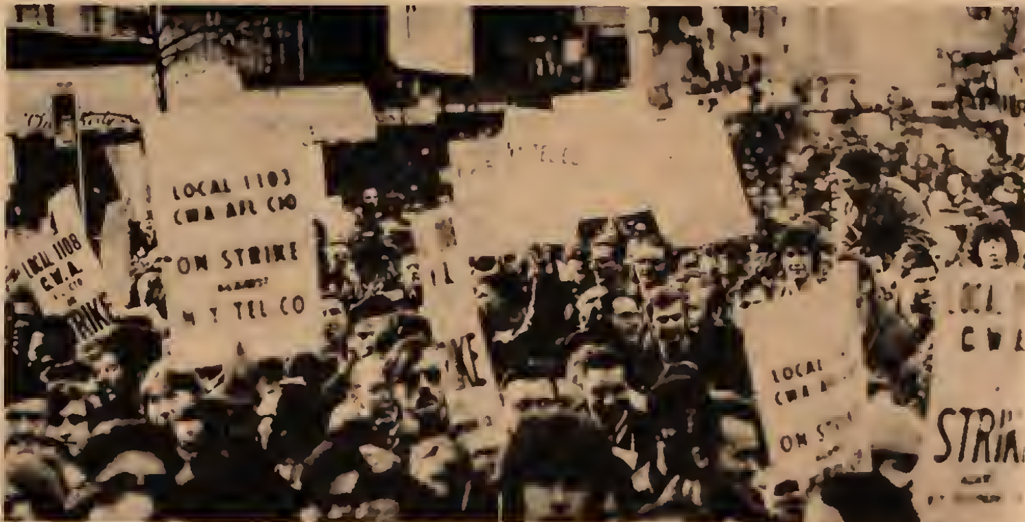
New York Telephone workers' demonstration during the seven-month 1971 strike.