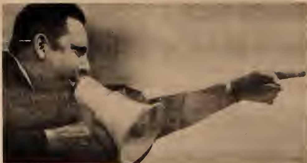
Judge Stair personally orders end to blockage of Warren, Michigan Chrysler plant.