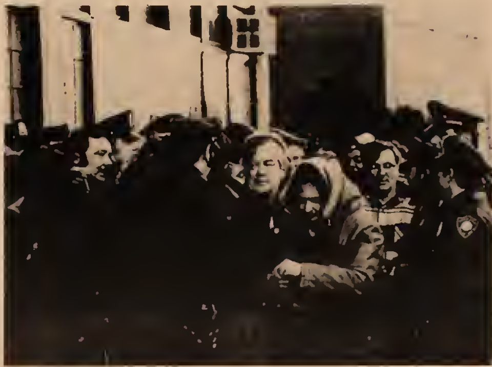
Shipyard workers at General Dynamics' Fore River plant continue picketing despite police harassment.

of the 75 workers fired during the wildcat. But as yet the local officials have not carried out this mandate to call out the members in defense of their fired brothers.