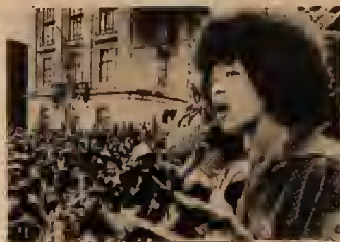
Angela Davis in Raleigh

North Carolina, called by the NAARPR to protest the death penalty, Angela Davis said: "They must be trembling in Washington to see us holding hands today. Black, brown, red, yellow and white. Trade unionists, nationalists and progressive independents. And, yes, ministers and communists. Because," she said, putting her arm around Rev. Ralph Abernathy of the Southern Christian Leadership Conference, "here is a minister, and here," tapping her chest with her forefinger, "is a communist" ( New York Times , 5 July 1974). Abernathy pointed out that it wasn't only