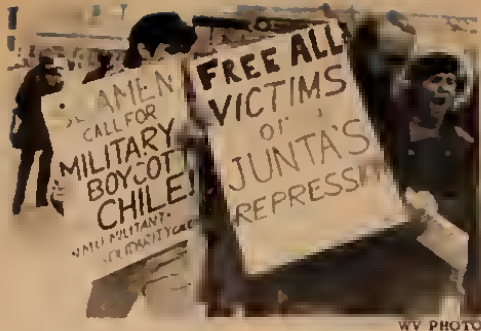
Seamen protest repression in Chile.