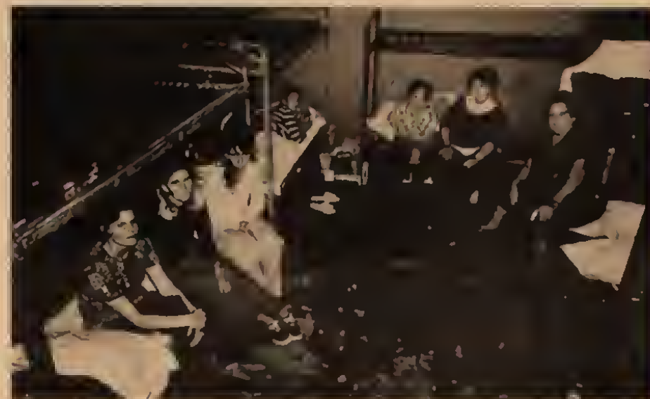
UNITED MINE WORKERS JOURNAL

Brookside women led picketing in Harlan County last October.