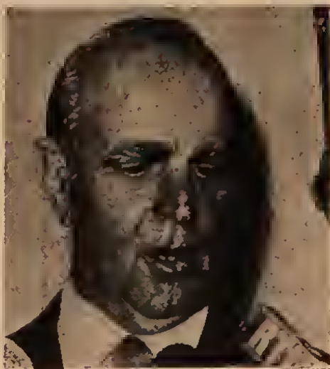
Greek Premier Constantine Caramanlis

The whole house of cards, which in any case was operative only on the condition that both Greece and Turkey ac-