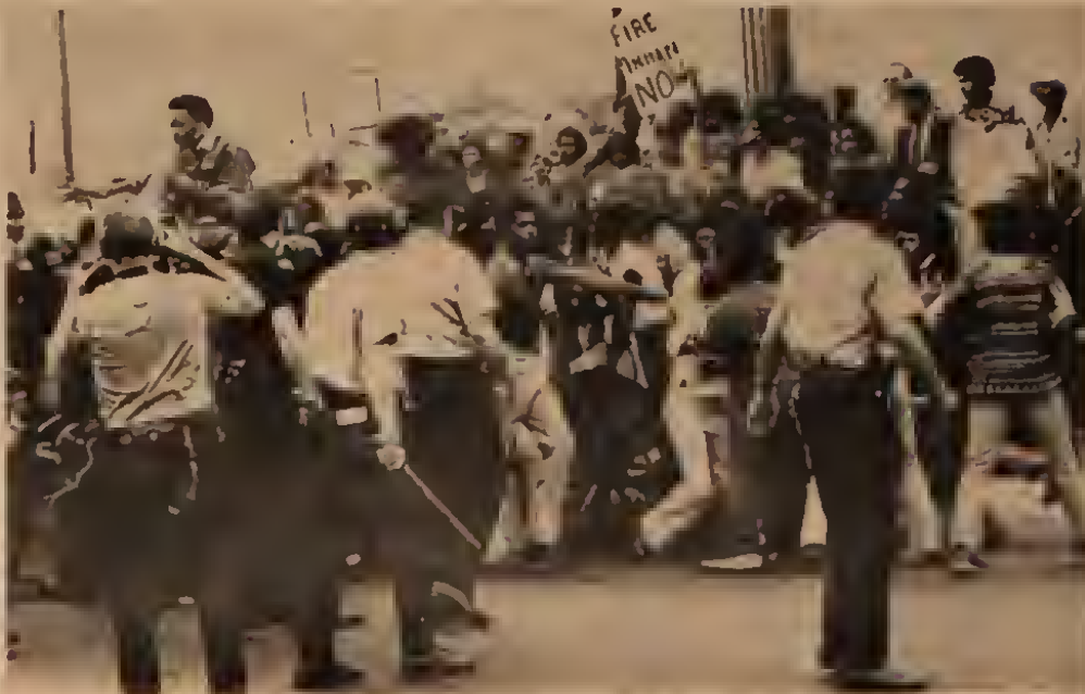
Cops attack Atlanto march against police terror, June 1974.