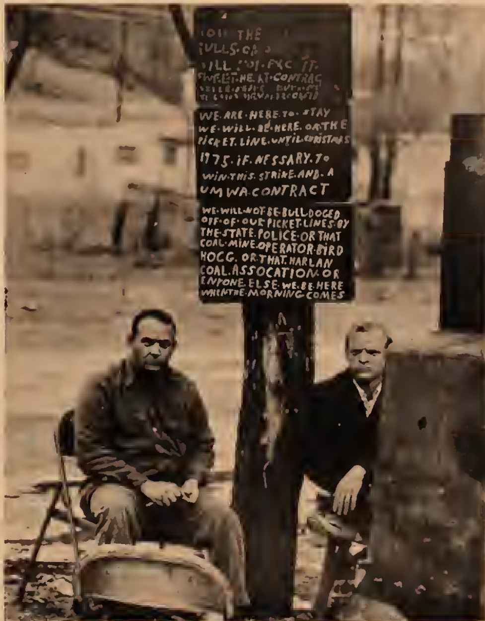
UMW strikers at Brookside mine.

The struggle at Brookside began in 1965 when Harlan Collieries, owner of the mine, decided not to renew the UMW contract. A long strike ensued, marked by considerable violence, with the company eventually succeeding in driving out the union due to the treacherous misleadership of the UMW's gangster president, Tony Boyle. In July 1970 the Duke Power Company, through its subsidiary Eastover Mining Company, bought the Brookside mine. (Around the same time Duke also pur-