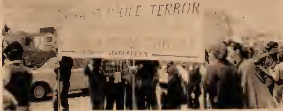
Boy Area SL/RCY demonstrators protesting murder of Tyrone Guyton.