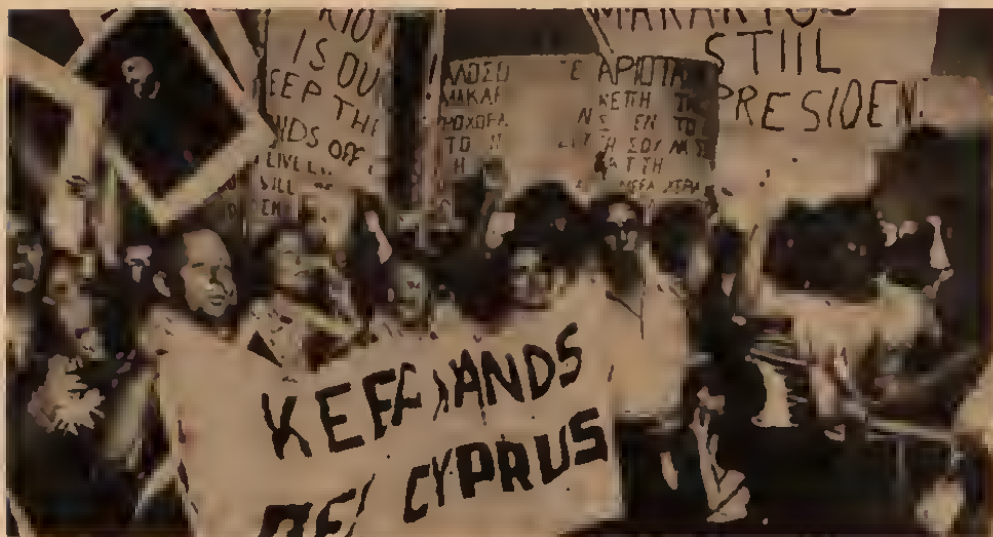
Greek Cypriot demonstrators greet Makarios in N.Y.