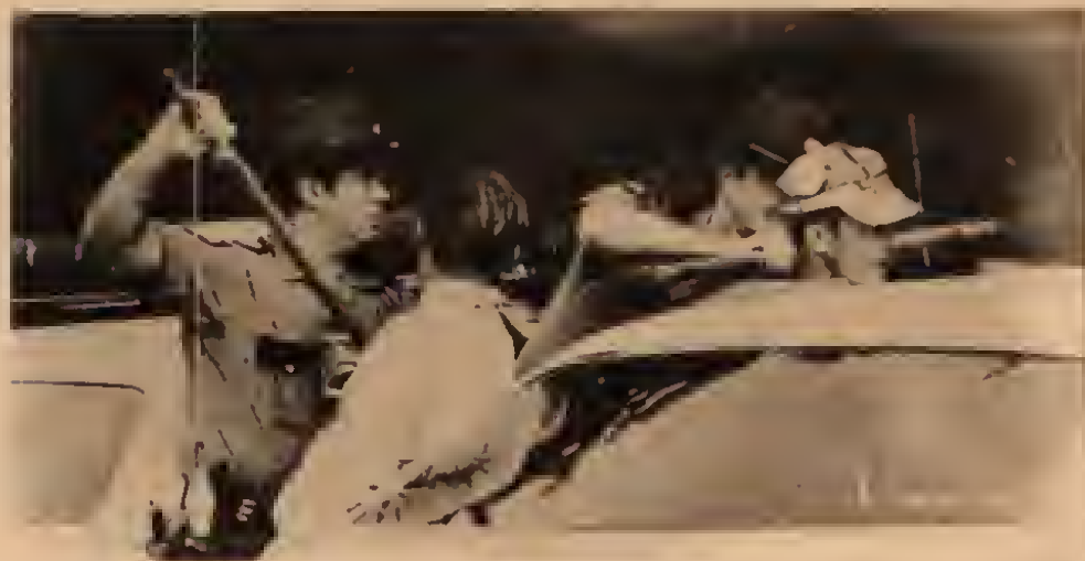
State troopers arresting pickets at Highsplint mine in July.

The second major issue is the necessity of real hospitalization coverage. Under the SLU "contract," Brookside miners paid one dollar a week into the union welfare fund. This fund totaled only $10,000 per year, a pitiful sum inadequate to cover major illness or injury among the miners. Thus most hospitals did not accept the SLU card. In comparison, the UMW contract requires coal operators to pay a "roy-