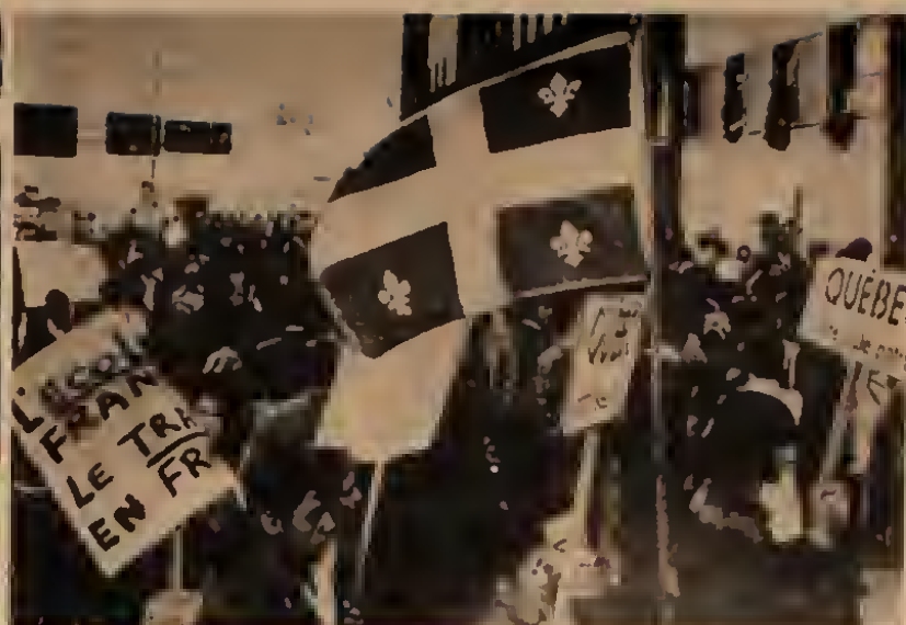
Left: Montreal language demonstration in October 1971 protests "anglicization." Right: Demonstrators demand French be language of instruction in schools.