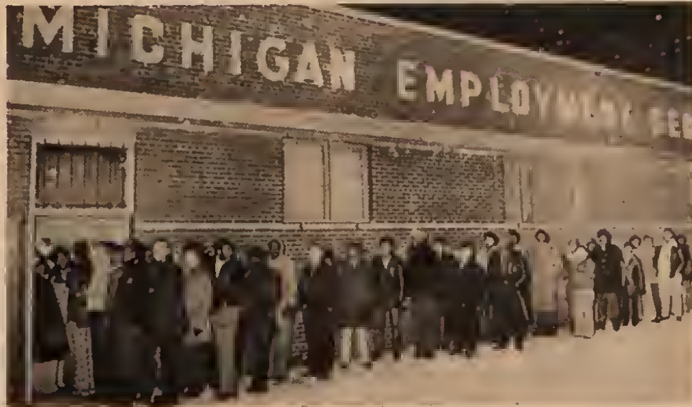
Unemployed line up in Detroit last winter during "energy crisis" layoffs.

Lacking any program to fight the economic crisis and threatening mass-