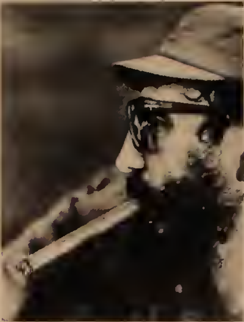
Fidel Castro.

Of course, increased relations with the imperialists pose dangers of counterrevolutionary subversion. This is