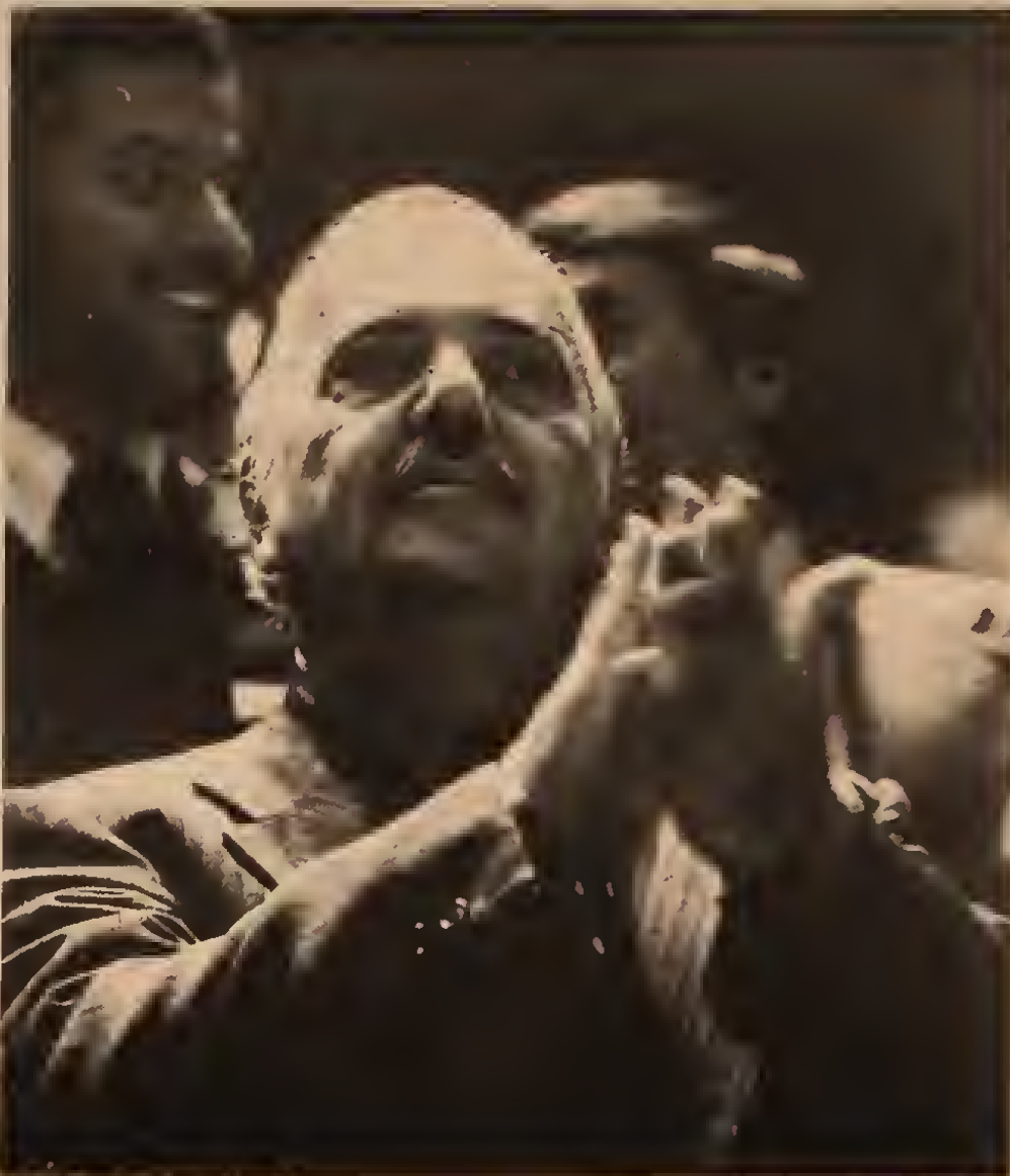
PSP leader Juan Mari Bras

perate to represent "all shades of opinion" that they invited N.Y. television commentator Geraldo Rivera who is detested by many independentistas and universally considered an opportunist. Sporting an expensive white suit and a T-shirt with the Puerto Rican flag, Rivera was booed both when he said he used to oppose independence and when he announced his conversion.