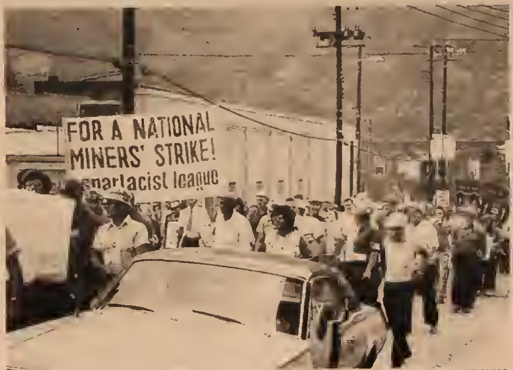
Miners march at Harlan, Kentucky, during UMW "memorial" in August.

A recent UMW Journal (1-15 October), while promising the union will back new organizing drives, states that "...the key factor, at Brookside, will be the miners themselves and their fam-