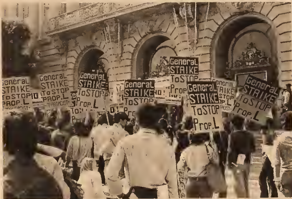
Demonstrators at October 19 rally against Proposition L.

think that is the gist of why we are going to get defeated...."