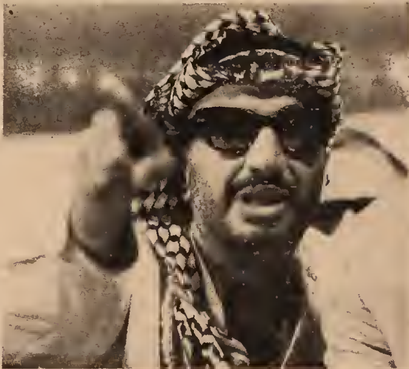
Yasir Arafat, head of Palestine Liberation Organization.

Moreover, the U.S. terror serves to maintain a world system of exploitation and oppression while the nationalist commandos are motivated by a desire for the emancipation of their people. We in no way defend mass terror against innocent working people. As communists we point out that the only way to a truly democratic resolution of the Palestinian question is through forging a mass Arab-Hebrew revolutionary workers party in a struggle for the Socialist Federation of the Near East. ■