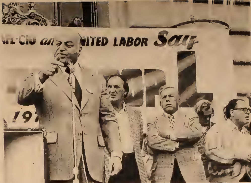
S.F. Mayor Joe ("Zebra") Alioto