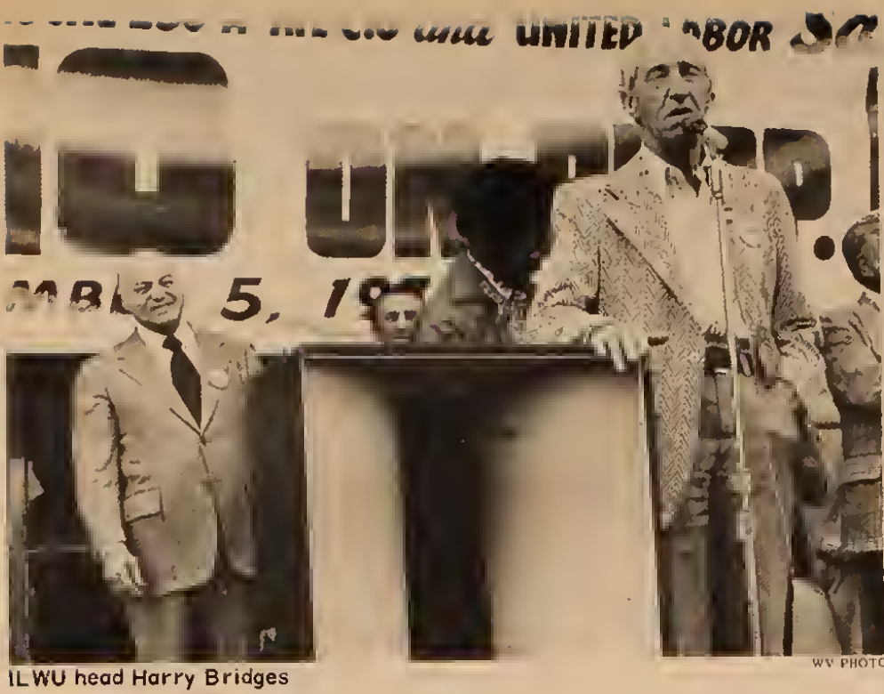
ILWU head Harry Bridges