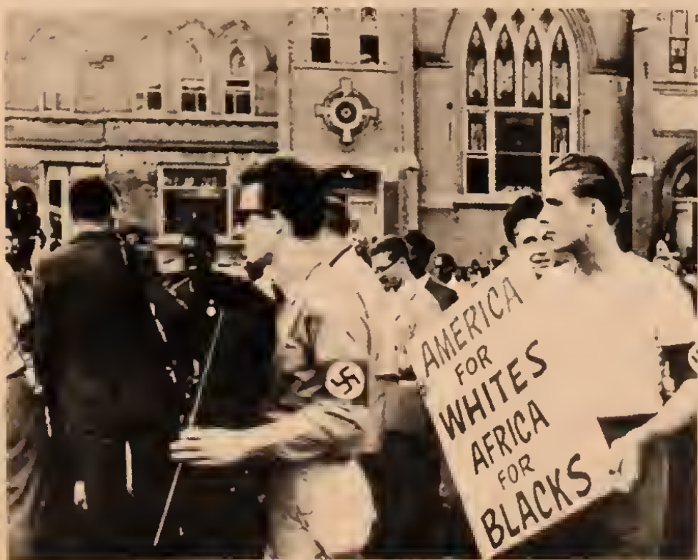
Federal troops not the answer to fascists.