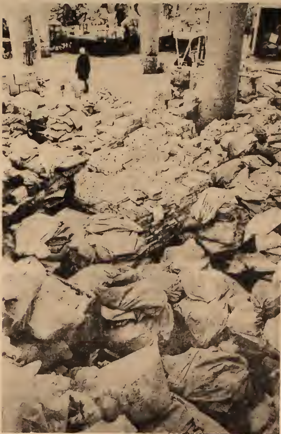
Mail stacked up during April's postal strike in Toronto.

dian sympathizing organization of the so-called "United" Secretariat. RMG supporters function as individual militants while awaiting the spontaneous generation of an "organized vanguard layer" of postal workers who will lead their own struggles.