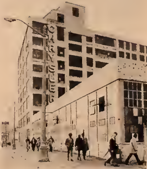
Jefferson Assembly Plant, Detroit.

What Is the Communist Labor Party?...page 7