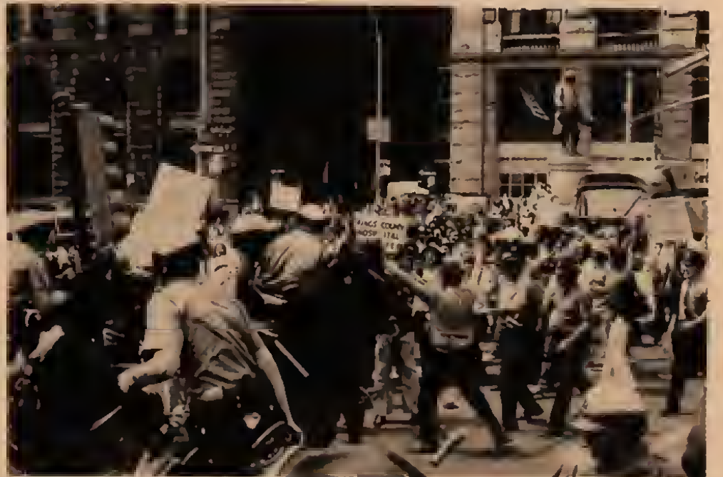
Police attempt to break up militant hospital workers demonstration in New York, July 24.