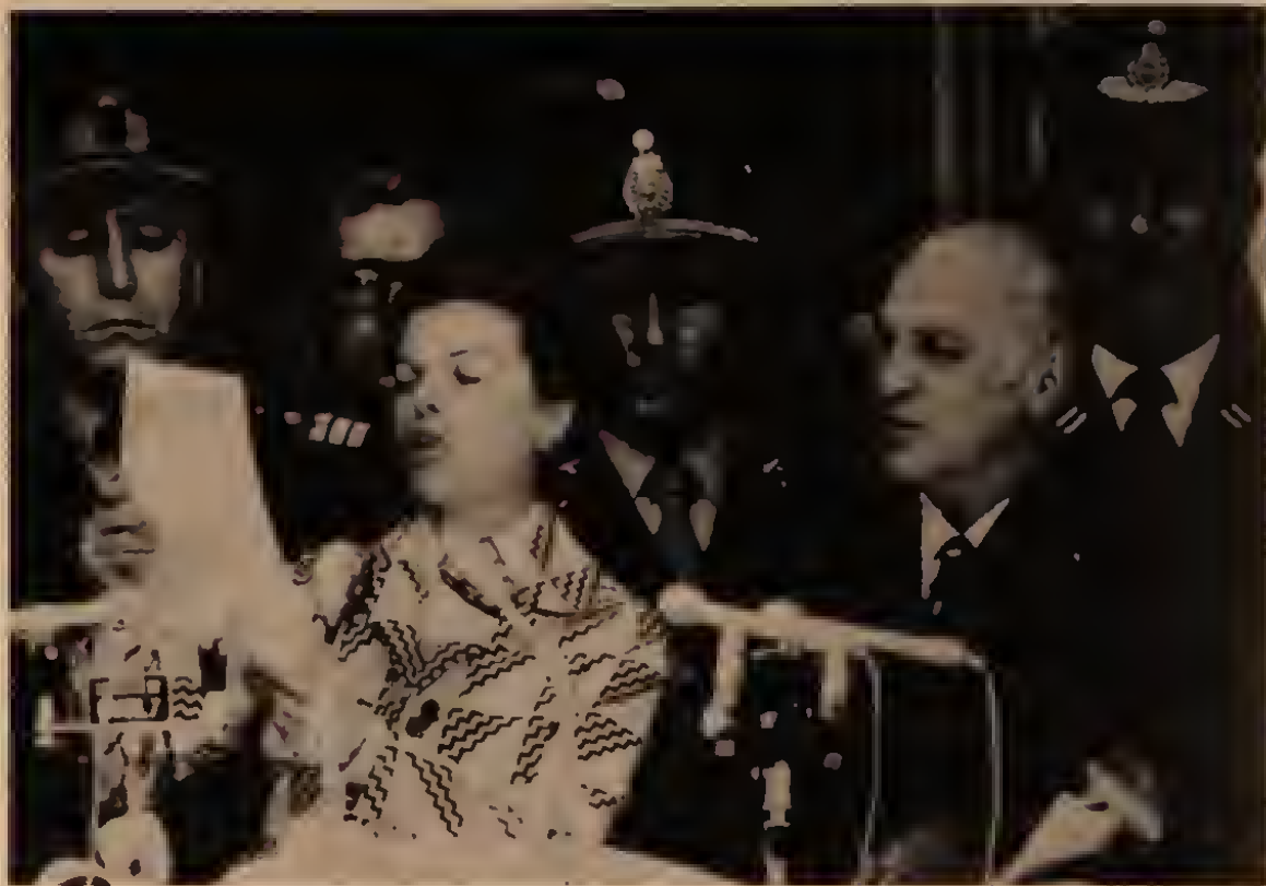
Isabel Perón with López Rega and the generals.

The Peronist legislators (joined by members of the main opposition parties) proceeded to elect Italo Luder, a moderate Peronist, to the vacant post of president of the Senate. This was a clear slap at Isabel Perón, as Luder's new post puts him first in line of succession should