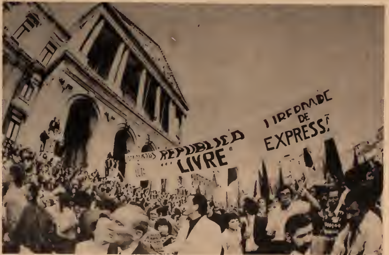
Portuguese Socialist Party demonstration in Lisbon, June 23.