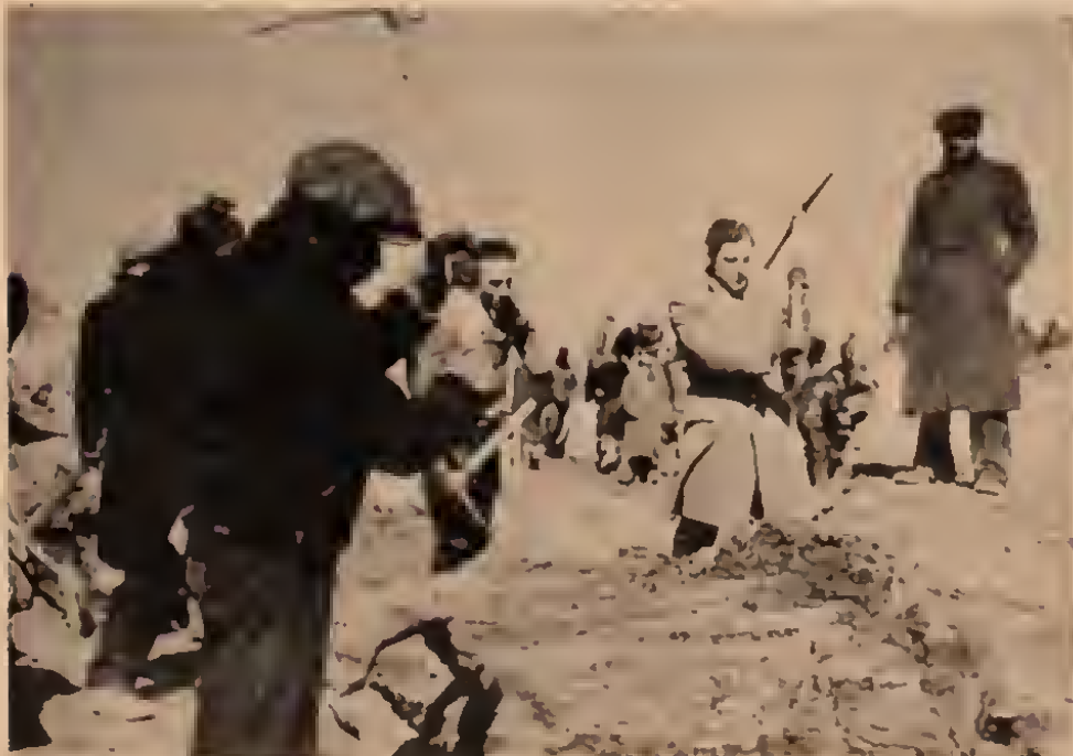
Federal work project during Roosevelt's "New Deal."

The lull in the class struggle following the 1934 strikes brought a sharp downturn in MCCW membership, the kind of fluctuations which plagued all unemployed organizations. Nevertheless, the Trotskyists went ahead with aggressive organizing of the jobless. AFL unions initially refused to cooperate, so Local 574 set up a "Federal Workers Section" (FWS), subordinate to the Drivers Local, but with an autonomous structure and open to all the unemployed in the city. With the power of the solidly unionized truck drivers behind them, the FWS launched a series of struggles which resulted in Minneapolis having one of the highest city relief budgets in the country. FWS organized workers on WPA, and when the project wage of $60.50 per month was found to be less than the dole, it forced the city to pay supplemental wages to bring up the WPA scale to the