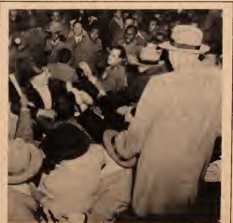
National Maritime Union