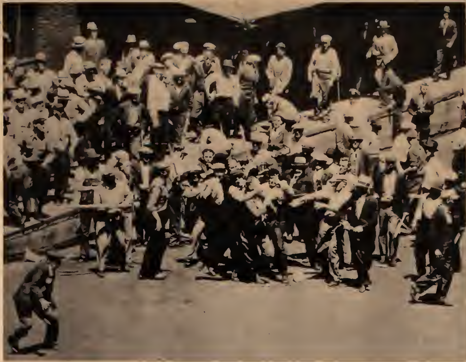
Workers battle police during 1934 Trotskyist-led Minneapolis Teamsters' strike. Many of the 4,000 unemployed workers organized in the MCCW militantly defended strikers' picket lines.