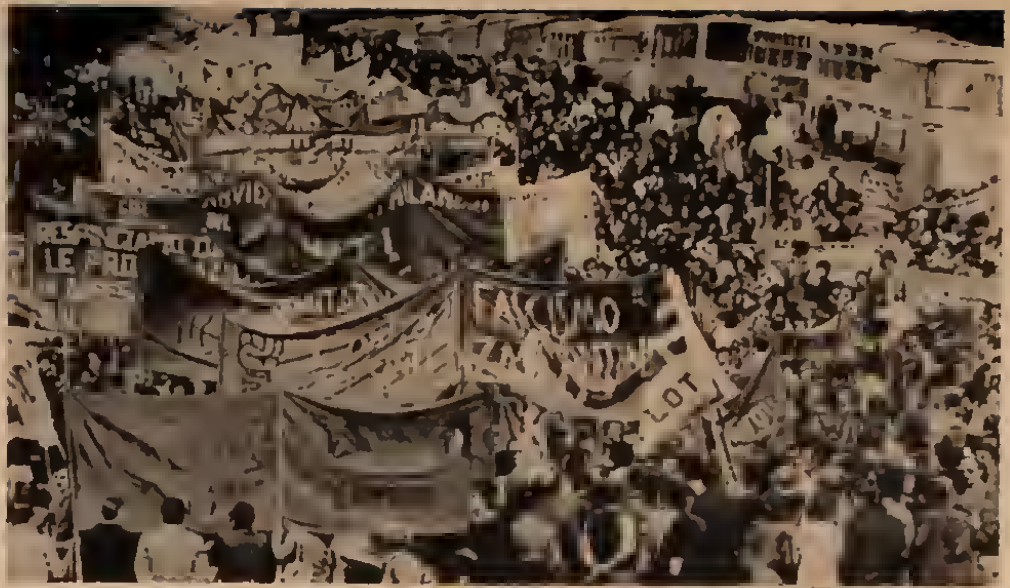
Demonstration against fascists in Milan in April.

The capitalist class is not always of one mind in political questions. There are powerful opponents of the popular front in the Italian bourgeoisie. Thus Fiat boss Giovanni Agnelli said last year that a coalition with the PCI would lead to a "rapid withdrawal of our country from the Western world" ( New York Times , 9 September 1974). Chief among the bitter-end opponents of any form of cooperation with the Communist Party is former premier Amintore Fanfani, long-time