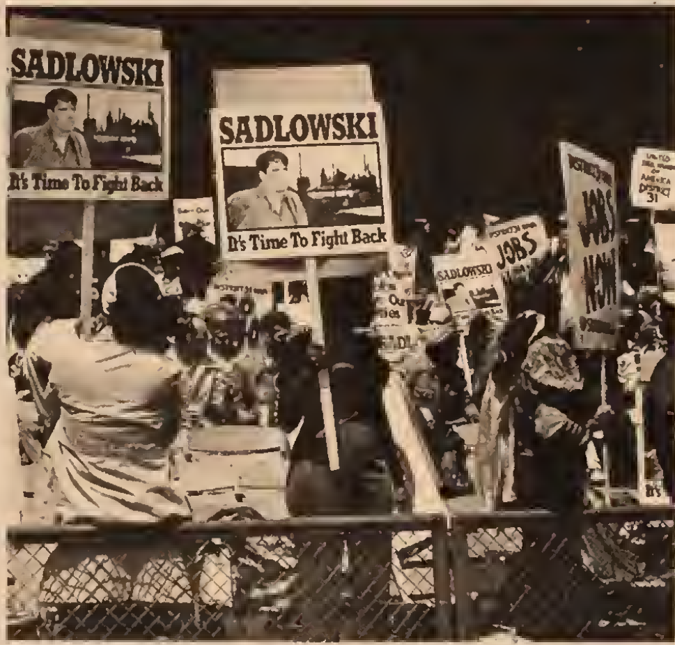
Sadlowski supporters at April 26 jobs rally in Washington, D.C.

Neither was there any attempt by the delegates to turn disgruntlement about unemployment into a fighting program to use the strike weapon to combat layoffs and mobilize the ranks nationally for a shorter workweek at no loss in pay. This would certainly be the last thing desired by the local leaders who passed the resolutions at the conference. Only a few weeks prior, officials of Local 1014 (U.S. Steel Gary works) managed to table indefinitely a resolution presented by rank-and-file local members demanding such a strategy. A real class-struggle opposition in the USW can only be built by first rejecting the "left" fakery presented by such local leaders and by Sadlowski.■