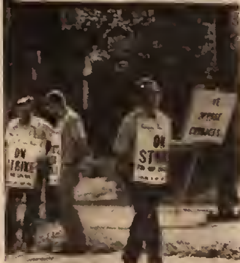
New York Times

WELCOME BACK STUDENTS WED 31 HAVE A GOOD YEAR FRESHMEN 8AM AND OTHERS 9AM SPEC DIV