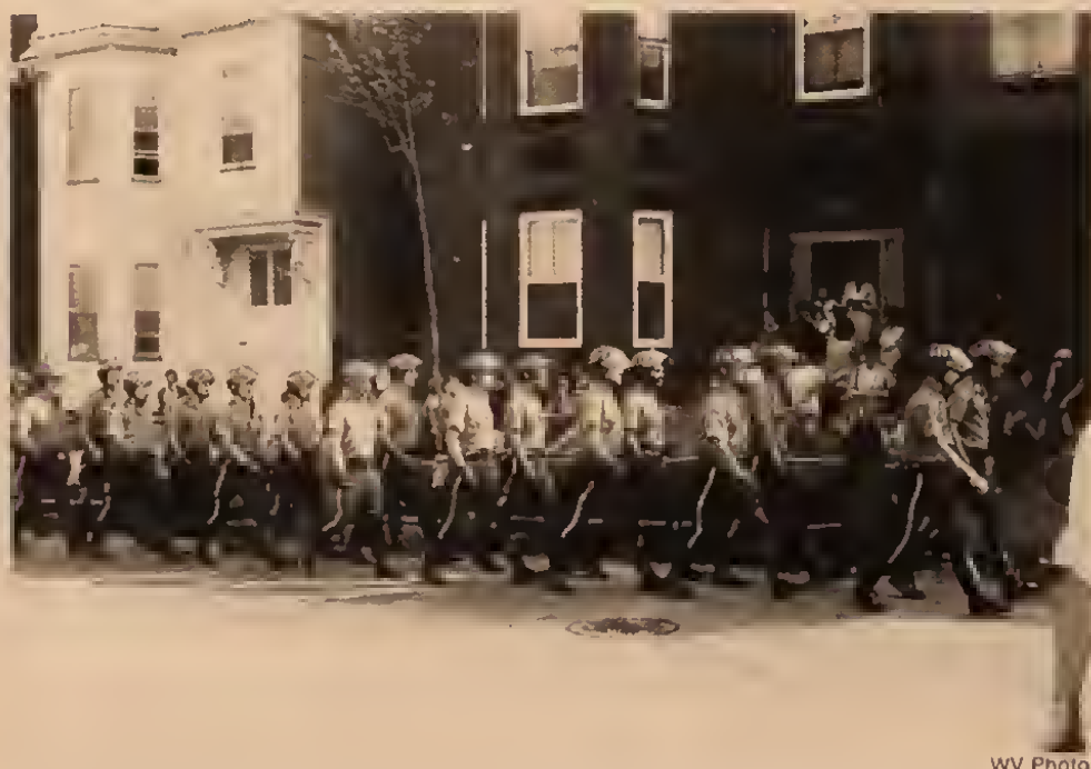
Boston cops marching through the streets of "Southie" last week.