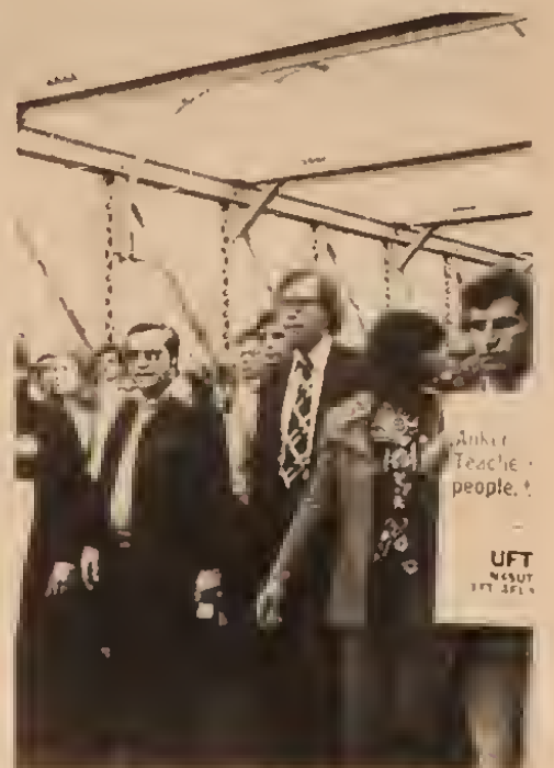
UFT president Albert Shanker