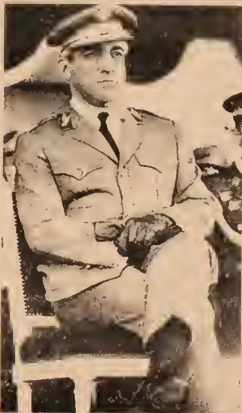
General Otelo Saraiva de Carvalho, head of elite COPCON strike force, jailer of Maoists and unionists, darling of the PRP and other "far left" groups in Portugal.

Indeed, Carvalho has always been ready to advance without fear, against the workers . It was Carvalho who sent his Continental Operations Command (COPCON) troops against the TAP airline strikers and striking employees of the Jornal do Comercio in September 1974. It was Carvalho's COPCON that on November 4 of last year arrested the top leadership of the Maoist MRPP for attacking an office of the ultra-rightist