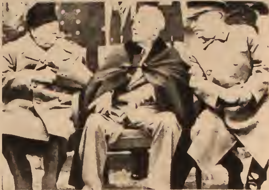
Churchill, Roosevelt and Stalin at Yalta.