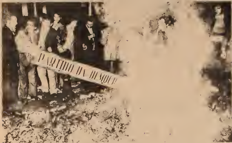
Portuguese leftists ransack and burn Christian Democratic headquarters last March.

In the southern region around Evora agricultural work became completely paralyzed in mid-September as thou-