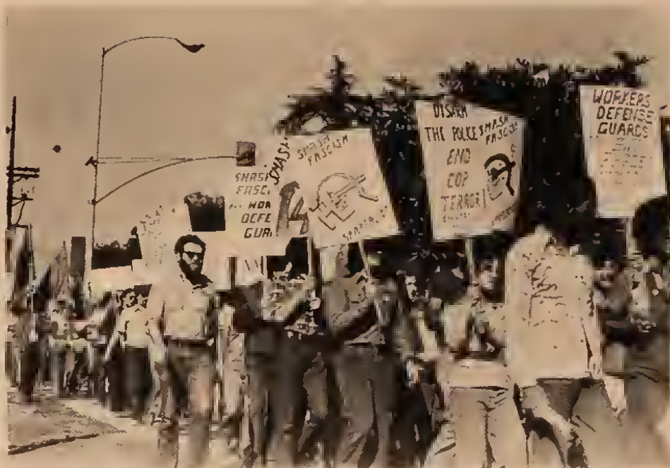
October 26 demonstration in Pasadena.

The SWP played a disgusting role in the planning meetings and at the