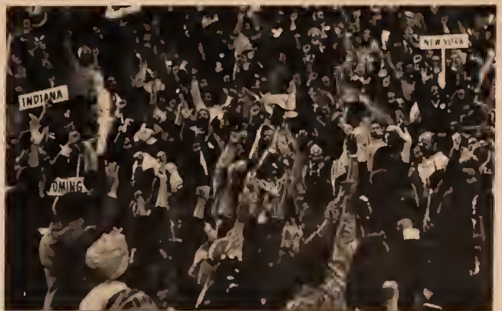
Black Political Convention in Gary, Indiana.

The vague catch-all character of the Agenda flowed directly from the attempt of the convention organizers to paper over the class antagonisms that exist among black people, uniting black workers and potentially revolutionary students, community organizers and rank-and-file members of nationalist