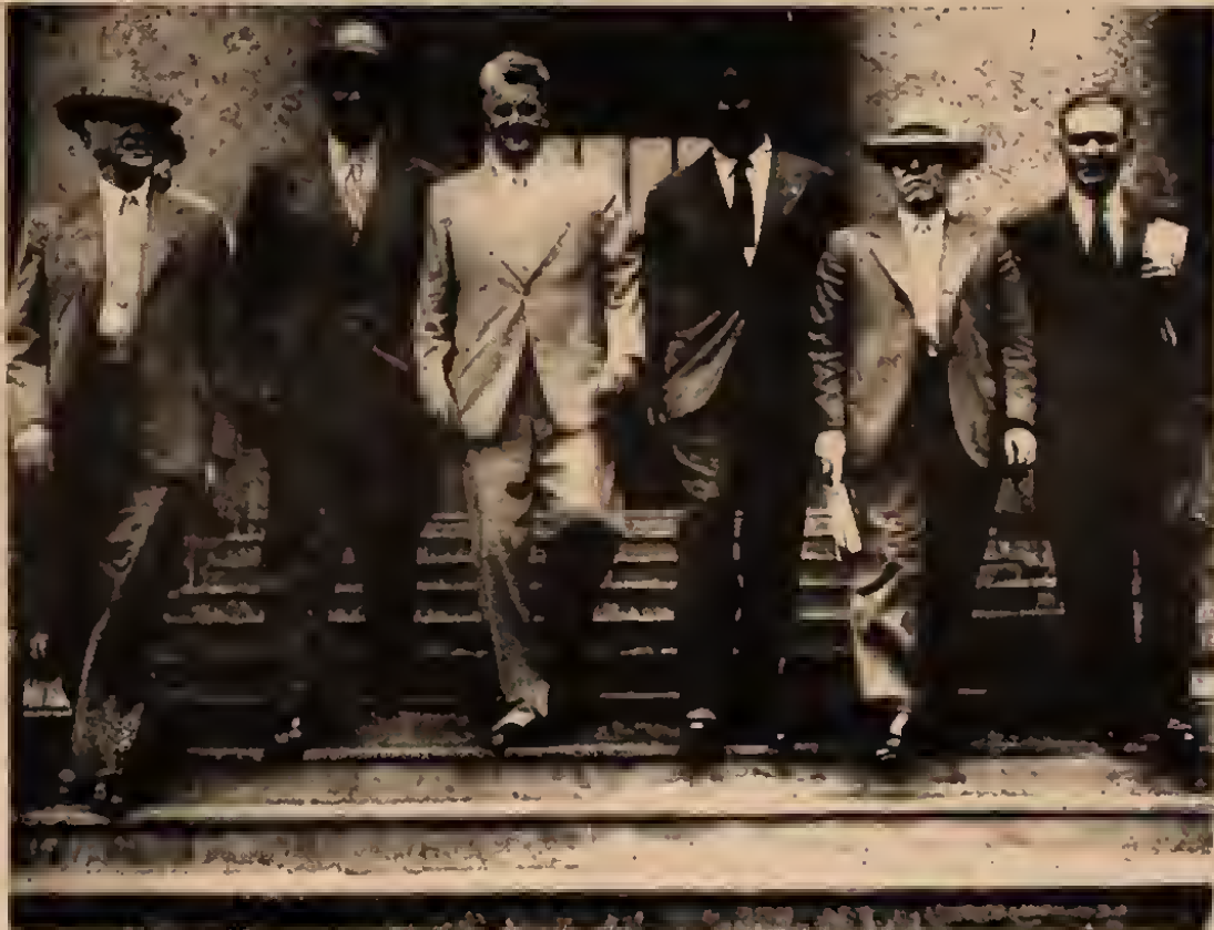
Six of the defendants in the first Smith Act trial: William Z. Foster, Benjamin Davis, Eugene Dennis, Henry Winston, John Williamson and Jack Stachel.

CP's Smith Act victims— 1949. DAILY WORLD presents them as "the first."