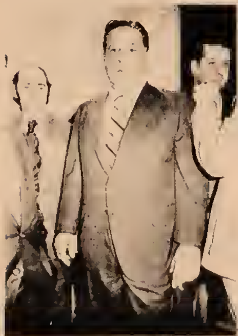
Frank Rizzo with "Labor for Rizzo" supporters in 1971.

As in 1971, the majority of the labor bureaucracy backed Rizzo and threw the support of the 225,000-member Philadelphia AFL-CIO behind his campaign. Thus they must bear responsibility for every atrocity he commits in office. Their criminal betrayal fuels the fires of race war. At a time when the working class and black masses desperately need a program and leadership to fight racial division and the continuing erosion of their standard of living, these self-serving bureaucratic fakers represent the major obstacle to the working people taking up political struggle in their own name. Labor must break with the Democratic and Republican parties and with bourgeois "third party" candidates like Bowser. A class-struggle leadership is required to dump the reactionary bureaucrats and build a workers party. ■