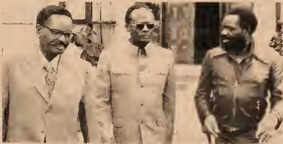
From left: Agostinho Neto (MPLA), Holden Roberto (FNLA) and Jonas Savimbi (UNITA).

The left-nationalist MPLA and its international supporters generally try to make Roberto appear as a simple puppet of Washington, while arguing that he has no base of support. But in fact there is no doubt about the support of the Bakongo peasants to their