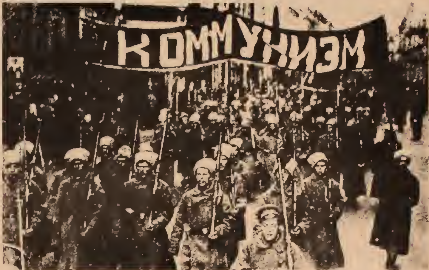
Red soldiers in Moscow demonstration, 1917: banner says "COMMUNISM."

The test of the 1903 split came in 1917: "The Bolsheviks brought the Russian