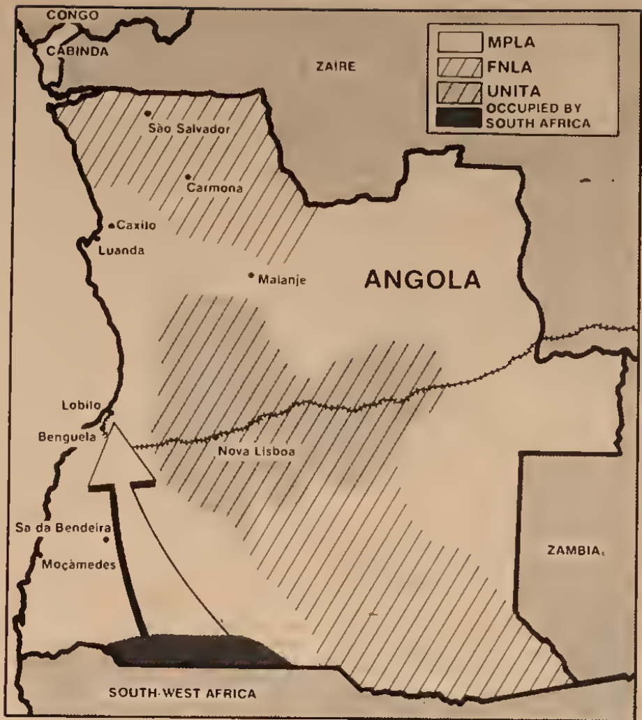
Zones of influence reflect conditions as of early November, 1975. Arrow indicates mercenary-led FNLA/UNITA column.

ports. Predictably the governing MPLA used its authority against the strike. The MPLA-dominated union, SINTAPA, denounced the longshore strike as a wildcat and called upon the government to take adequate measures to restore law and order. In power by itself the MPLA would without a doubt move quickly to subordinate the unions to the state, as similar left-nationalists did in Guinea, Ghana and Tanzania in the early 1960's. Its instrument for doing so would be the peasant guerrilla army which is removed from and uncontrolled by the urban masses.