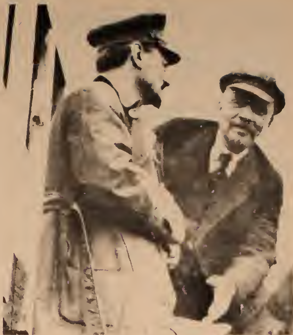
Trotsky and Lenin at Second Congress of Comintern.

—V. I. Lenin, "To the Citizens of Russia!" 7 November 1917