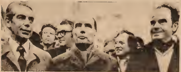
New York Times

In 1936, leaders of popular-front government after smashing general strike. From left: Socialist premier Blum, PCF leader Thorez, Interior minister Salengro.