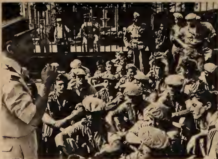
Soldiers sit in at Draguignan last year.