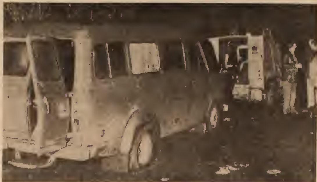
Minibus which carried ten Protestant workers murdered on a country road in south Armagh, Ulster, on January 5.

The response of Harold Wilson's Labour government in London to the January 5 massacre was to bolster