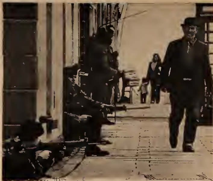
British soldiers on the streets of Crossmaglen, south Armagh.

The year 1975 also saw an escalation of factionally motivated murders within the "Republican" movement. In December 1969 the IRA split into the "Officials" and the more right-wing and militarist "Provisionals." Since then there has been an intermittent state of civil war between these organizations