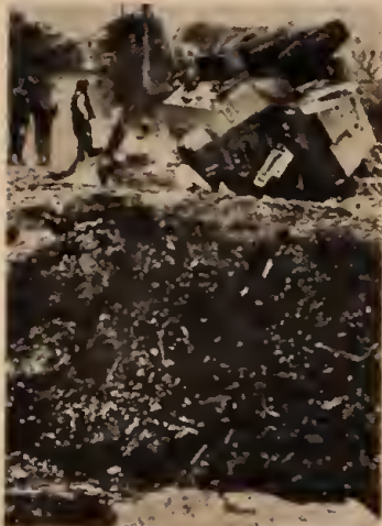
Tank destroyed by IRA.

Marxists must demand that the British Army get out of Northern Ireland, that the RUC and UDR be abolished and the Special Powers Act wiped off the books, and that anti-sectarian workers militias be organized to defend the Ulster working class from terror of both the Orange and the Green. ■