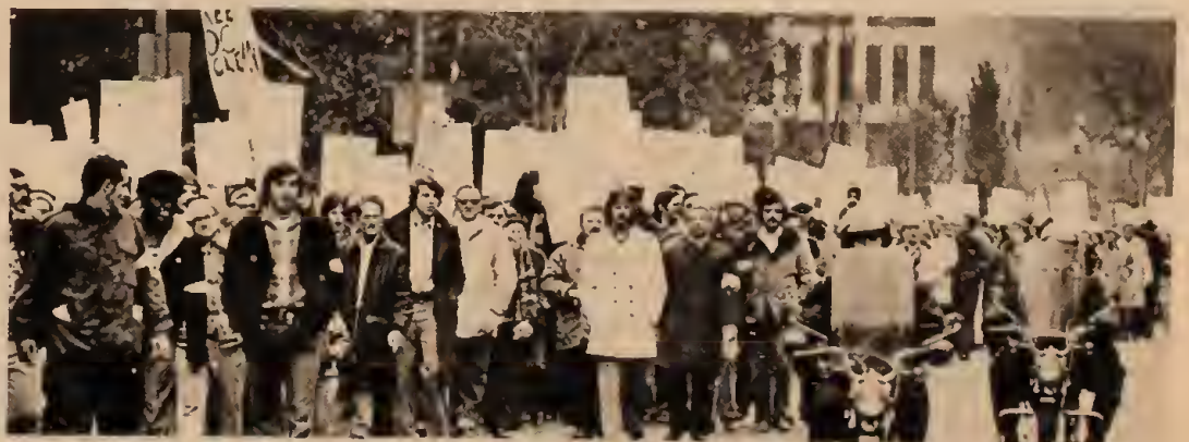
The Trades Unionist

Three thousand union supporters of striking Washington Post pressmen demonstrating their solidarity in December.