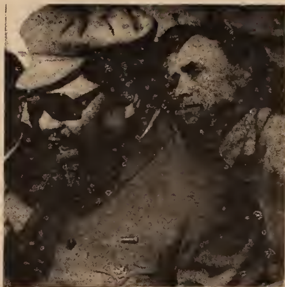
Robert F. Williams