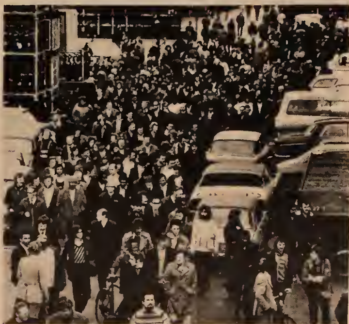
Workers leaving British Leyland's Cowley plant.