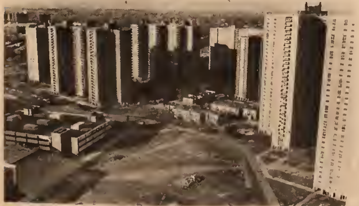
Co-op City on the outskirts of the Bronx, New York City.

By the late 1960's, the most capable American political ideologues knew there were not going to be "two, three, many Vietnams" (a point which the New Left radicals implicitly acknowledged as they turned from "Third World" adventurism toward workerism). Bourgeois strategists realized that the existence of Castro's Cuba a mere 90 miles from Florida and the military successes of the Vietnamese were, in the final analysis, based on the strength of the USSR. For