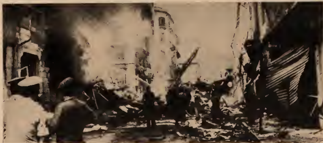
Results of a rocket attack in downtown Beirut.