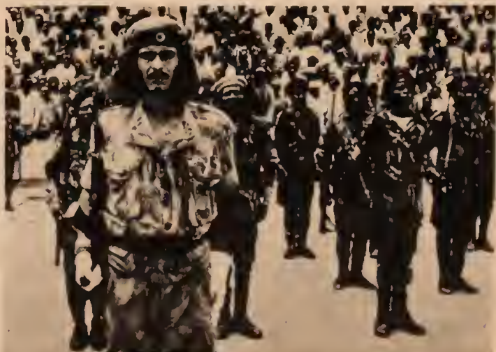
MPLA forces on parade.