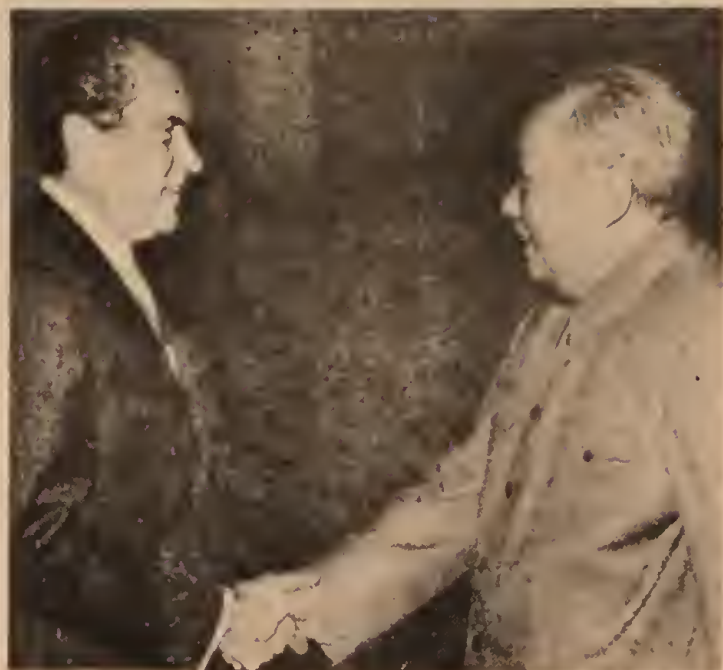
Mao Tse-tung greets Nixon in Peking, February 1972.

The New Left of the early/mid-1960's was a student-centered phenomenon conditioned by the explosion of violent social upheaval in the colonial world (the Cuban revolution, the Algerian war of national independence, the Vietnam war) combined with relative quiescence of the industrial working class in the advanced countries. This quiescence—particularly the failure of the workers movement to support the colonial revolution as did the students—was impressionistically seen as evidence that the proletariat of the metropolitan centers had become corrupted, junior partners of monopoly capital sharing in