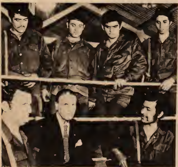
Pierre Gemayel, leader of the fascist Christian Phalange, surrounded by guard.