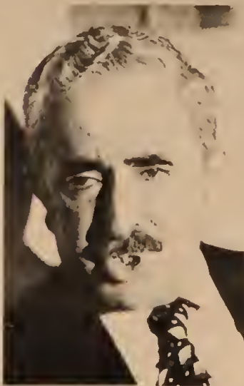
Lebanese premier Rashid Karami.

Make payable/mail to Spartacist Canada Publishing Association Box 6867, Station A Toronto, Ontario, Canada