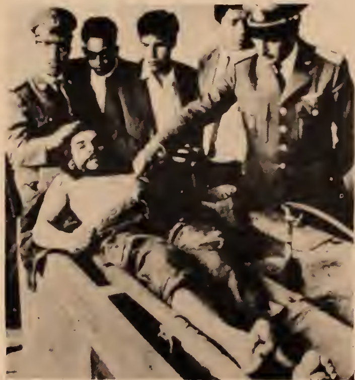
Body of Che Guevara after he was murdered in Bolivia, 1967. Today Mao's men are collaborating with Che's murderers.

As the UAW enters the 1976 bargaining round, it is the clear-cut crisis of leadership at the union's summit that is the auto corporations' biggest ally. The absence of an authoritative, nationwide class-struggle opposition to rally the union's ranks and expose Woodcock's treachery leaves auto workers discontented but without leadership. Both the Coalition, prominently backed by the International Socialists, and the seldom-hear-from Auto Workers Action Caucus (which did not even bother to make an appearance at the conference), touted by the Communist Party, refuse to pin the blame for bringing the union to its knees before the corporate offensive on Woodcock's do-nothing policies. Groups like the Labor Struggle Caucus, however, point the way forward for both a militant contract fight and the construction of the necessary class-struggle leadership for the UAW and the entire labor movement. The expansion of such groups' influence nationally is the key ingredient to halting Woodcock's plans for betrayal. ■