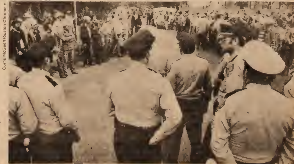
Houston police guard scab construction site against crowd of unemployed unionists.