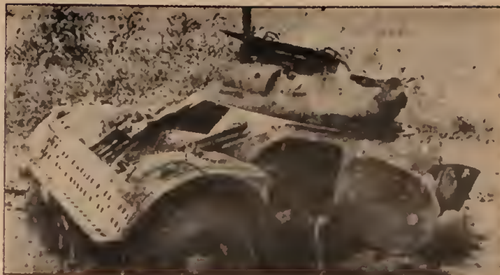
South African armored car.

"Q. What is the position of the MPLA on the presence of Soviet and Cuban troops and military advisers in Angola?"