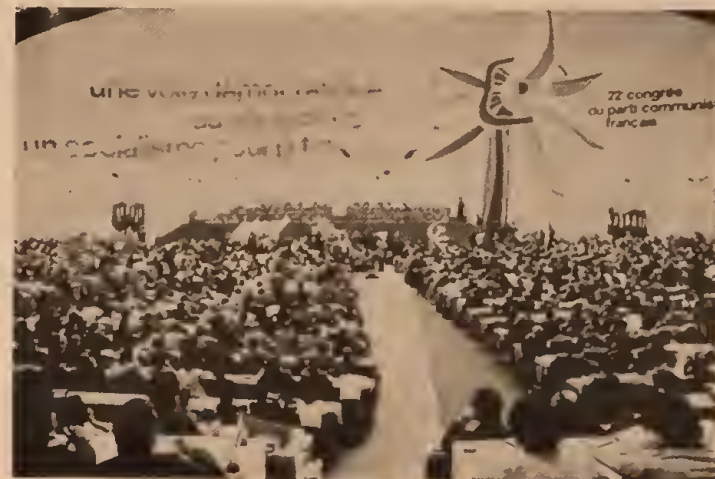
The 22nd congress of the French Communist Party.

In defending the abandonment of the dictatorship of the proletariat as their aim, French Communist Party leaders make much of their commitment to "democracy." This was further stressed