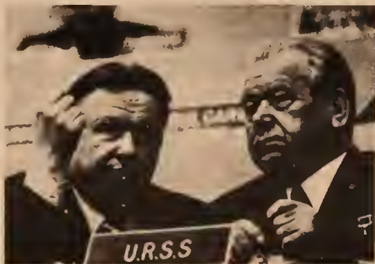
Russian delegates at the recent French CP congress.