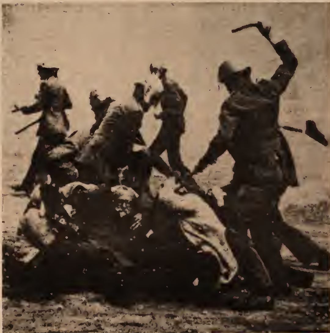
Spanish police club demonstrators in Barcelona, February 8.