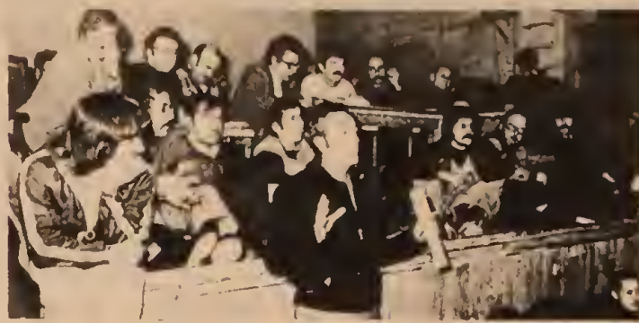
Workers commission meeting in Barcelona.

At Standard, the biggest private employer in the Madrid area with 12,500 workers, the strike was in its fifth