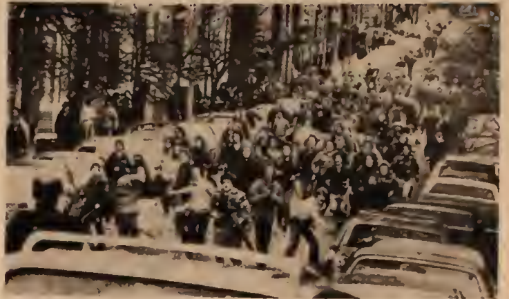
Racists charge police in South Boston last Sunday.

Black students are not demanding more cops inside the school but rather the assignment of aides reflecting the racial composition of the student body and a nondiscriminatory disciplinary system, "planned by parents represent-