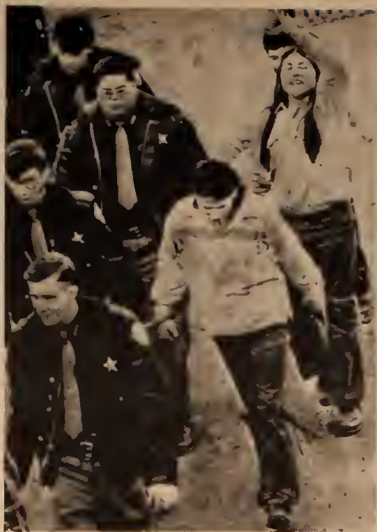
Members of the Menominee Warrior Society arrested after January 1975 occupation of Catholic novitate in Wisconsin.