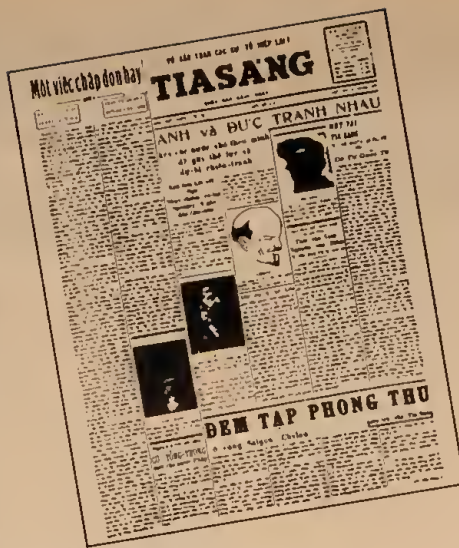
The real "first Trotskyist daily in the world." Tia Sang was published in Saigon in the 1930's by the Internationalist Communist League.