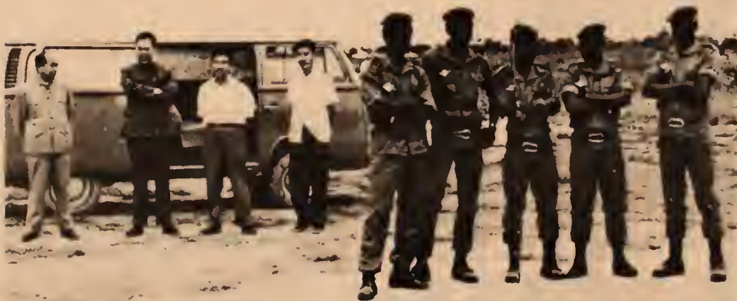
Chinese military advisors with FNLA soldiers.

The Stalinists and mindless "Third World" enthusiasts who led the cheers for the MPLA would do well to carefully follow the unfolding deal in southern Africa. While calling for military victory of the Soviet-backed MPLA and Cuban forces against the imperialist-led coalition, the Spartacist League gave no political support to the repressive, strikebreaking MPLA regime in Luanda. We have repeatedly noted that the MPLA has sought to and could reach a modus vivendi with U.S. imperialism and its ally, South Africa. Now such a deal is being openly discussed in Luanda, Pretoria and Washington. Only an independent workers party, linked to the powerful South African black proletariat can liberate the worker and peasant masses of Angola. ■