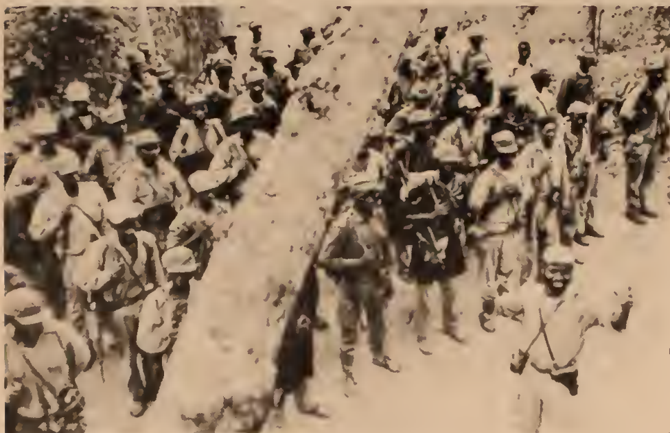
Samora Machel with FRELIMO guerrillas near the Rhodesian border.

MARCH 7—Mozambique's decision last week to seize Rhodesian (Zimbabwe) property and seal off the 800-mile-long border with the racist Salisbury regime has sharply increased military tensions in southern Africa. Mozambique president Samora Machel announced on March 3 that his country was in a "state of war" and ordered villagers in border areas to dig air raid shelters. He pledged to rigidly apply economic sanctions in response to an attack on a village called Pafuri carried out by Rhodesian jets and helicopters and an artillery barrage that left two Mozambicans dead and ten wounded.