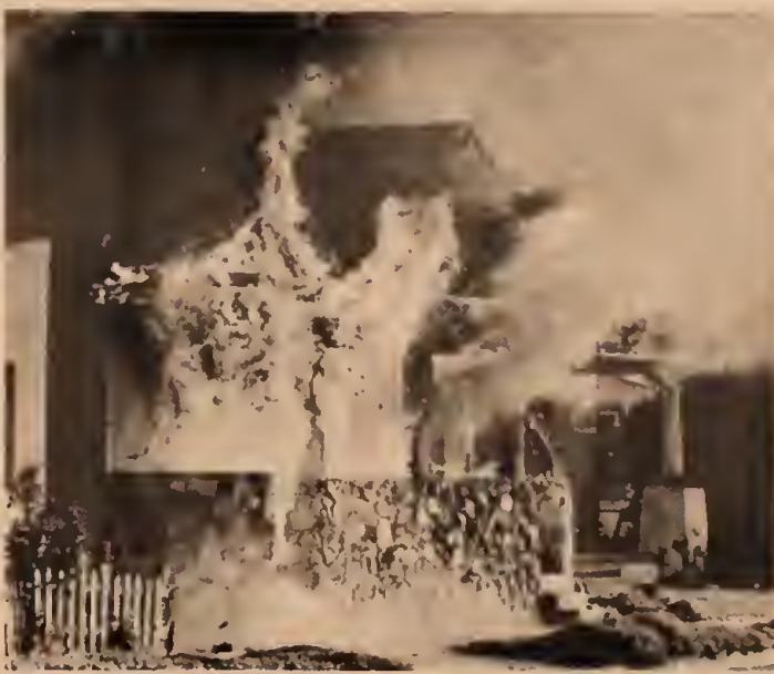
SLA hideout in flames after attack by more than 300 L.A. SWAT police and FBI agents in May 1974.