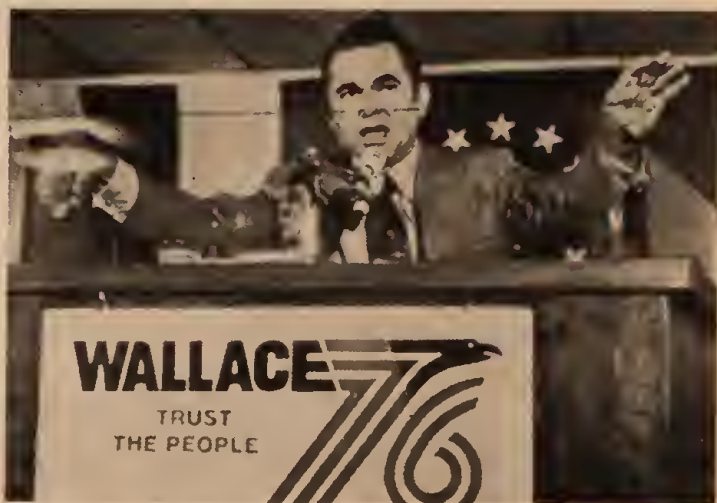
George Wallace campaigning in Boston.