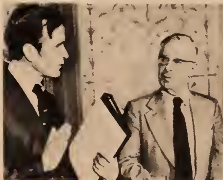
CIA-head George Bush with Daniel Schorr.