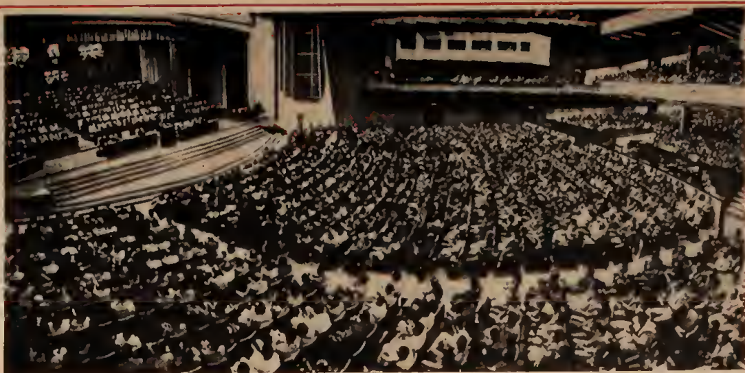
Cuban Communist Party Congress in Havana, December 1975.