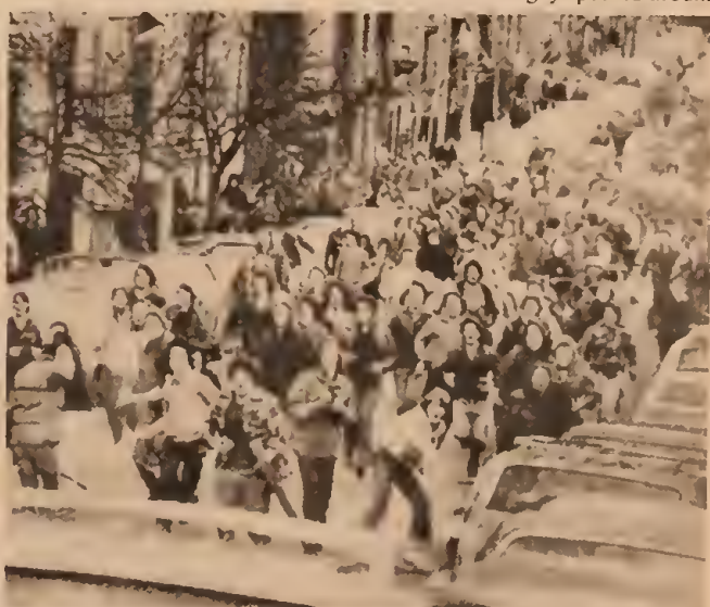
Ulrike Weisch/Boston Globe