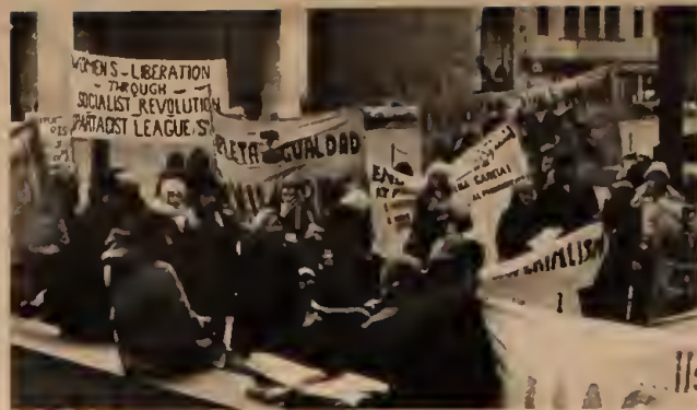
International Women's Day demonstration in Chicago.

These graphic demonstrations that "consistent feminism" hardly leads to socialism—contrary to the SWP's claims in justification for embracing