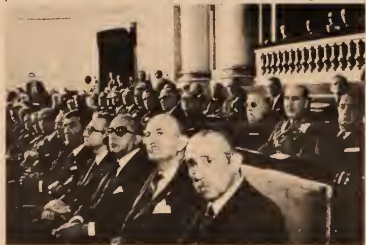
Members of the National Movement (Falange) sitting in the Cortes. Center, Prime Minister Carlos Arias Navarro.