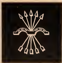
Symbol of the Falange

While united against "liberalizers," the "Bunker" is internally fragmented into numerous remains of the "families of Francoism." In April 1937 Franco had imposed unity of sorts on the civilian supporters of the "crusade" with a forced fusion giving rise to the Traditionalist Spanish Falange (symbolized by the yoked arrows). But while assuming the role of Jefe Nacional (National Leader), throughout the dictator's rule, his method was to act as a bonapartist godfather playing off several groups (notably the army, the church and the Falange) against each other. The passage in late 1973 of the "law of associations," permitting the formation of political groupings within the framework of the National Movement, led to further splintering. (After the defeat of Nazi Germany in World War II, the Movement replaced the