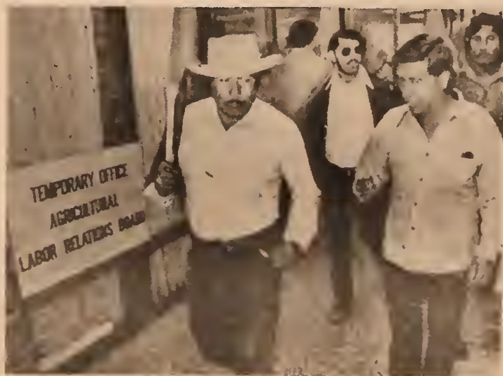
Cesar Chavez, right, picketing ALRB offices in Sacramento last September 6 in protest against pro-grower decisions of the board's legal counsel.

The Teamster/grower alliance killed the ALRB with a snap of its fingers,