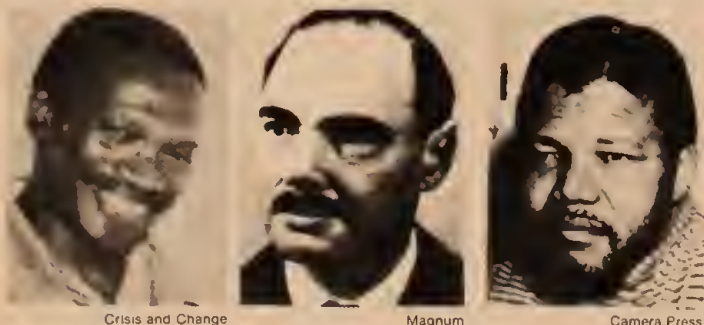
Crisis and Change

Order from/make checks payable to: SPARTACUS YOUTH PUBLISHING CO., P.O. Box 825, Canal Street Station, New York, N.Y. 10013