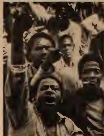
Attica prisoners during rebellion.