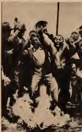
Anti-Apartheid Movement Passbook burning demonstration during the 1950's.

While the appearance of rifts among the exploiters can have a powerful impetus in accelerating the class struggle, what the reformist CP has in mind is quite different: to once more tie the workers to their oppressors by supporting the "progressive" capitalists (Progressive Reform Party leader Oppenheimer, for example, is the biggest mining magnate in the country). The sharpest political struggle against the Stalinist gravediggers of the revolution is necessary. A Trotskyist party, rooted in the black proletariat, must be built to lead the oppressed and exploited working masses of southern Africa to power. ■