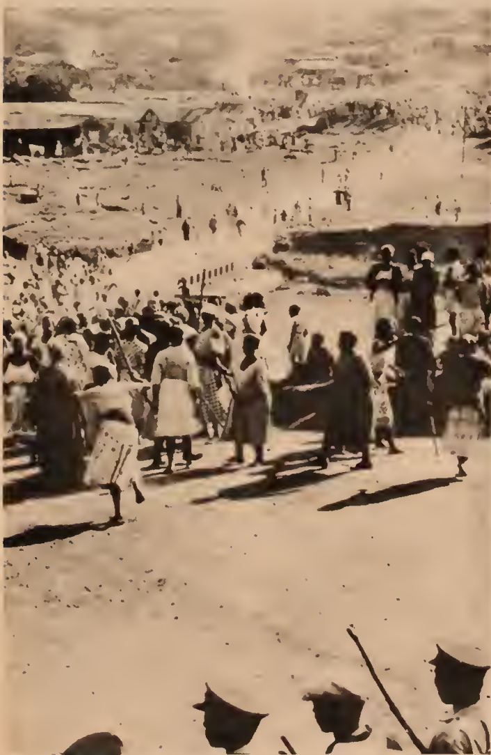
South African police break up demonstration of women in segregated "township" of Cato Manor.