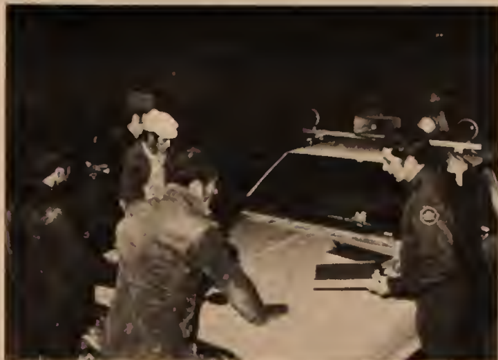
U.S. border police dragnets looking for "illegal aliens."

Sixteen years after the Sharpeville massacre, the ANC and PAC are isolated, largely exiled groups whose attempts to embark on the guerrilla road never posed a serious threat to white-supremacist rule. The solid wall of repression since 1960 was only breached by the mass strike wave of black and Indian workers that rolled across the country from 1973 to 1975, eclipsing the pacifist protests of the 1950's and the (largely verbal) guerrillism of the 1960's. This strike movement, surging past traditional barriers be-