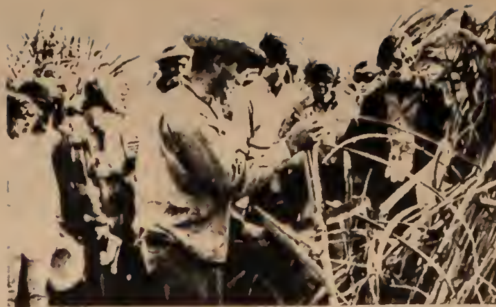
Venceremos Brigade members, many of them supporters of the RU (RCP), visited Cuba in 1970.

The RCP line on Cuba is one more nail in the political coffin of these discredited Maoist running dogs of U.S. imperialism. In the petty-bourgeois radical milieu from which the RCP draws its support and recruits, the Cuban revolution still commands great respect (and the Castro regime enjoys the confidence which these radicals incorrectly place in petty-bourgeois nationalists and Stalinists in all their incarnations). For over a decade the Cuban and Vietnamese revolutions have represented the epitome of "Third World" nationalism and anti-imperialist "people's war." Even for New Left Maoists, Castro and Ho Chi Minh were icons standing above the Sino-Soviet rift and its polemics. Al-