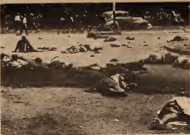
Aftermath of Sharpeville massacre, 21 March 1960. Police opened fire on demonstration against pass laws leaving 69 dead and 178 wounded.

A 1952 Natives Act consolidated all the mandatory identity cards carried by blacks into a single reference or pass book to be carried at all times. For the