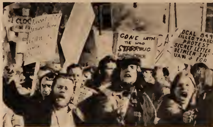
Auto workers demonstrate against UAW tops' secret agreement with the company in 1973.

Union leaders and contracts have failed miserably to protect workers against this economic abuse. The Woodcock leadership of the UAW brags expansively about the cost-of-living protection in its current contract, which it claims kept pace with inflation through a total average increase of $1.59 an hour since September 1973 ( UAW Solidarity , January-February 1976). But the most obvious facts about auto