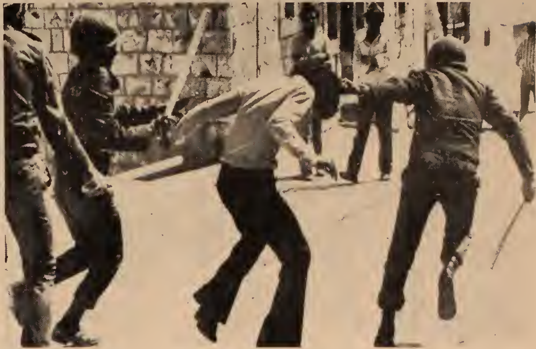
Israeli soldiers beat Arab youth in the streets of Nazareth.

One of the earliest was Kiryat Arba near Hebron. In 1968 a rabbi rented rooms in the area, ostensibly for Passover services. But the rabbi and his followers remained after Passover, defying expulsion orders. After a phony "confrontation" with the Zionist government, they were "temporarily" housed in an army camp and then provided with building materials. Now Kiryat Arba is an established communi-