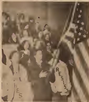
Left, anti-busing racists recite pledge of allegiance in Boston city council meeting. Right, later outside meeting youths attacked black lawyer with flag.

This atrocity was the bloody denouement of an anti-busing demonstration April 5. Several hundred white youths, among them Landsmark's assailants, had been welcomed into City Council chambers by council president