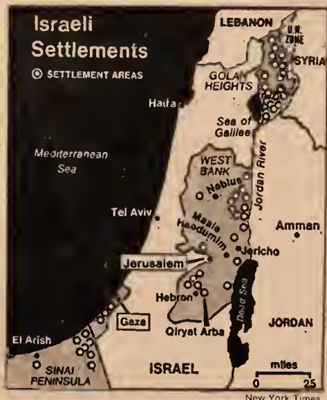
Map of Israel: shaded areas were occupied during 1967 war.

The demonstration was initiated by the Spartacist League/Spartacus Youth League (SL/SYL), which sent appeals to more than 30 ostensibly socialist and anti-Zionist organizations in the Chicago area, including Youth Against War and Fascism, the Iranian Students Association and Revolutionary Socialist League. Yet not even these coattail-hangers-on of a nationalist "Arab Revolution" bothered to demonstrate solidarity with the Palestinian protesters in Israel and the West Bank. In addition to the SL/SYL contingent, the picket was attended by militants of the Labor Struggle Caucus of UAW Local 6 and representatives of the Partisan Defense Committee, whose signs demanded "Free the victims of Zionist repression" and "For an end to the emergency regulations."