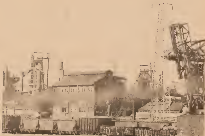
U.S. Steel's Southworks plant, Chicago.

USWA president I.W. ("No-Strike") Abel, however, does nothing to eliminate these conditions. In fact, he agrees with the companies that the "answer" is speed-up, eliminating strikes and protectionism. Abel's notorious "Experimental Negotiating Agreement" (ENA), signed without consulting the membership in 1973, bans contract strikes until 1980, while his class-collaborationist company/union "productivity" com-