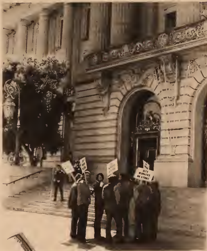
Striking city workers picket City Hall.