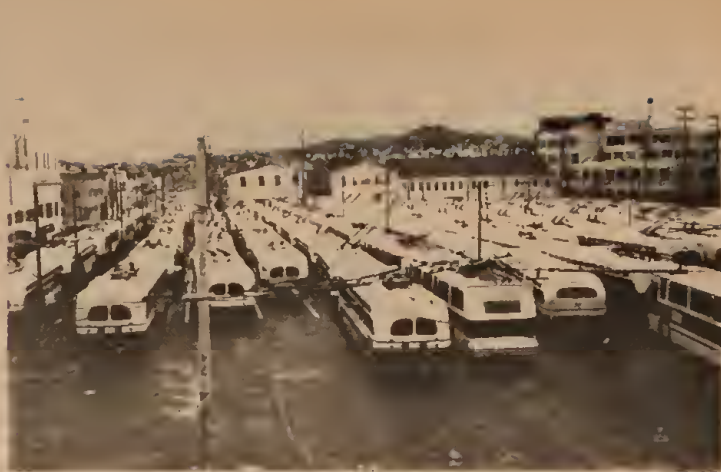
Idle trolley buses fill Muni yard.

There is no time to be lost. Delay at this point will lead to a collapse of the craft unions' strike and a stinging defeat for all. Now is the time for the working class to draw the line! ■