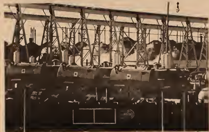
Bulldozers ready for shipment at International Harvester complex in Melrose Park, Illinois.

waiting. Furthermore, many of those now projected for layoff have no SUB remaining. Even the company admits that the new layoffs are "indefinite." What is clearly called for in this situation is an immediate strike against the layoffs, to be spread throughout the entire Harvester chain.