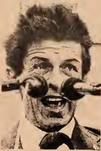
PCI leader Enrico Berlinguer

The task of the Trotskyists is not to give a left cover to this shameless electoralist class collaborationism, either through direct participation or "critical" support, but to provide intransigent Marxist criticism of the reform-