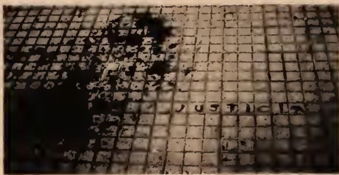
"Justice"—a bitter cry for freedom written in the blood of a worker slain by police at Vitoria, March 1976.

During his current "Bi-Centennial" visit to the United States, King Juan Carlos of Spain is issuing cynical pronouncements of "authentic democracy" in order to hide the blood-drenched reality of the Francoist dictatorship. The king's proclamation of a "new Spain" is a sham, designed to loosen the pursestrings of the U.S. Congress which is set to review the $1.2 billion treaty agreement with Madrid later this month.