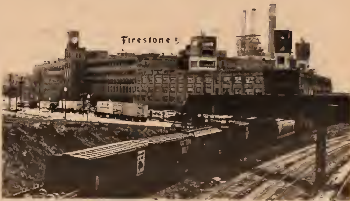
Firestone plant in Akron, Ohio.