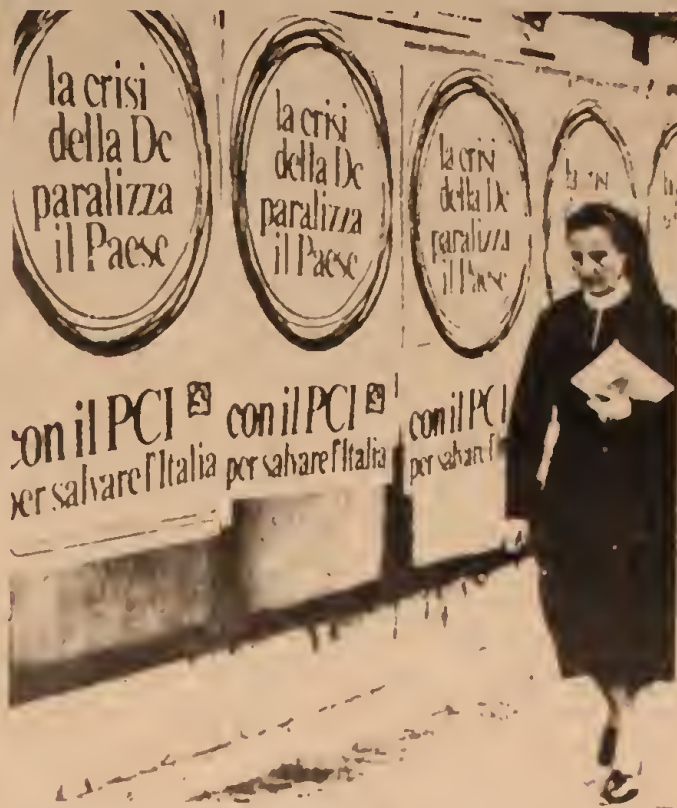
Italian Communist Party election posters proclaim: "The crisis of the Christian Democratic Party is paralyzing the country—Go with the PCI to save Italy."

Following the "administrative" (municipal and regional) elections last June 15, when the PCI boosted its vote above 33 percent, long-time Christian Democratic boss Amintore Fanfani was ousted as DC secretary and replaced by a colorless "center" politician, Benigno Zaccagnini, in an effort to "rejuvenate" the party. But the cliques, clans and fiefdoms of the ruling party are so entrenched that a year later no significant step has been taken that could spruce up the DC's electoral image. On the contrary, the Lockheed affair indelibly stamped the party as the very incarnation of corruption: in April it was revealed that a former premier had received bribes in exchange for facilitat-