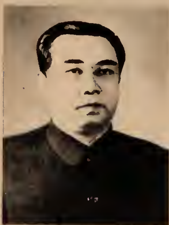
Foreign Languages Publishing House