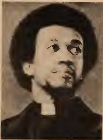
Rev. Ben Chavis

Meanwhile, government authorities had not abandoned their vendetta aimed at putting Chavis behind bars.