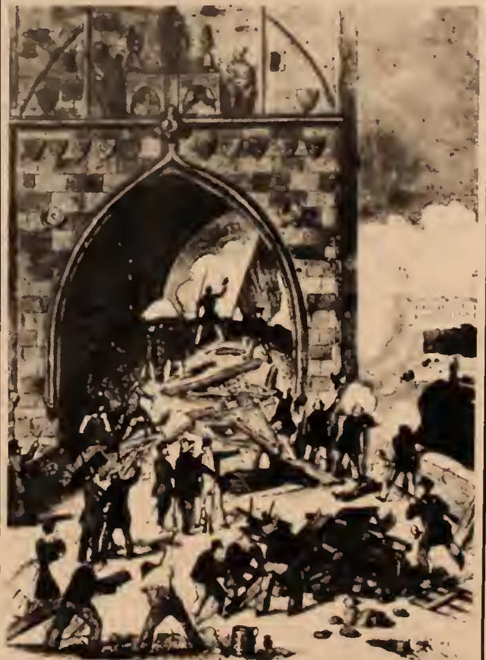
Czech rebels barricade Prague bridge during 1848 revolution.