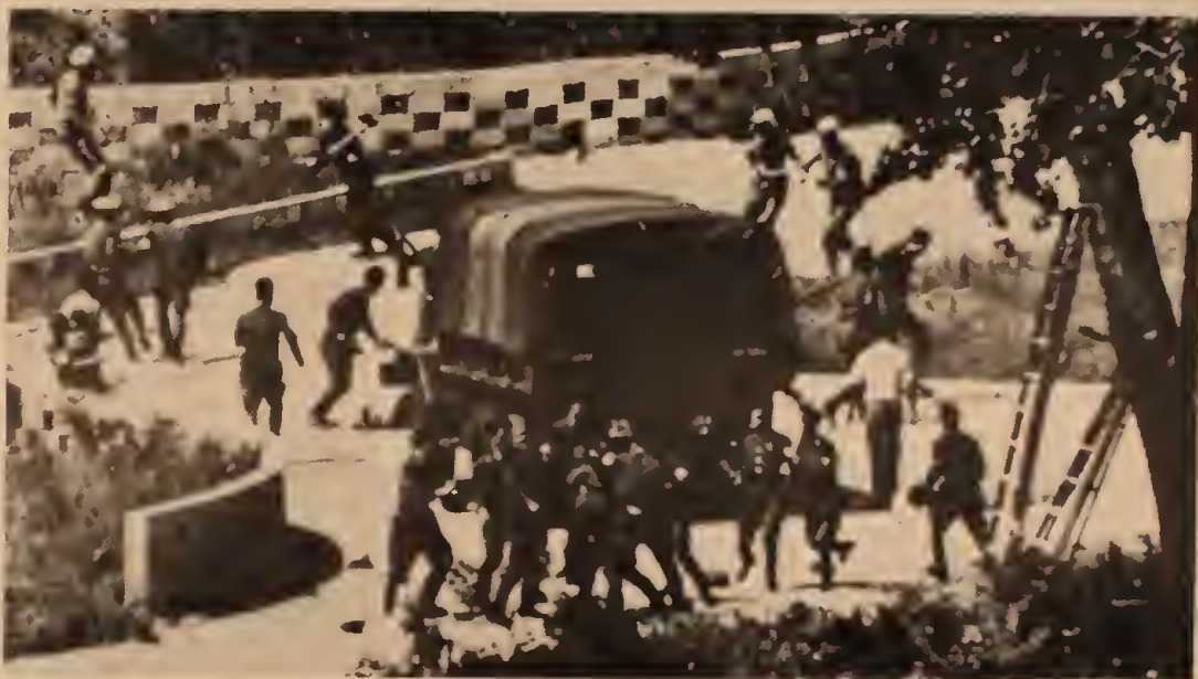
North Korean soldiers disperse U.S. and South Korean soldiers who refused to stop the pruning of a tree. The ensuing fight resulted in two deaths and over a dozen injuries.

President Ford may believe that his dangerous show of force in Korea can