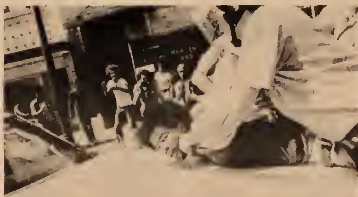
Participant in July Martin Luther King Jr. Movement march arrested after vicious attack by 10,000 racists armed with bricks and bottles.

The Spartacist League has repeatedly pointed out that only through the organization of powerful labor/black defense can the racist terror be rooted out. Neither the irresponsible adventurism of the I.S., the RSL's opportunism nor NAACP/SWP cringing reliance on Mayor Daley's racist cops and courts will stop the violence against blacks. Mobilization of the large Chicago labor movement to defend blacks and fight for decent, integrated housing for all is the only answer to the festering racial