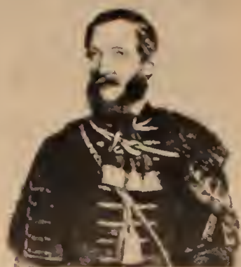
New York Public Library

tool of the English rule in Ireland . "This antagonism is artificially kept alive and intensified by the press, the pulpit, the comic papers, in short, by all the means at the disposal of the ruling class. This antagonism is the secret of the impotence of the English working class , despite its organization. It is the secret by which the capitalist class