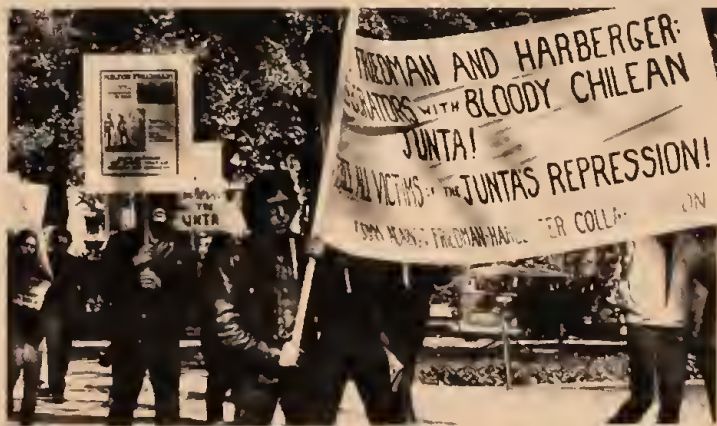
Protest rally at University of Chicago, in October 1975, against the collaboration of Friedman and Harberger with the bloody Chilean junta.

"One of the 'achievements' listed by the Nobel committee when they gave Friedman the prize," said an SYL speaker at the demonstration, "was 'his demonstration of the complexity of stabilization policy.' While Friedman enjoys his fancy lunch, Nobel medal and $150,000, hundreds of thousands of Chilean workers and their children are feeling the effects of Friedman's 'shock treatment,' which was supposedly designed to 'stabilize the Chilean economy.' This imperialist prize to Friedman