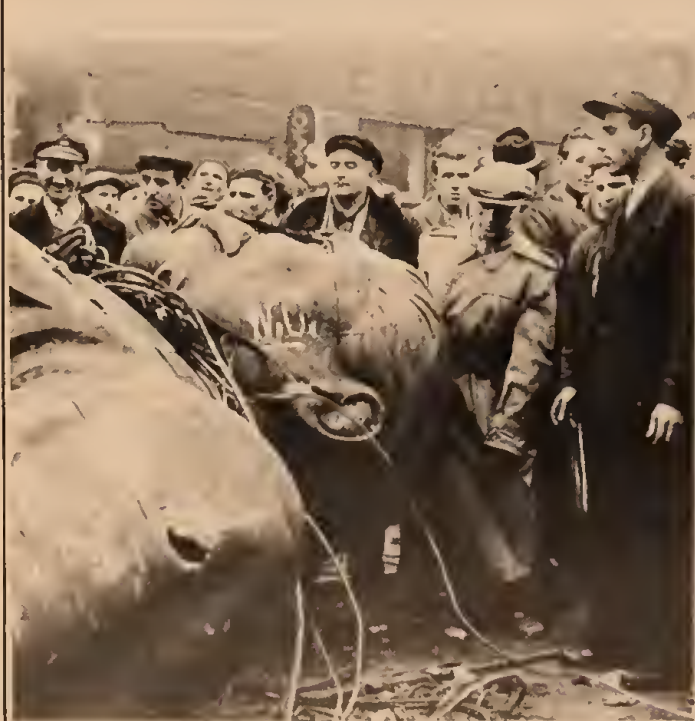
Budapest, 23 October 1956: The working masses rise up to topple the Stalinist bureaucracy.