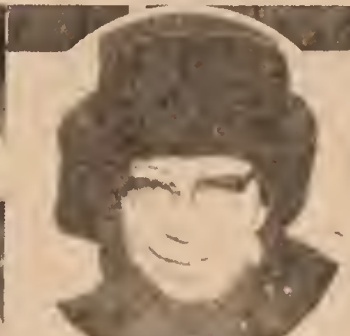
Globe and Mail (Toronto)