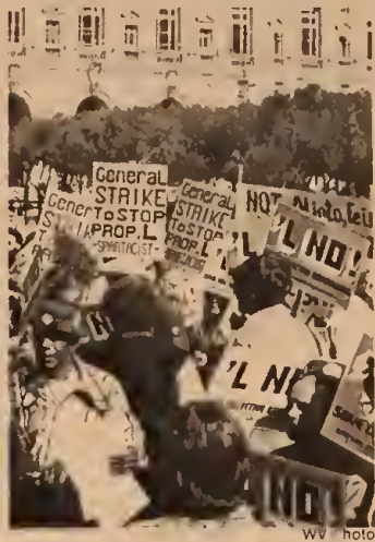
1974 demonstration against anti-labor Proposition "L"

This massive array of union-busting propositions must be sharply defeated! Class-struggle union militants must show the way by providing a program to mobilize the Bay Area labor movement to smash the S.F. city rulers' continuing