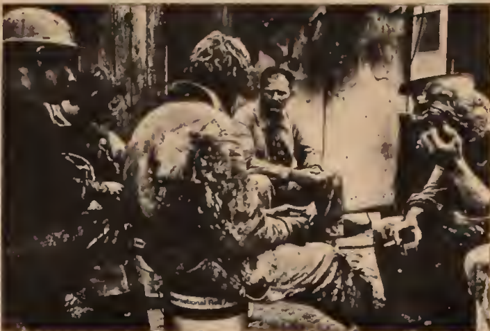
Shipyard workers in Sweden face layoffs and wage reductions due to increased international competition among shipbuilders.

With the Maoists increasingly isolated on the left and the "official" Com-