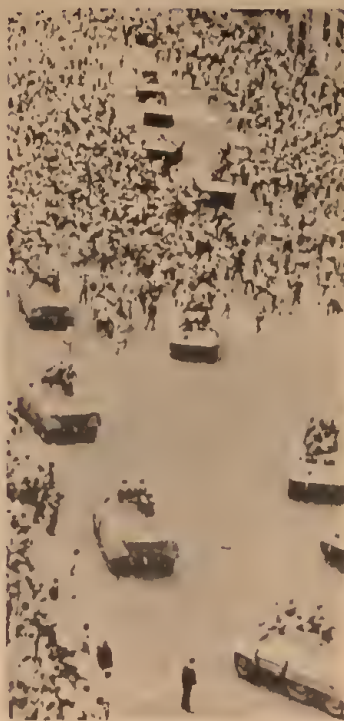
Tanks suppressing student demonstrators in 1968 anti-government protests in Mexico City.

In order to out what it called the "Marxist professors"—the pro-SWP leaders of the LS—the PST-backed group founded the Militant Tendency (TM), captured a majority of the Liga, elected a new central committee and pushed through new organizational rules. Under these bizarre regulations,