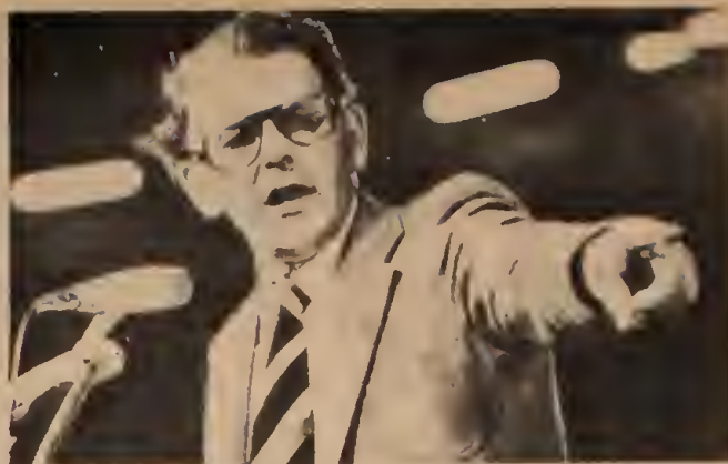
Thorbjörn Fälldin, newly elected Center Party prime minister

Although the big corporations have prospered under the long Social Democratic rule, growing sections of the bourgeoisie have been considering alternatives to continuing SAP domination of Swedish political life. One of the