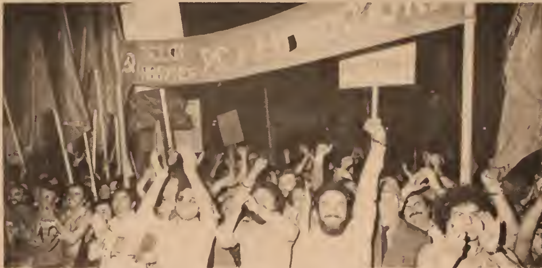
Factory workers cheer Berlinguer at PCI rally in Verona before June elections. No cheers for Berlinguer today.

In spite of decades of class collaboration, the PCI has retained the loyalty of the mass of the Italian working class. But the PCI's support for the austerity plan ("stagnata") and its suspension of parliamentary opposition to the DC have triggered a revolt in that section of the PCI bureaucracy which is directly