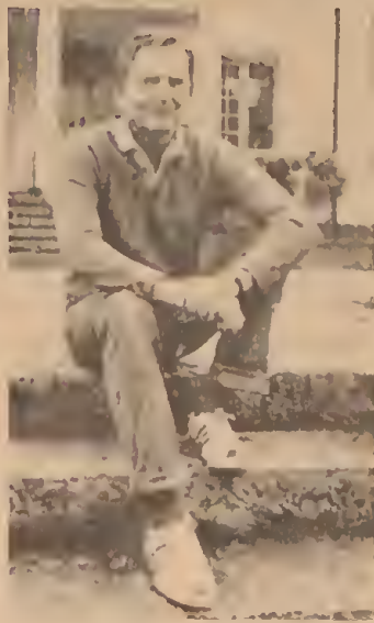
Olof Palme, ousted Social Democratic prime minister