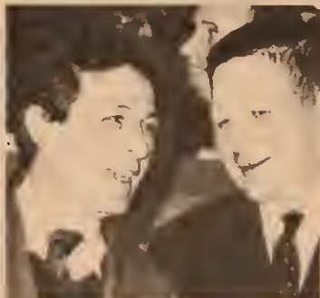
Berlinguer and Giorgio Amendola

local union bureaucrats quickly switched gears, calling a four-hour general strike—the traditional manner of defusing class struggle—in Torino for October 13.