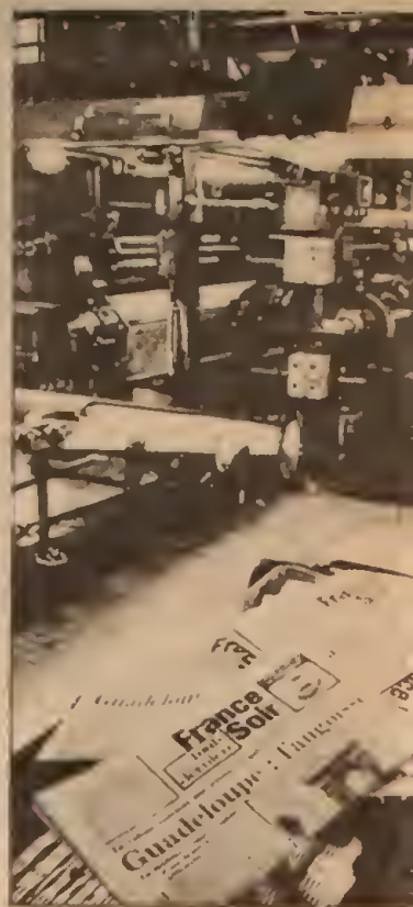
Pressroom at France-Soir

The propaganda of the journalists has been filled with references to this period. "We who fought for the liberation of France...now fight to remain free journalists." Implicit in much of this propaganda is the desire to find an owner with views more akin to the