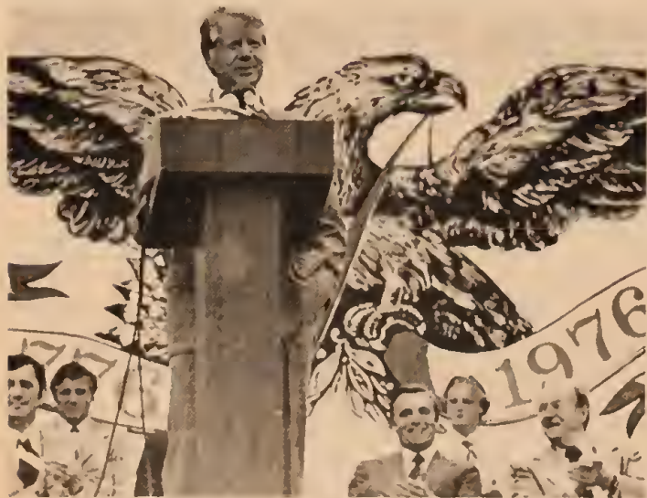
Jimmy Carter speaking at campaign rally in Minnesota.

The Spartacist League of Australia and New Zealand has demanded that the SPA publicly retract its irresponsible charges or stand exposed for its complicity in the defamation campaign of the reactionary Argentine and Chilean juntas. Like the Stalinist body upon which they grow, these vile and baseless slanders are the syphilis of the workers movement. ■