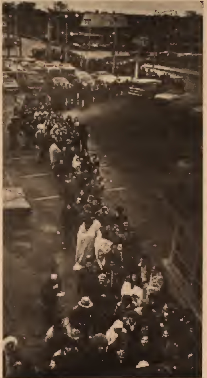
Job seekers line up at Pontiac, Michigan plant.

Today almost every statistic released indicates the beginning of a new