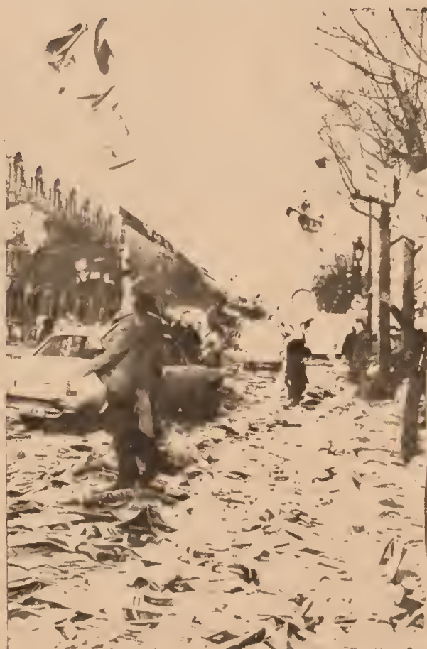
Protesting workers "distribute" scab edition of Parisien Libéré at beginning of strike last year.

In accordance with the militancy of continued on page 10