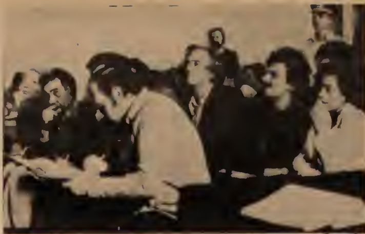
Athens courtroom during recent trial of leftist militants.