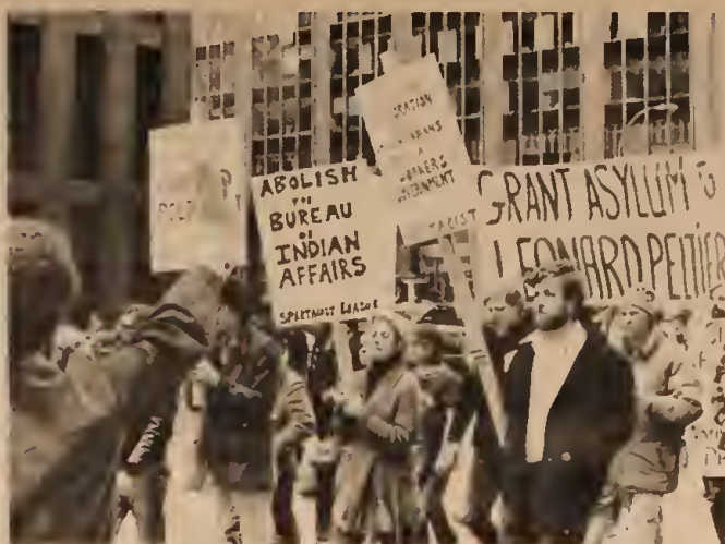
New York demonstration Saturday in defense of jailed AIM militant Leonard Peltier.

Thurs. 7:30 p.m. The Haymarket 715 So. Park View, Room 7 For information call: 663-9674 LOS ANGELES