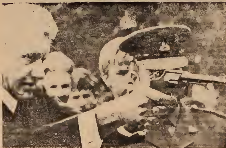
Prime Minister Ian Smith