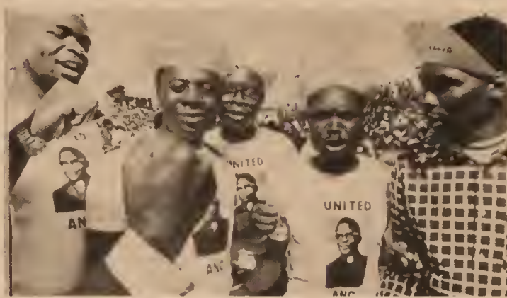
ANC supporters wearing T-shirts with picture of ANC leader Muzorewa. S.S.

While standing on the side of the various black nationalist guerrilla groups in any military conflict with the white-supremacist Rhodesian regime, Marxists underline the absolute necessity of a revolutionary Leninist vanguard party of the working class to liberate the impoverished masses of southern Africa. Rooted in the powerful black proletariat of South Africa, such a Trotskyist party will lead the struggle for national emancipation that the Nkomos, Sitholes and Mugabes can only betray in order to impose their own class domination. ■