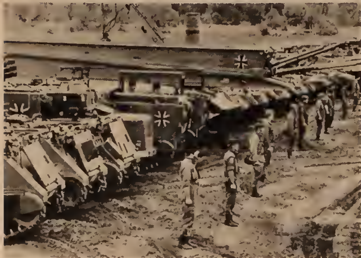
"Democratic" West German army yearns for glory of Third Reich.