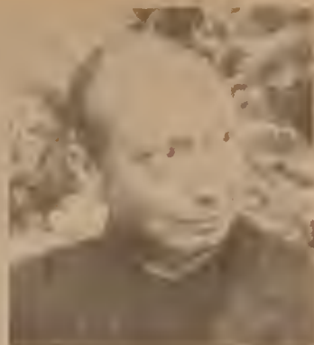
Pierre Béranger/Monthly Review Press