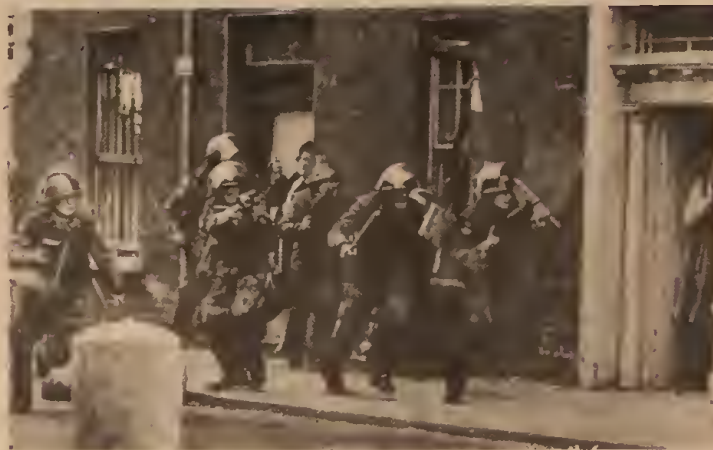
British troops in Belfast (above) claimed to be neutral yet repeatedly attacked oppressed Catholic masses. Boston police (below) likewise enforce racist status quo. In both Belfast and Boston, reformists called for imperialist armed forces to "protect" the oppressed.

Two days later, the New York Times reports her as "asserting that the civil rights movement wanted direct rule by