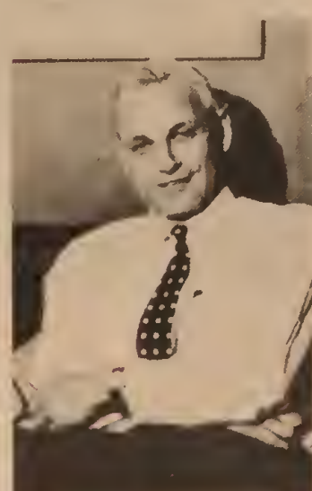
Ida Berman/Monthly Review Press