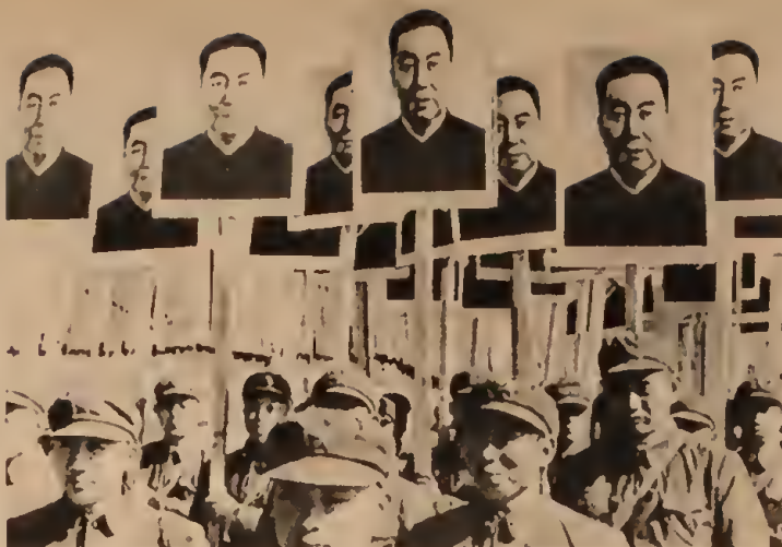
People's Liberation Army support for the new chairman, Hua.