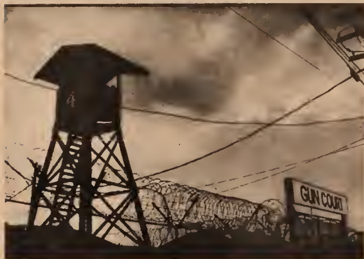
The state imposes life sentences in Gun Court prison for possession of guns.

Along with the British International Socialists, the RSL has eagerly extolled the virtues of the Revolutionary Marxist League (RML) of Jamaica, which took the same position on the political violence. Unfortunately for the RSL's transparently opportunist con game, the RML drew the obvious conclusion from choosing the PNP over the JLP in the squalid organizational rumbles that have convulsed the Kingston slums. In the general elections, the RML called for a vote to the PNP, an embarrassing confirmation of the real political logic behind the RSL's position. While lecturing its Jamaican friends against crossing the class line to vote PNP, the RSL's Torch (15 December) reiterates the same opportunist position at the root of the RML's betrayal: "In taking joint action with revolutionaries to suppress the JLP gangs, the pro-PNP workers can learn