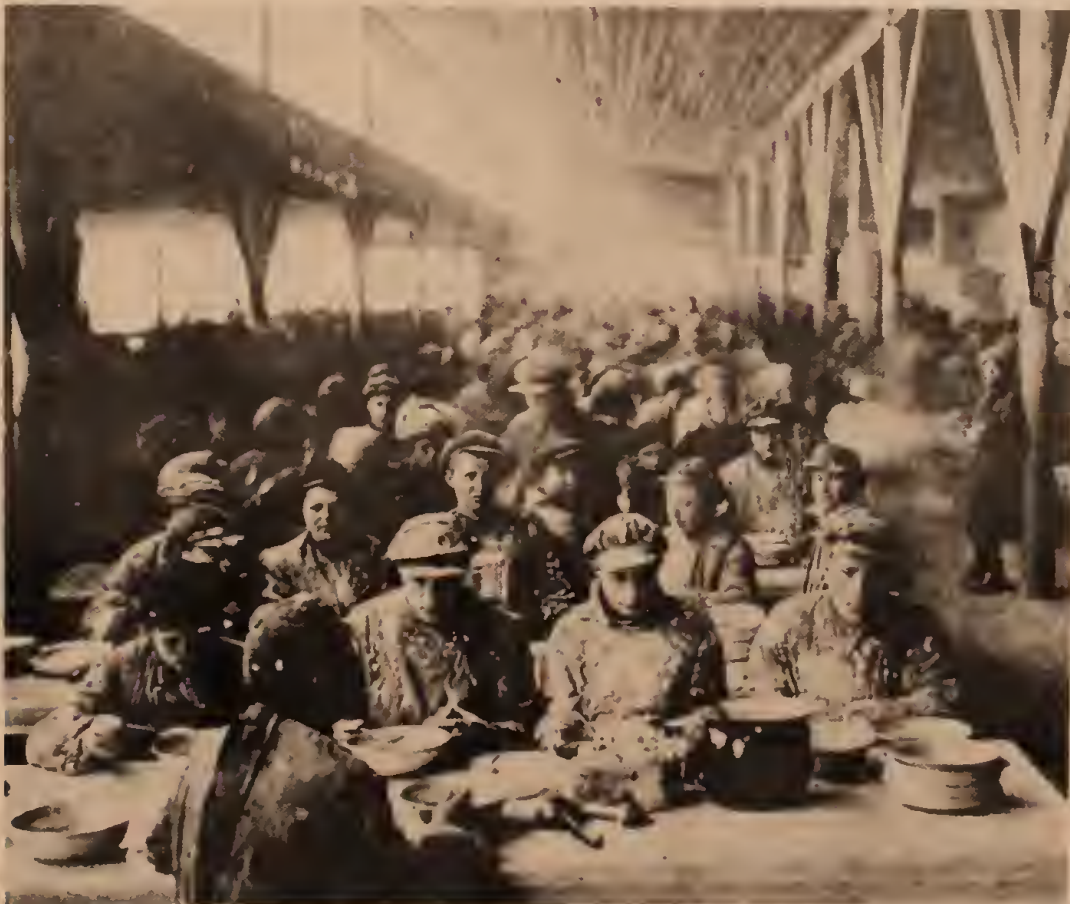
Auto workers in factory mess hall, 1931.

One of the most obvious difficulties for any ostensible Marxist who claims that capitalism was restored in the Soviet Union is to explain how a new bourgeois class was generated under Stalin's regime, how it organized itself and captured state power. The overthrow of the feudal order by the European bourgeoisie involved centuries of civil wars, revolutions and counterrevolutions; likewise, the struggle of the proletariat against the capitalist class has wracked bourgeois society for over a century. Yet the Maoists would have us believe that a