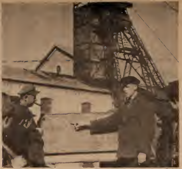
Alexei Stakhanov (right). Under Stalin, "Stakhanovites" were privileged workers who tostered speed-up by breaking piece-work norms.

development of world-historic significance—the restoration of capitalism in the USSR—took place through a bloodless palace coup, and was not even noticed as such by anyone , not even Mao himself, until several years later!