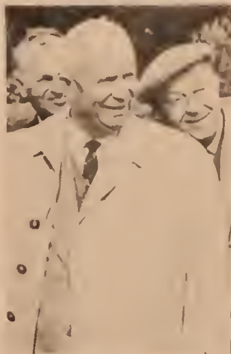
Khrushchev visiting collective farm, 1963.

Soviet enterprise managers are not a distinct, organic social group with a basis for unity against the higher administrative strata. Enterprise management is simply a division of labor within the administrative bureaucracy. Real success for an enterprise manager is not the expansion of "his" factory,