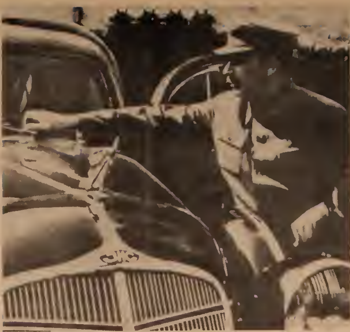
Stalin inspecting new limousine outside Stalin Auto Works near Moscow.