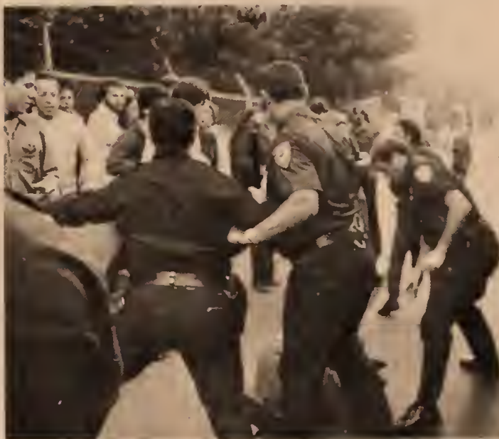
Boston cops attacked UE pickets at Cambion plant September 24.

police scab-herders rented to Cambion on a round-the-clock basis. In contrast to the harsh sentences meted out to Polaski and Brier, not a single cop was prosecuted for harassing and beating picketers (attacks which resulted in some 20 injuries including one woman striker permanently disabled by a back