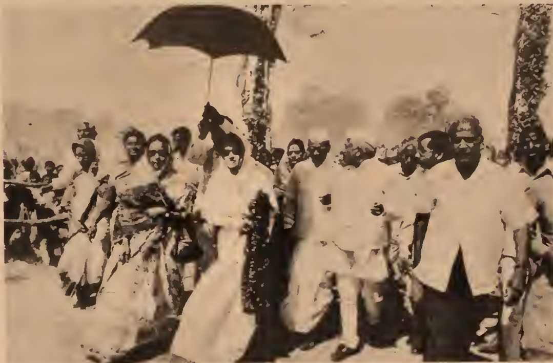
Prime minister Indira Gandhi campaigning early in the election.