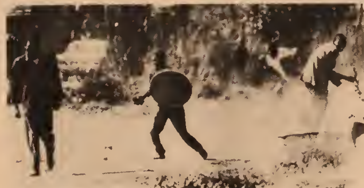
Students in the streets of Soweto last summer.

was built as a vehicle for the SWP to cozy up to pro-busing liberals at the height of the struggle over school integration in Boston; but as the black "establishment" began to take a dive on busing, NSCAR found its "mass movement" dwindling. Now it hopes to stave off organizational disintegration by tapping mass sentiment against white-supremacist rule in southern Africa. By shelving almost all activities in favor of busing and orienting to an apparently "safe" issue far from home, SWP/NSCAR hopes to win back the support of fickle liberals who want to duck the crucial fight for school integration.