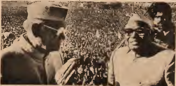
Jaya Prakash Narayan, left, with Jagjivan Ram.

non-alignment" means a shift away from alliance with the Soviet Union. Typically, it draped great power diplomatic considerations in the language of liberal moralism. Thus the New York Times (22 March) crowed: "An impoverished people rejected the siren song of authoritarians everywhere that bread must be bought at the price of freedom." But the real point is that Gandhi never delivered on her promise of "bread," by which her suppression of bourgeois-democratic rights had been justified to the masses. The transfer of governmental power represents a rever-