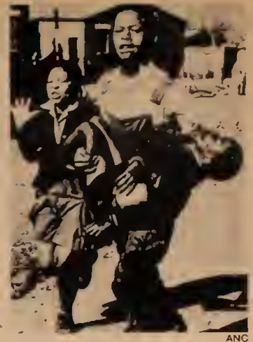
One victim of Vorster regime.

Even supposing for a moment that the impotent consumer boycott tactic were to work, it would not advance the struggle; it could in fact create enormous obstacles to the revolutionary struggles necessary to liberate the black masses. The central issue on South Africa is how the oppressed non-white working people can wrest power from the white ruling class. Certainly, it is not through the withdrawal of foreign corporations and a contraction of international trade. That would only spell increased unemployment of black and "coloured" workers and a weakening of their social power, which has been