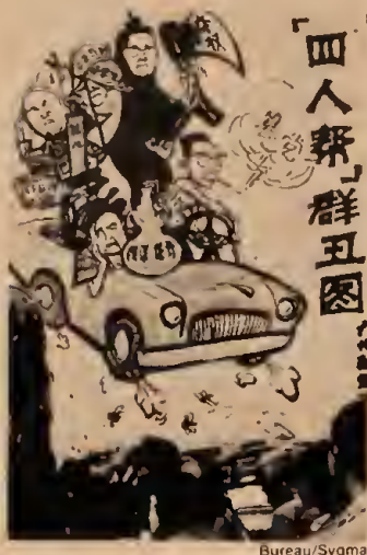
Wall poster denouncing the "Gang of Four."