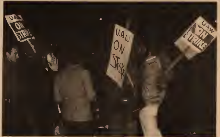
UAW picketers outside Fremont GMAD plant March 28.

The company, for its part, is clearly taking a tough stand. Mounds of grievances over speed-up, harassment, medical and health and safety issues have piled up. Discipline has been intense. A short while back another committeeman was fired when he tried to defend himself against an assault by a foreman. More recently, 11 workers from the truck line received disciplines. The company alleges that a leaflet issued by supporters of the October League's Call proved that the 11 disciplined