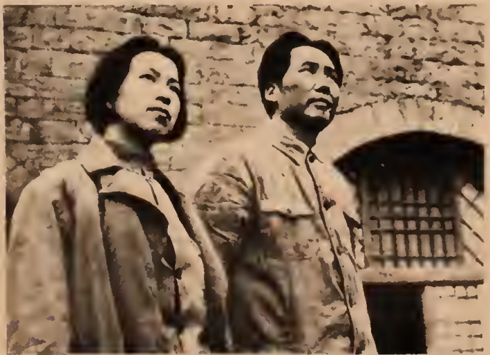
Mao and Chiang Ching in Yenan Province in 1947.

"Will it be an indication that Teng's deviationist line has become predominant in the central committee if he is