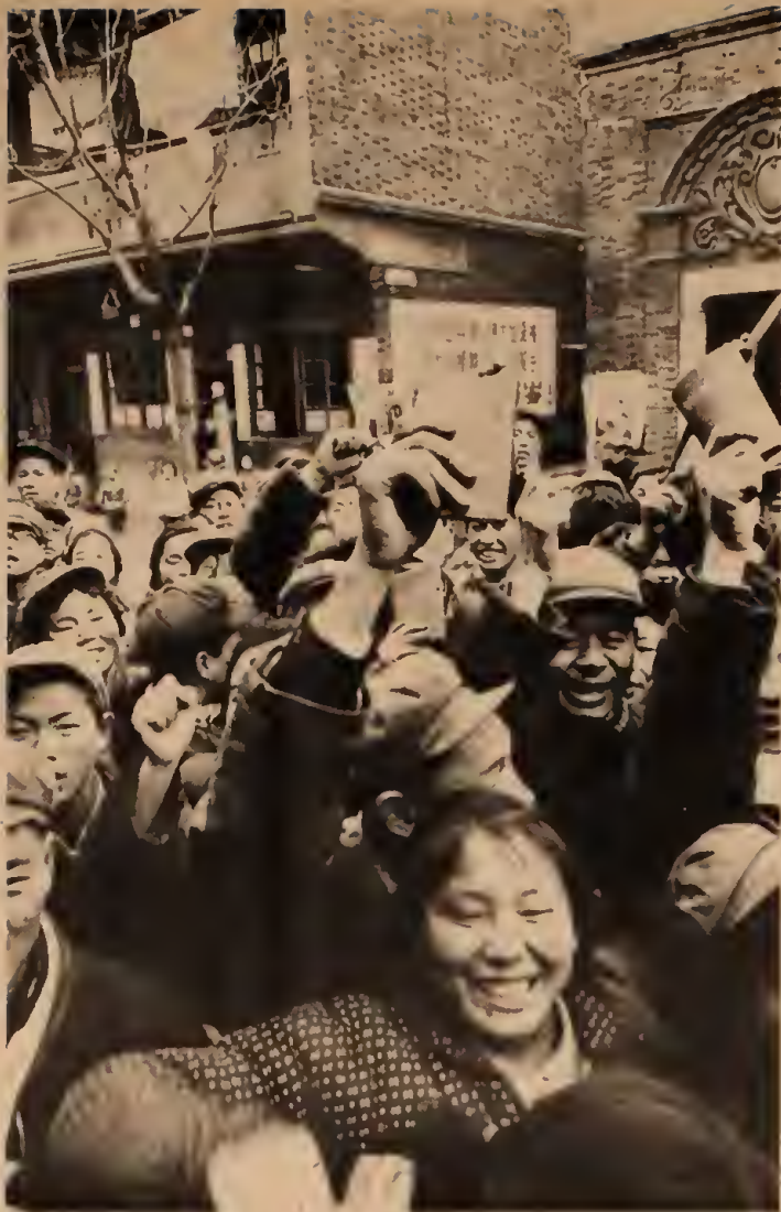
Red Guard demonstration in 1967 during Cultural Revolution.

comprehend the difference between bureaucratic criminals in a deformed workers state and bourgeois counter-revolutionaries.