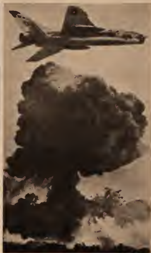
U.S. imperialist bomber over Vietnam.