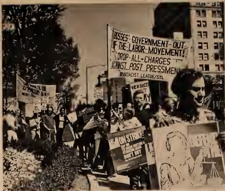
Washington demonstration last Saturday called for dropping indictments against Local 6 pressmen.