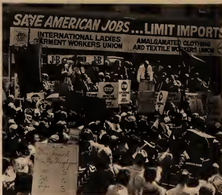
Garment workers demonstrating in New York last week.