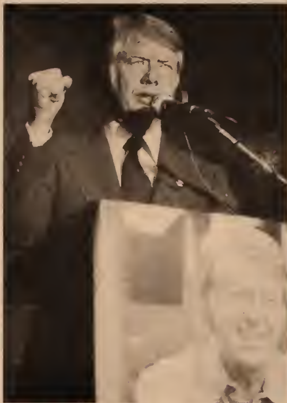
Imperialist chief Carter

But Carter's "human rights" campaign is more than just hypocrisy. It is two-faced moralism in the service of militarism. At the time of the Angolan war last year Ford was unable to whip up public support or even Congressional backing for large-scale aid to anti-Communist forces there, much less for direct U.S. intervention. This is what the Carter administration is out to change. Today the attempt to refurbish the moral authority of Yankee imperialism means a bigger war budget and "hanging tough" in arms control negotiations. Ultimately, however, as in the case of Woodrow Wilson and FDR, this