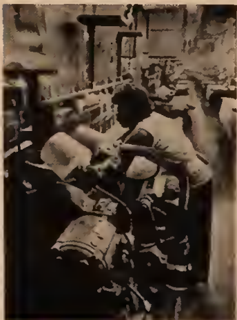
J.P. Stevens plant in Roanoke Rapids, North Carolina.

But aside from kicking in some funds to the boycott campaign, the AFL-CIO is doing little. Its real concern is a massive lobbying effort to do some