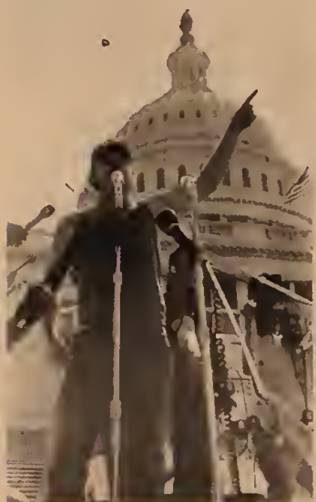
Miner addressing rally on steps of the Capitol.

The illusion that the miners can rely on the capitalist state and its politicians is fatal. The history of the strikebreaking Arnold Miller leadership is precisely the history of government intervention in the union, ostensibly to clean up