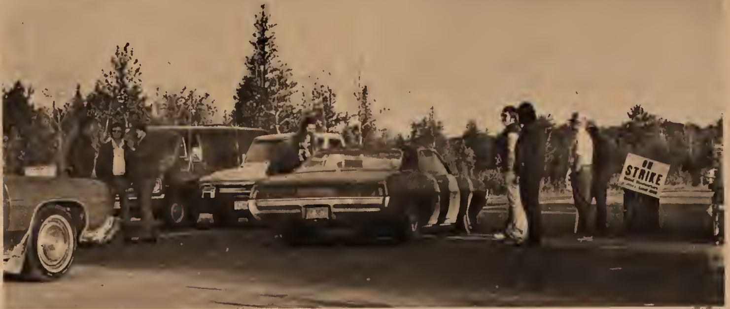
USWA Local 1938 pickets check cars entering U.S. Steel's Minntac taconite production complex at Mountain Iron, Minnesota.