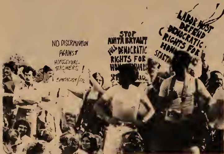
Opposing Carter's "human rights" campaign.