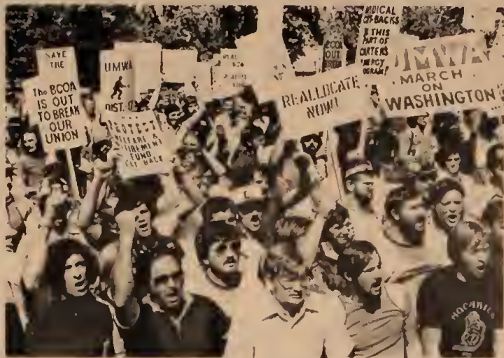
Mine workers' August 6 demonstration in Washington, D.C.

Yet, there are still thousands of miners who resist returning to work without having gained a thing. One miner told Workers Vanguard he wanted to organize roving pickets to spread the strike: "We can't win by ourselves. [We]...have to have support