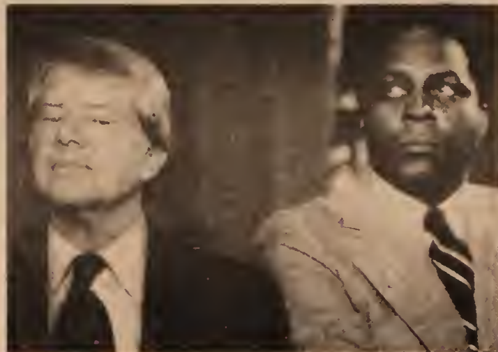
Carter with Vernon Jordan at the Urban League convention.

Democratic Party hacks that "benign neglect" of the black population is bipartisan policy, a show of bravado, hot air and empty threats was necessary. But Jordan et al. were careful to cover their bets. "Mr. Carter, after all, is only the chief executive," Jordan explained, as administration officials hastened to point out that Congress was the real culprit.