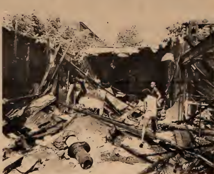
For Carter no apologies are necessary—blacks of Bedford-Stuyvesant will get more of the same.

The NAACP and Urban League "attack" on Carter is merely whining liberalism—the attempt of black politicians to maintain a shred of credibility in the eyes of their constituency, whom Carter never had any intention of assisting. Since it has now become obvious even to the most loyal black