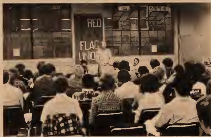
Red Flag Union Stonewall '77 Conference In Los Angeles.