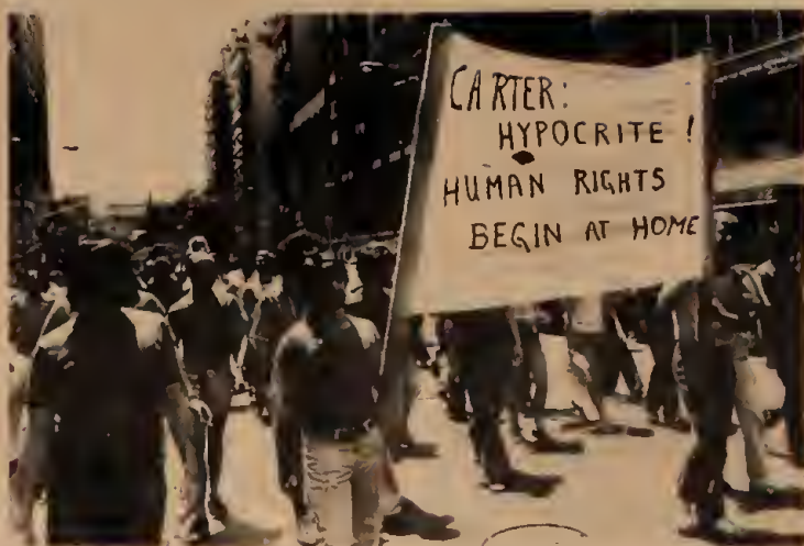
Tailing Carter's "human rights" campaign.