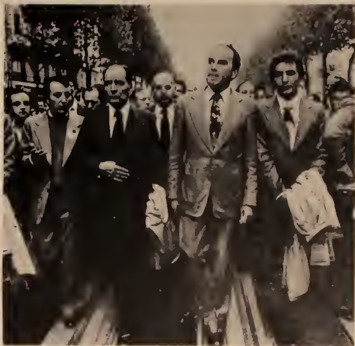
Union of the Left leaders Marchais, center, and Mitterrand, center left, lead march in Paris last year.