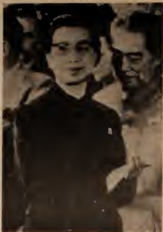
Chiang Ching with Chou.

the no-win policy of public silence on the question of the present Chinese regime.