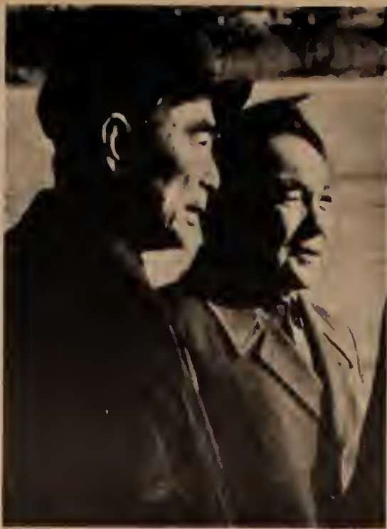
Chou En-lai with Teng Hsiao-ping.

Worst of all it would have brought the RCP up against the spectre of Trotskyism, for Stalinism without a country is unstable in the extreme, as Progressive Labor found out. Warding off that spectre, Progressive Labor embarked on the path of political slow death. The collapse of PL's impressionistic centrism and its reformist spiral into oblivion is the unacknowledged deterrent for leftist impulses in the RCP. But the PL horrible example is probably superfluous for Avakian, whose own New Left parochialism would itself be sufficient to preclude any attempt at global Stalinist revisionism in the style of the old Progressive Labor. So he opts for