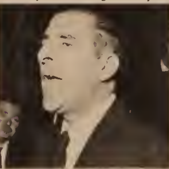
Former president Eduardo Frei

When the El Teniente workers struck during the UP regime (April-May 1973) in defense of their sliding scale of wages (cost-of-living escalator), the Trotskyists of the international Spartacist tendency were among the very few