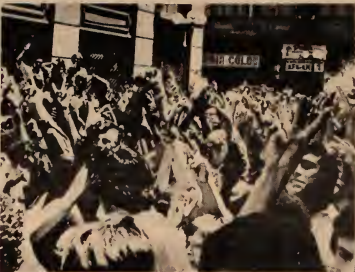
Leftists demonstrate in Chile capital January 3 for first time since 1973 coup.