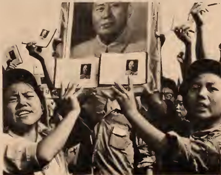
Red Guards display Mao’s “Little Red Book” at Peking demonstration during the Cultural Revolution.

resistance to the “radical” Maoist Red Guards, particularly among the working class (e.g., the Shanghai general strike in January 1967), Mao had to call in the People’s Liberation Army (PLA) in early 1967 to “support the revolutionary rebels.” The conservative PLA officer corps, of the same flesh as the civilian party and government bureaucracy, naturally neutralized rather than supported these “rebels.” Frustrated by the nature of the PLA’s intervention, some Red Guard groups came out for extending the Cultural Revolution into the army, mobilizing the soldiers against the officers.