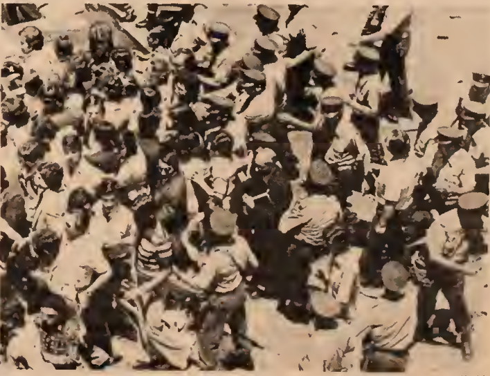
Christian Democratic youth clash with police in Santiago while leafletting for "no" vote in plebiscite.

There is no doubt that the plebiscite was unilaterally called by Pinochet and represents his last card in this game to strengthen his position and overcome his current crisis. The "consultation" is nothing but a monstrous fraud and the Chilean working class and other exploited sectors can only repudiate this masquerade, whose result, of course, was known beforehand. Where possible, revolutionaries would seek to express this repudiation in boycotting the phony plebiscite. But the government an-