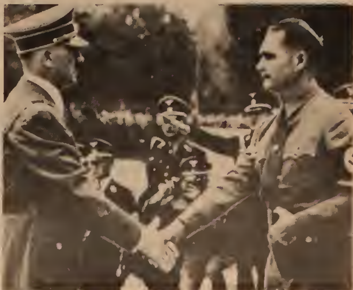
Rudolf Hess with Hitler.

The English and American bourgeoisies are particularly fond of Hess because of his spectacular 1941 flight to Scotland to singlehandedly make peace with Britain. In Winston Churchill's words: "Whatever may be the moral guilt of a German who stood near to Hitler, Hess had, in my view, atoned for this by his completely devoted and fanatic deed of lunatic benevolence."