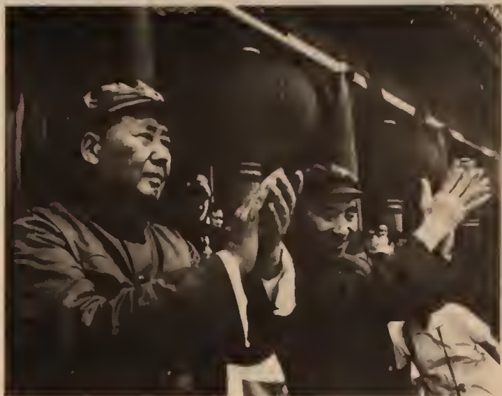
Mao and Lin Biao applaud Red Guard parade in 1966.

Following the youth name-change confrontation, the Central Committee and other leading members were called to Chicago in mid-December for a meeting, ostensibly to set guidelines for opening a discussion within the RCP on