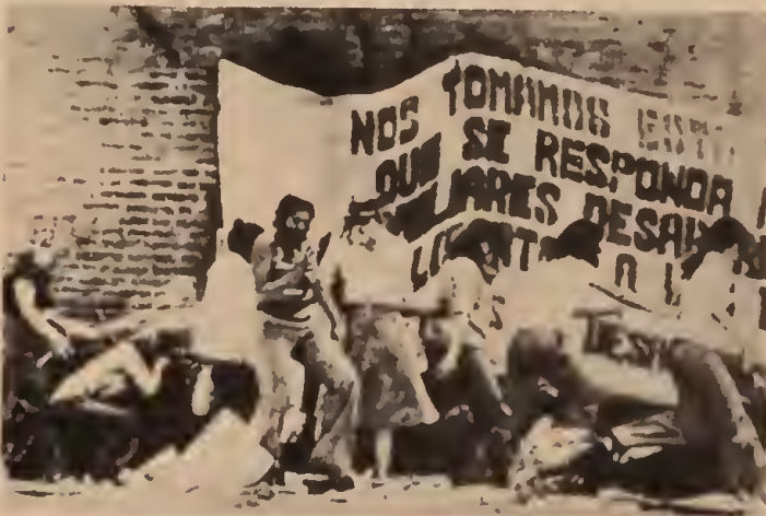
Women demonstrating against Somoza regime in front of UN building in Managua.

National Guard in 1934. The Front caught international headlines in December 1974 when the guerrillas kidnapped a group of 13 prominent politicians and businessmen. To free the hostages Somoza released 14 members of the FSLN then in jail, allowed them to fly to Cuba and paid $1 million in ransom.