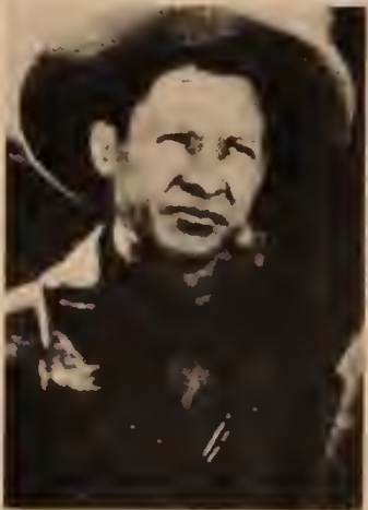
Augusto César Sandino

Somoza's sons carried on the tradition. When large amounts of