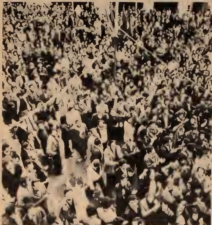
Striking workers massed in the streets of Tunis January 26.