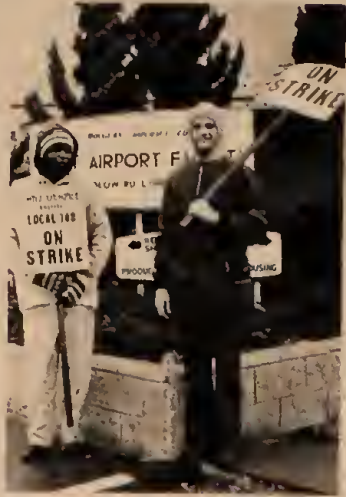
UAW pickets outside Long Beach Douglas Aircraft plant.

Instead of a joint industry-wide strike, where the power of the two unions could be combined, the UAW and IAM bureaucrats have chosen the self-defeating "one-at-a-time" strategy, while scabbing on each other's strikes. The isolation of each of the aerospace strikes has already spelled disaster, for the unions, but still the myopic misleaders refuse to learn the most elementary lessons of labor solidarity.