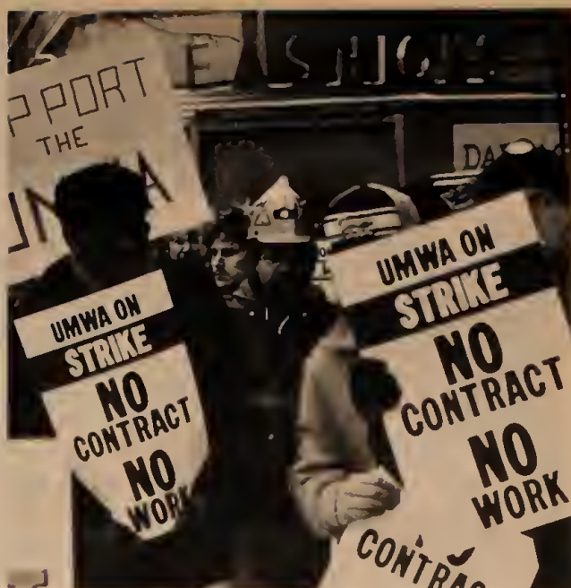
Striking miners demonstrating in Pittsburgh February 6.