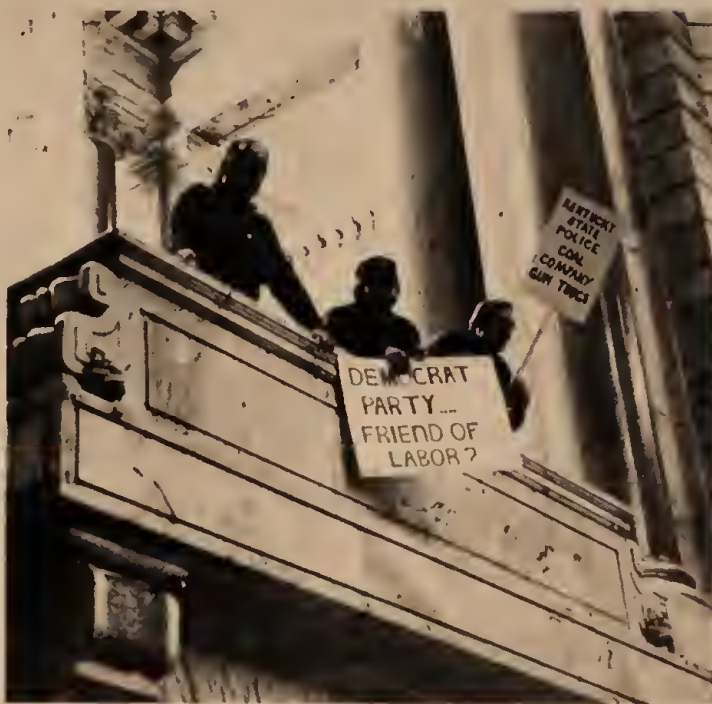
Miners at Kentucky state capitol protesting cop harassment of pickets.