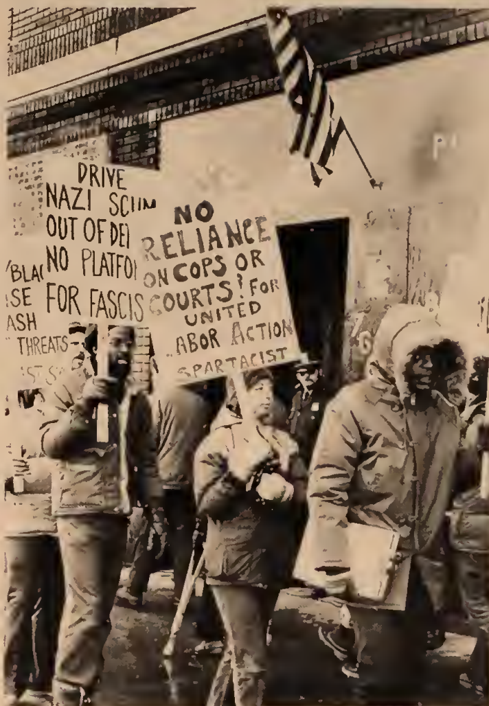
Demonstration outside Nazi "bookstore" in January.

"This February 6 meeting against the Nazis sends us a mandate to the coming steering committee the duty to organize and lead massive public opposition to the Nazis... that special effort be made to get the thousands of members of organized labor to play a leading role."