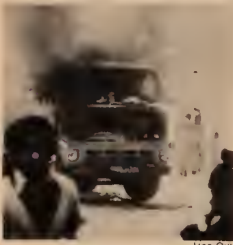
Truck burning on Tunis street.

to U.S. imperialism and to Israel than from the realities of Tunisian politics. Membership in the PSD, the sole political party, is a legal prerequisite for being a delegate to the National Assembly. Bourguiba, the self-proclaimed "Supreme Combatant" who is fond of the saying "L'état, c'est moi," has shown no compunction about murdering his rivals. Salah Ben Youssef, an exiled leader of the Neo-Destours (predecessor of the PSD) was assassinated in Switzerland in 1961. In 1974 a scandalized Swiss government launched an inquiry into the activities of several of Bourguiba's henchmen, one of them implicated in the Ben Youssef case, who were on the trail of Ahmed Ben Salah, another exile living in Switzerland.