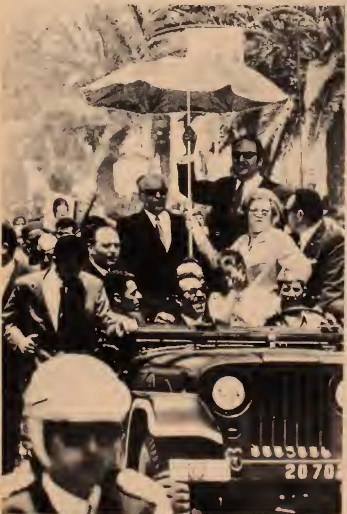
President Habib Bourguiba (center, dark glasses) riding in Tunis parade.