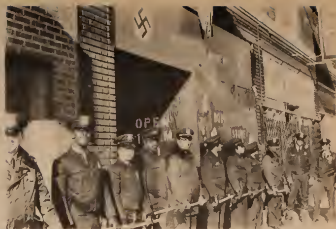
Detroit cops guarding Nazi office last Saturday.

Meanwhile the Communist Party and the CLP continue to push for a ban of the fascists by Coleman Young. Even