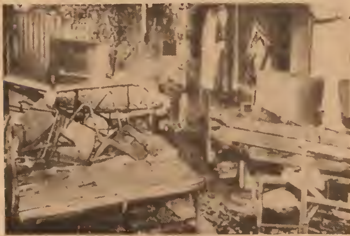
Cleveland Women's Clinic after attack.

Although the "pro-life" movement has downplayed its affiliation with the Catholic Church in the attempt to broaden its base among fundamentalist right-wingers—many of whom are anti-Catholic—the Church remains its principal financial and moral backer. As early as 1972 the National Catholic Conference of Catholic Bishops set up the Bishops Committee for Pro-Life Activities. This committee has used its considerable resources to disseminate a steady stream of propaganda among priests, Catholic schools and organizations and women in general. In 1974 the Bishops Conference also set up a separate political action group, the National Committee for a Human Life Amendment, which works closely with