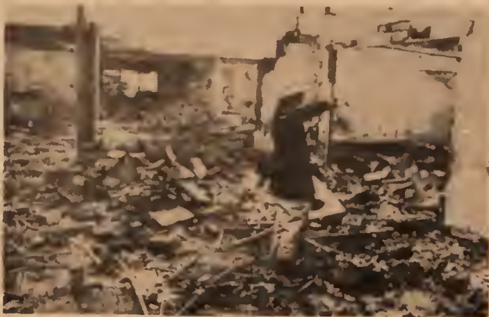
Remains of Belfast restaurant after bombing in February.

however misguided or counterproductive, directed against the British imperialist state (the army, Royal Ulster Constabulary [RUC], etc.) and its representatives, it is the duty of Leninists to defend the Provos against the reactionary repression. But the fact is that this explosion was simply criminal sectarian slaughter which follows logically from the Provos' petty-bourgeois Catholic Irish nationalism. Such utterly indefensible acts must be sharply condemned by all communists. The fact that a nine-minute warning was allegedly given to the local police in no way lessens this criticism: indiscriminate terror has led in the past and will lead in the future only to the pointless deaths of yet more innocent people.