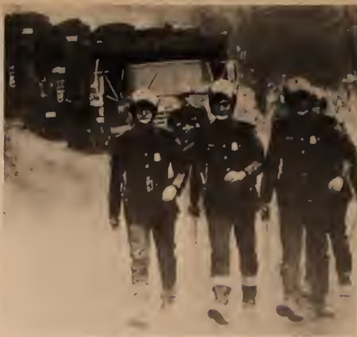
State cops at Norton, Va. escort truckloads of scab coal past picketers.