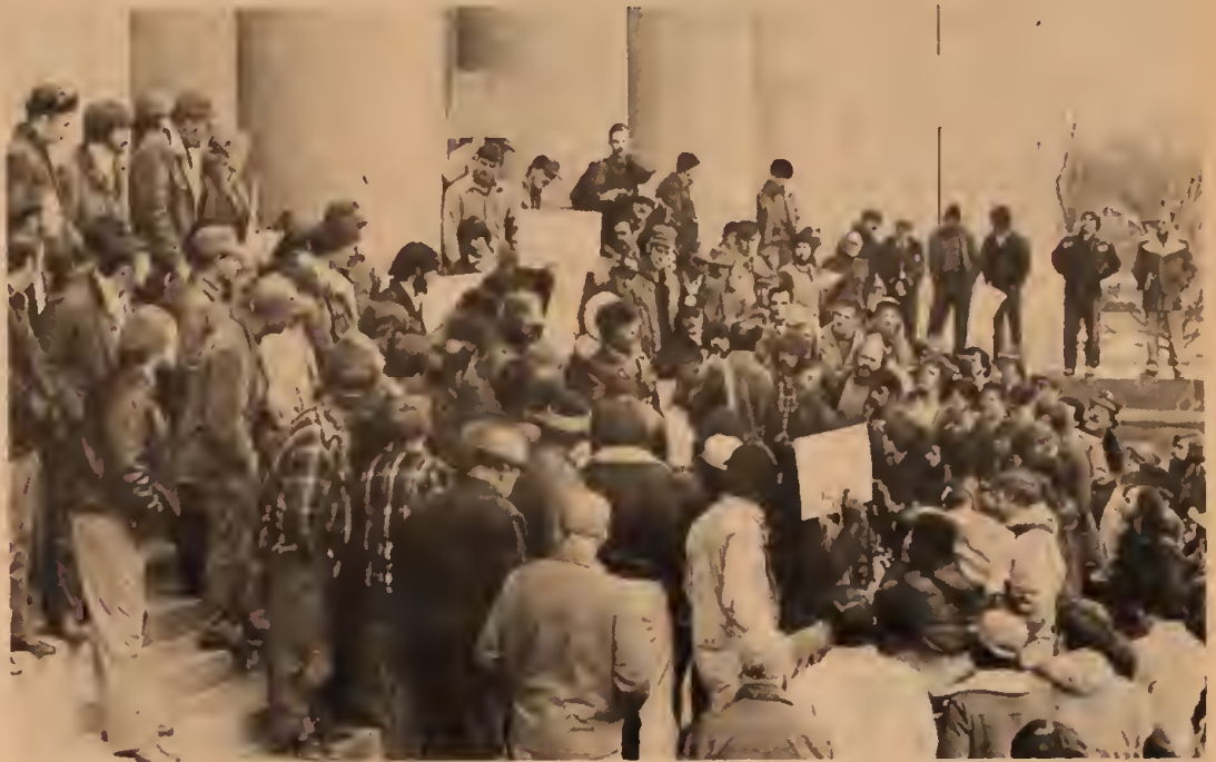
Miners in Charleston, West Virginia March 7 denounce Miller/Carter sellout.