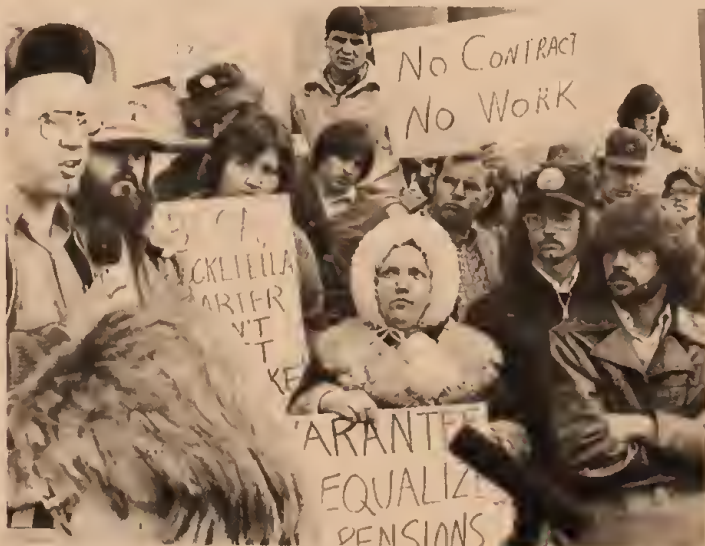
Demonstrators from Logan County at West Virginia state house protesting Taft-Hartley injunction, March 7.

• Send mass delegations to unions of Teamsters, auto, steel, rail and maritime workers, demanding coordinated soli-