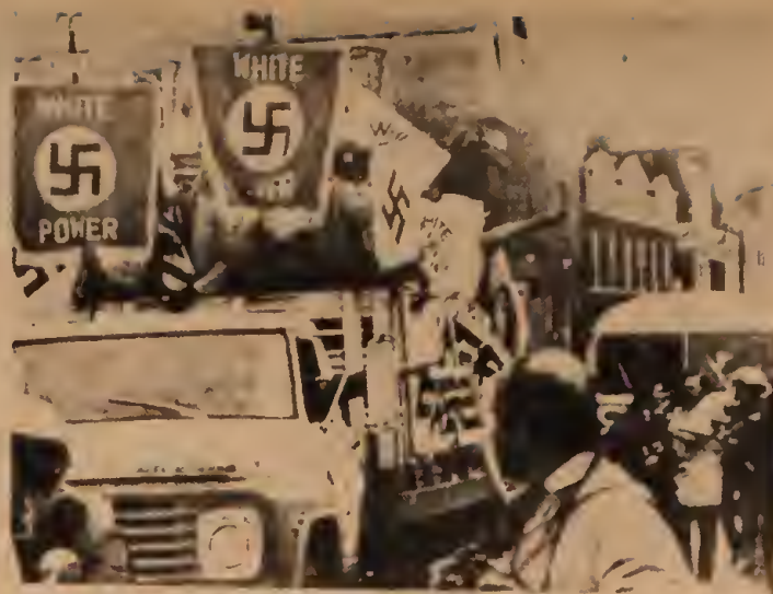
Nazis on the run in St. Louis

Burn Sellout No. 3! For two-bits an hour and $25 a month they want to force you into a disguised no-strike contract which abolishes the UMW health card. After 100 days of a bitter strike, with hundreds of miners arrested, scores injured and some killed, in the face of cops, National Guard and now Taft-Hartley, the UMW ranks have successfully resisted the coal operators' attack and backstabbing by their own leaders. Don't give in now! Vote it down! ■