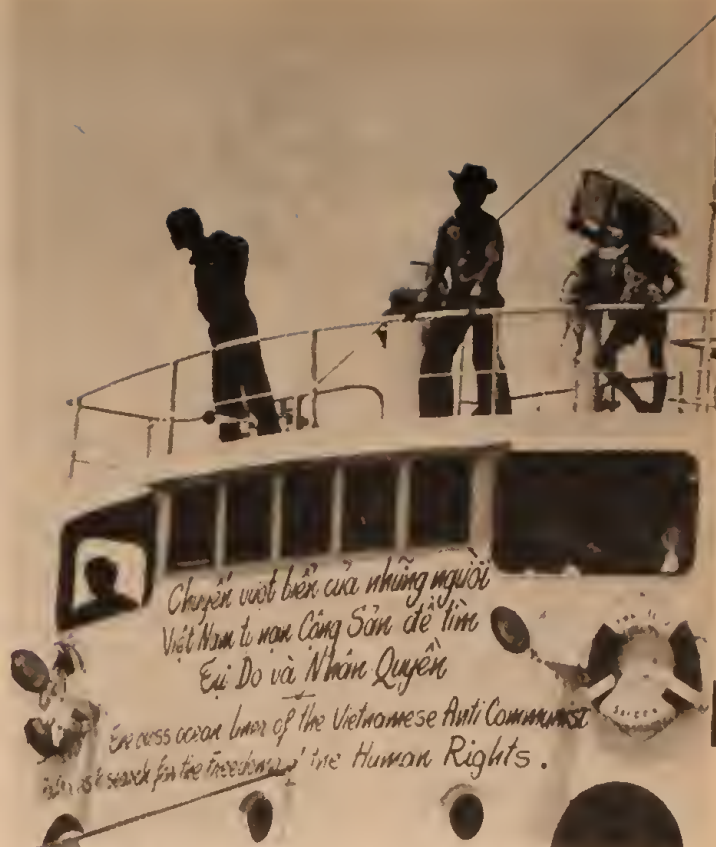
Arrival of "boat people" on Song Be sparked protest strike by Darwin longshoremen.

Because of this context of traditional anti-Asian chauvinism within the labour movement, any blanket opposition to the arrival of the Vietnamese must be viewed with suspicion. All the