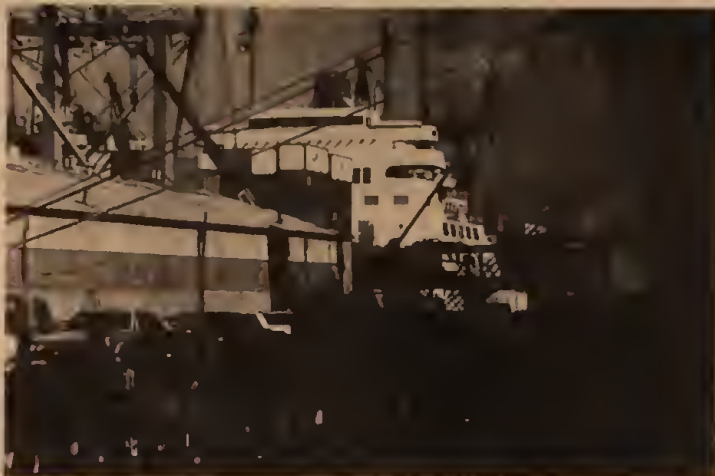
Ship docked in San Francisco.