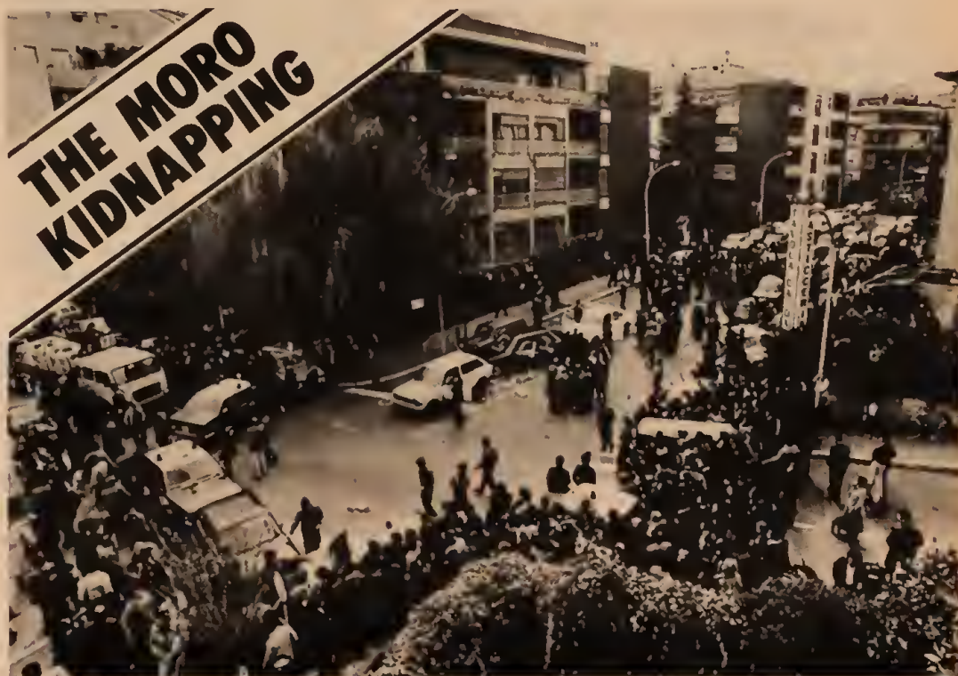
Rome cops mob scene of Moro kidnapping March 16.

In another slap in the face against the Italian state, Moro's letter suggested an intervention by the Vatican. A spokesman for the pope responded that this was possible. Meanwhile the Roman underworld has joined the manhunt in order to hurry up a return to normality; the uproar and police mobilization in the wake of the Moro kidnapping was "bad for business." And when the "anti-terrorist" laws were stiffened, this too was done all'italiana : a distinction will henceforth be made between common kidnappings for purposes of extortion and the more threatening political kidnappings. (Last year there were 78