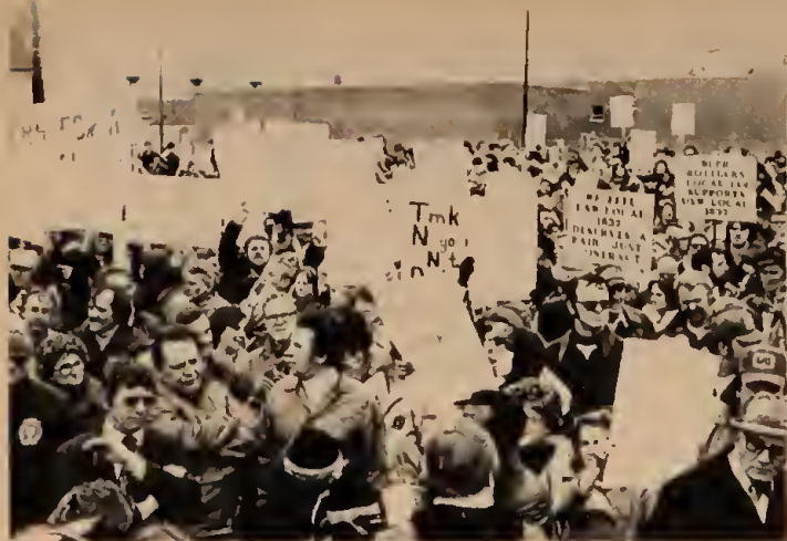
Local 1537 steelworkers rally outside Latrobe Steel Company plant.