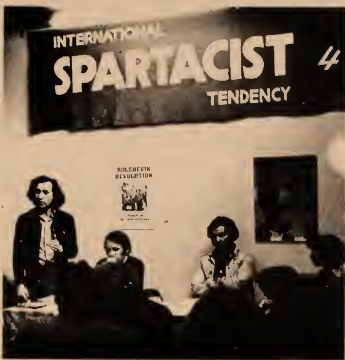
Founding Conference of the Spartacist League/Britain.