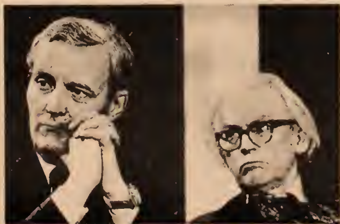
"Left" Labour members of parliament Tony Benn (left) and Michael Foot complained about coalition with Liberals, then backed Callaghan.