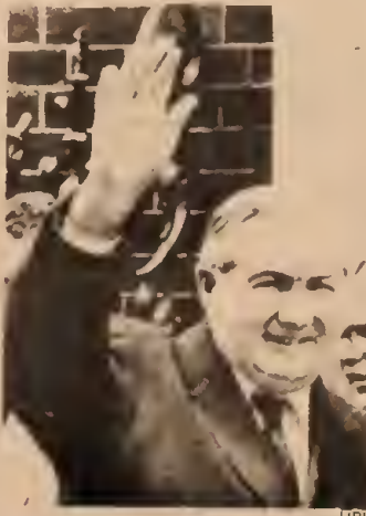
Labour prime minister Callaghan (left) and Liberal Party leader Steel. No votes for candidates of the Lib-Lab coalition!

"The WSL advances the slogan of 'a workers' government' as a pseudonym for the dictatorship of the proletariat. Its essential content a government that rules in the interests of the working class and hases itself, not on the bourgeois state, but on the independent organisations of the working class—remains, whether or not it is advocated as a propaganda or an agitational slogan."