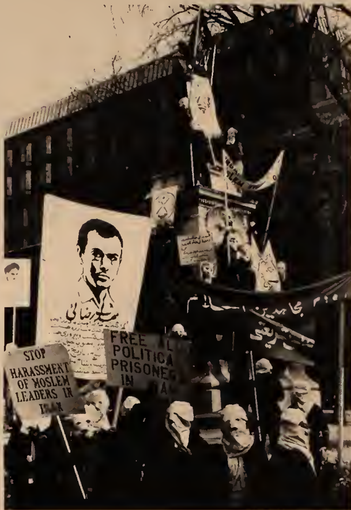
"Islamic Marxist" anti-Shah protesters in Washington, November 15.

During the second day of the protests the Shah mobilized armored cars and units of machine gun wielding soldiers to brutally restore "law and order." While official sources claim "only" nine killed, other reports of how over a hundred were gunned down and many