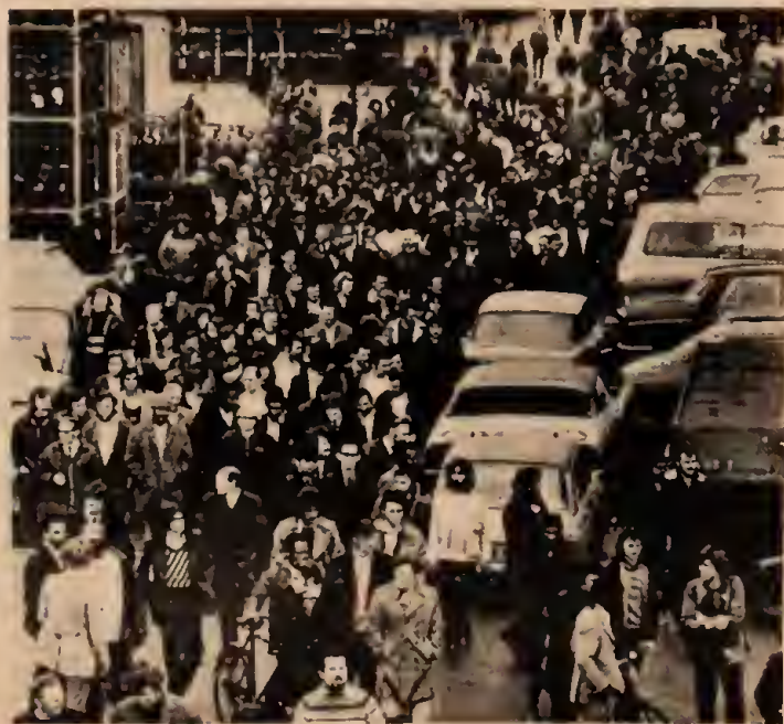
Workers leaving British Leyland's Cowley plant.