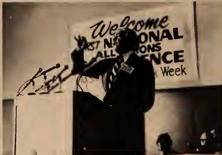
UAW president Fraser speaking at Detroit conference last week.

Even featured speaker Doug Fraser found it easy to pooh-poo the notion that the Congress will pass a 35-hour workweek. Citing Congress' hesitation over Humphrey-Hawkins and the mild Labor Reform Act, the UAW chief said it was unrealistic to think the Washington