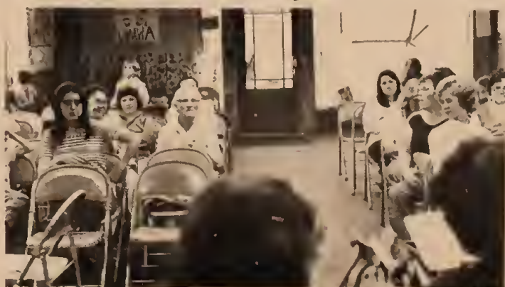
April 4 meeting of the Stearns Women's Club.

The 21-month-long Stearns strike must not be abandoned. Mass picketing and occupation of the mine by strikers is urgently needed to stop all production and transport the scab coal as well as all scabbing. The miners should elect a local strike committee to lead the fight and demand that the officials of District 19, a center of opposition to Miller throughout the contract strike, bring out union miners and supporters to the picket lines on a daily basis. By rejecting Miller's recipe for defeat and advancing instead a strategy based on militant union solidarity, the Stearns miners can bring Blue Diamond to terms. ■