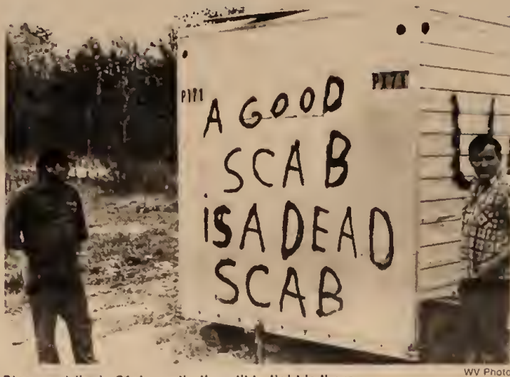
Stearns strike in 21st month: the will to fight is there.