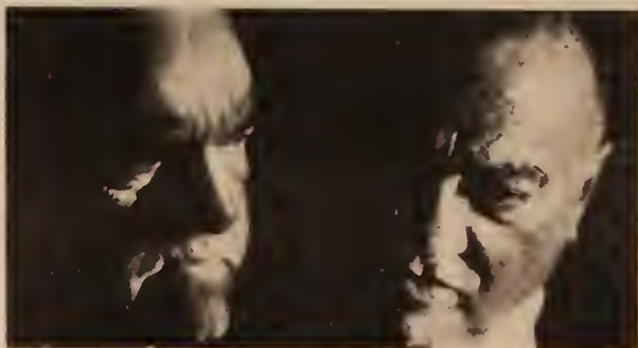
L. Patrick Gray (left) and J. Edgar Hoover.