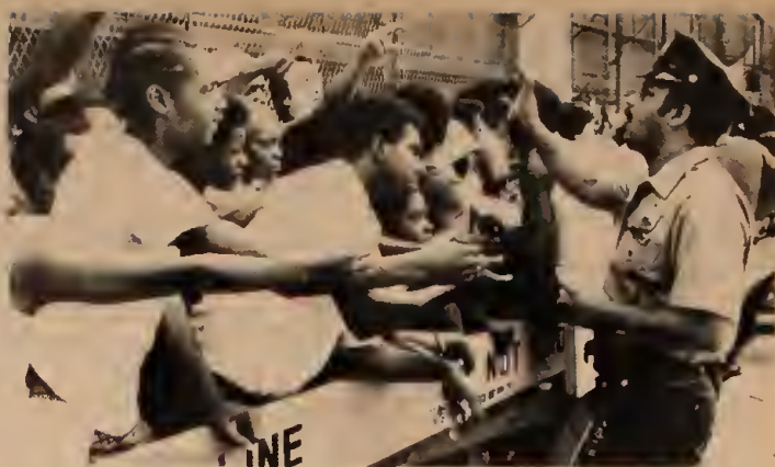
Unemployed youth clamor for jobs in NYC.

The competitive devaluation of the dollar to sustain the U.S. recovery has brought Carter into increasing conflict with the other major capitalist governments. In order to prevent the total collapse of the dollar—now under heavy attack by currency speculators—as the medium of world trade, West Germany and Japan have lent the U.S. billions, in effect subsidizing the American deficit and economic recovery. While Carter has preached to the German and Japanese governments that they stimulate their economies (as if they prefer stagnation) in order to import more, Helmut Schmidt is now demanding