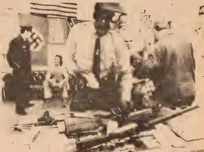
New York Times

While this time around a legal technicality could be used to effect the Nazis' eviction, the capitalist courts will not and cannot fight the fascist threat. In Illinois, for example, the courts have repeatedly upheld the fascists' attempts to stage provocations by parading their swastikas and dumping race-hating filth in the Jewish community of Skokie,