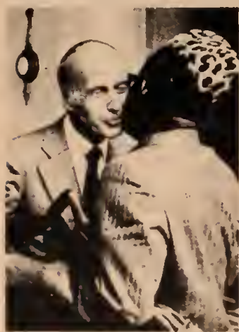
Mobutu embraces French president Giscard.

Shaba/Katanga witnessed a variation on this theme in 1960. Only in that case the secessionist movement, led by Moïse Tshombé, was backed by the white colons and Belgian imperialism. When the black rank and file of the army of the newly-independent Congo revolted against their Belgian officers, the former colonial power decided that even nominal independence of the Congo was too risky. White settlers and the Union Minière Mining Trust, hiding behind Tshombé, declared the independence of Katanga province. As atrocity stories about attacks on whites flew thick and fast, Tshombé appealed for the "sending of Belgian troops to protect human lives and goods." At the UN the Belgian