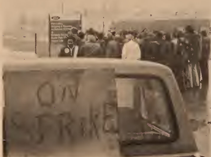
Strikers outside Ford's Romeo Tractor plant May 12.