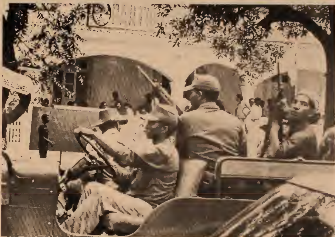
Government troops stationed outside Santo Domingo headquarters of the Partido Revolucionario Dominicano after election vote count was halted last week.

Whatever the internal maneuvering, it is clear that international pressure was