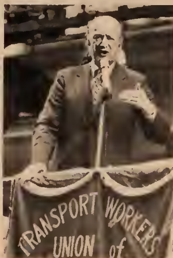
Ed Koch, posing as friend of labor, speaks at demonstration against transit fare hikes in 1975.

Coming into last week's talks, Koch had proposed a token increase in the wage package—a 4 percent increase in October 1978 and a final sum 18 months later—which does not even begin to compensate for the ravages of the past three years of wage freezes and layoffs. In fact, the current annual inflation rate is more than double the proposed raise. Moreover, this "sweetener" was offered only in exchange for $80 million in "givebacks" demanded by the city. The administration at various times has mentioned such possible takeaways as premium pay on weekends and holidays; uniform allowances; paid lunch hours, coffee breaks and wash-up time; holidays for giving blood, election day and Lincoln's birthday; night-shift differential, vacations and other benefits for part-time employees. But when Koch's "8-to-9" offer hardened into the "Eight Percent Solution," the union leadership demanded a concomitant