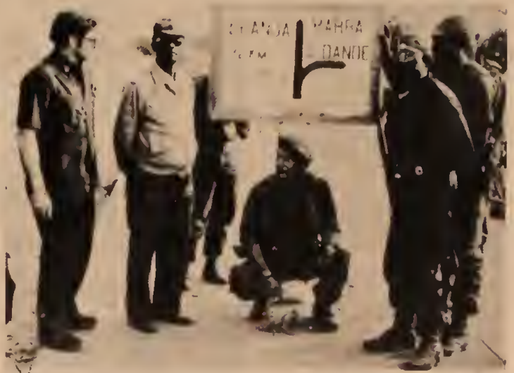
Agent Stockwell (left) standing next to Holden Roberto and Brazilian Army observer (center) in August 1975.

claims by the "critical Maoist" Guardian and other Third Worldists, as well as the Brezhnevite Communist Party that the "anti-imperialist" MPLA was committed to a struggle against the U.S.: "If Kissinger moves away from the FNLA, Neto is quite capable of pulling an Anwar Sadat-style switch, leaving Brezhnev to sue for breach-of-contract."