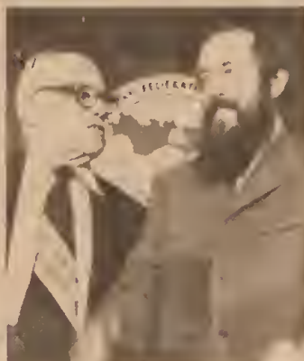
George Meany hosts Aleksandr Solzhenitsyn at AFL-CIO meet.

And in its "Collective Complaint" (7 November 1977), the Association writes: "It is the sacred duty of every citizen of the USSR to protect socialist property and to protest gross violations of human rights." It charges that