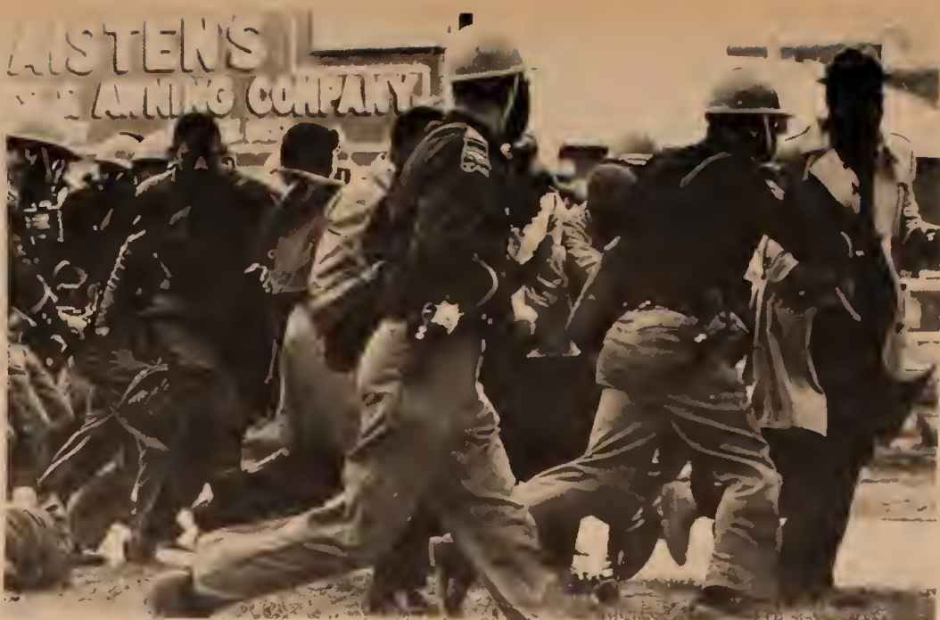
Selma to Montgomery: Alabama state troopers attack march on Pettus Bridge. King turned the next march around with a prayer.