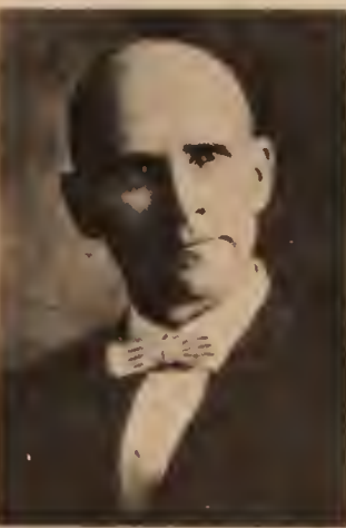
Eugene V. Debs

"Debs' mistaken theory of the party was one of the most costly