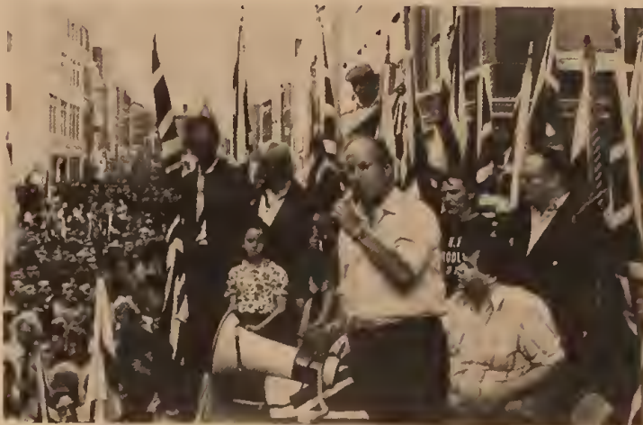
Tyndall addressing a rally of fascist thugs.

Did the balance of forces in Brick Lane on the 24th indicate that anti-fascist forces in Britain are so small and impotent? Not at all! That same day the Anti Nazi League (ANL) attracted six to one hundred thousand people to its second Fun and "Magic" Carnival, held