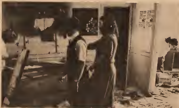
The aftermath of terror attack on SWP's Chicago office, October 2.