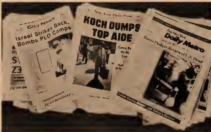
The "Interim" parasite press.

After a long string of smashed newspaper strikes and mutual scabbing by the unions, the dramatic power of the New York strike has been its solid union front. What can be won by this unity must not be sacrificed in back-room high-pressure tactics to force either the Pressmen or the Guild to make damaging concessions. Don't give up one single job to the publishers! Defend the Guild! Victory to the NYC press strike!