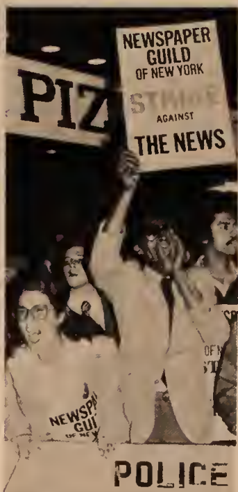
WV Photo Newspaper Guild pickets outside the Daily News building in June.

The next thing that usually happens is that the union hureaucrats try to get "pro-union" advertisers to pull their business out of the struck paper. That leads to complaints by the advertisers