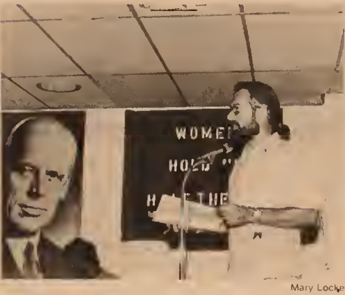
Above, "help wanted" ad placed in the SPUSA newspaper Socialist Tribune . Left, speaker at recent SP convention in Iowa City.

How to apply: Send vita, list of qualifications, a short paragraph detailing your ideas for the growth of the SP, and other helpful material (letters of recommendation, etc.) to the National Office, 135 West Wells #325, Milwaukee WI 53203