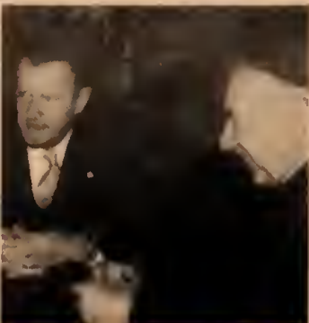
Brzezinski meets Cardinal Wyszynski.

A landholding peasantry is everywhere a deeply conservative potential bastion of reaction, whose immedi-