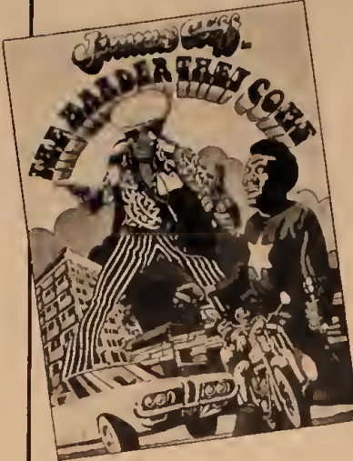
Lumpen capital of the world?

already long before the revolution most decisively opposed all manifestations of German national narrow-mindedness. But precisely for that reason we should be permitted not to share the fantastic illusions of the Slavs and allowed to judge other peoples as severely as we have judged our own." —Democratic Pan-Slavism" (February 1849)