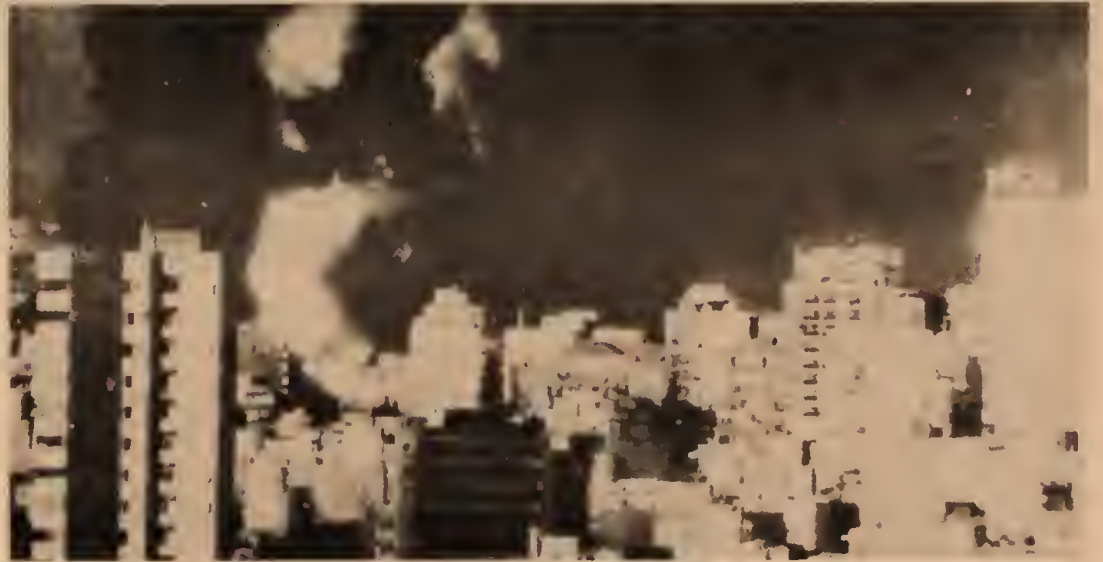
Smoke from burning oil-storage tanks engulfed Beirut as shelling continued.

The Syrians have concentrated their firepower on two bridges that link East Beirut with the Maronite northern enclave around the port city of Junieh. These bridges are the conduits for Israeli military equipment unloaded at Junieh and destined for Maronite forces around Beirut and further south. This Zionist-Maronite alliance was forged by a common foe to their respective