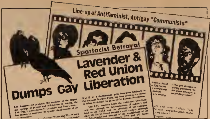
Pabloists sputter over fusion of L&RU/Red Flag Union with SL.

The same anti-proletarian tactics have been used by nationalists all over the world, from the airplane hijackings of the Palestinian guerrillas to the London subway bombings of the IRA Provos. Marxists stand on the side of those seeking to fight imperialist oppression, and defend even bourgeois nationalists in military confrontations with the oppressor state, but we in no way condone such criminal acts whose targets are not the class enemy but