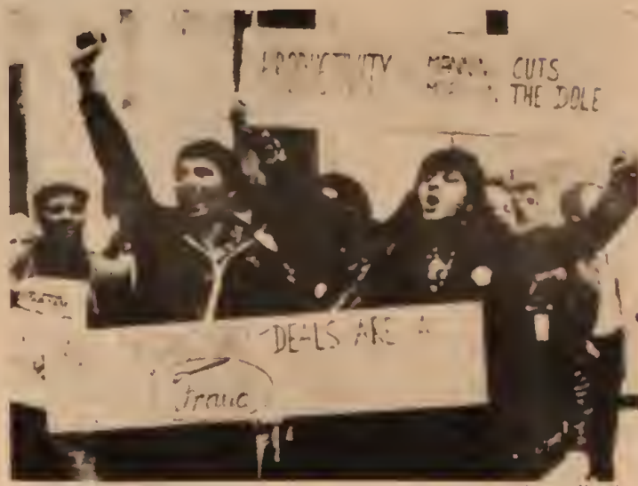
Striking Ford workers picket meeting of union bureaucrats.

Thousands of angry Ford workers walked out at nearly all of the company's 23 plants that night in response. Mass meetings the following Monday overwhelmingly backed the call for strike action. Leaders of the Transport and General Workers Union (TGWU) and Amalgamated Union of Engineering Workers (AUEW), the two major unions at Ford, were left little choice but to sanction the accomplished fact and back the strike. British workers quickly and enthusiastically rallied to the support of the Ford strikers. Dockworkers and railwaymen are preventing the loading and unloading of Ford cars