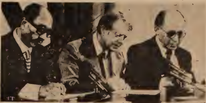
Sadat, Carter and Begin sign the Camp David "peace" agreement.

In the Near East the film of decolonization is being run backwards.