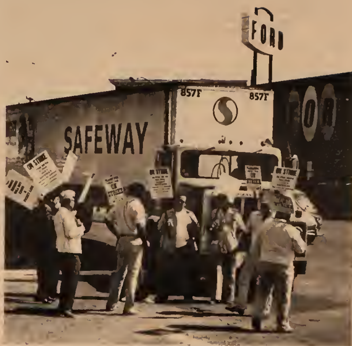
Teamster pickets stop delivery truck in front of Safeway store in San Francisco.