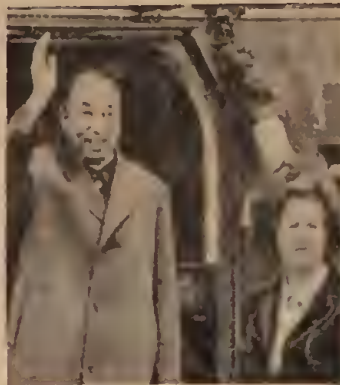
Chairman Hua and the "Iron Lady."

The British economy has gone to hell. A desperate capitalist class prepares for an all-out fight to screw up its resolve to try to restore itself to a competitive position on the world market or die