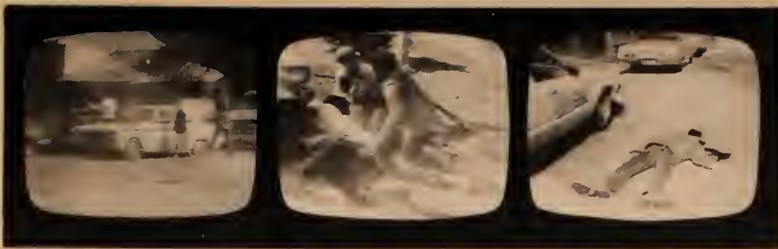
Although millions saw the cold-blooded Klan attack on their TV screens, the media alibied it as "a shootout."