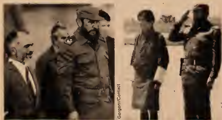
Cuban Stalinist "Líder" greets King Hussein (left) and Wangchuk of Bhutan (right).

It is not surprising, therefore, that when Castro declares the "non-aligned" continued on page 11