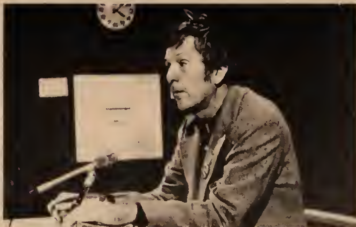
Aging social-democratic Wunderkind Michael Harrington spouts liberal mush...

What does it all mean? Actually, the only thing "democratic" about DSOC's ultra-reformist brand of "socialism" (in reality FDR New Dealism dressed in wolf's clothing) is its total subservience to the Democratic Party. Thus coming up this month is the DSOC-organized "Conference for a Democratic Agenda" in Washington, D.C. Its aim—to pressure the Democratic Party to implement its own 1976 campaign platform.