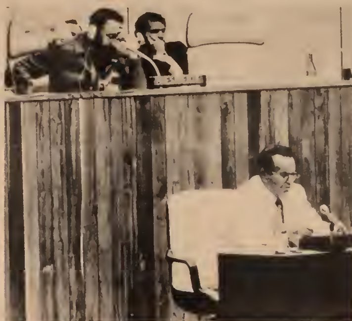
Tito pontificates, Castro yawns, at September "non-aligned" nations summit in Havana.