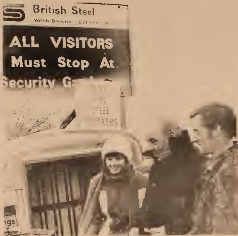
Llanwern, South Wales, steelworker pickets: Thatcher government wants to eliminate two-thirds of the jobs.

While the ISTC and NUB leaders seek to limit the strike to the single issue of higher pay, there are growing demands in the ranks that the fight must also be against the massive redundan-