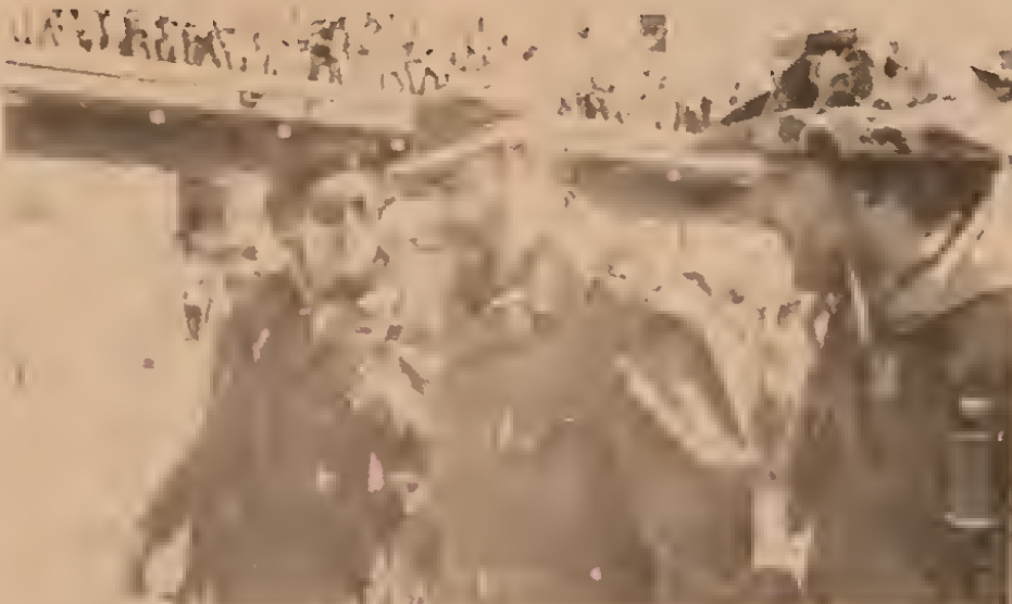
Sandinista commanders with Fidel Castro in Havana.