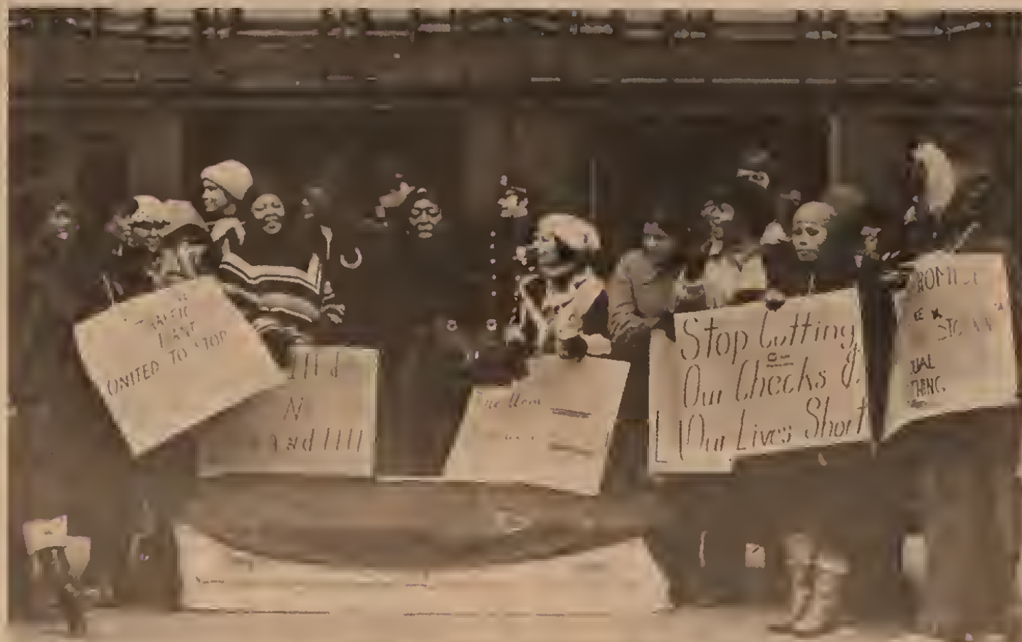
Phone workers with symbolic coffin protest company harassment that led to two workers' deaths.