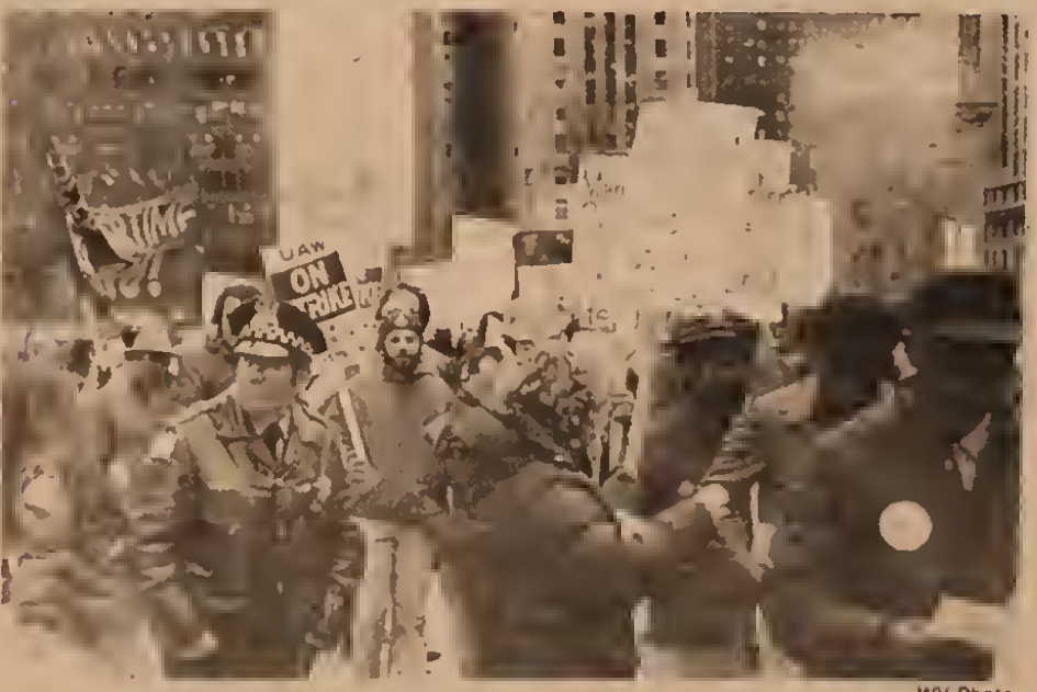
Chicago: Bitter International Harvester strike against forced overtime now enters fourth month.

attacks on UAW—not only in the agricultural implement industry but in auto as well! ■