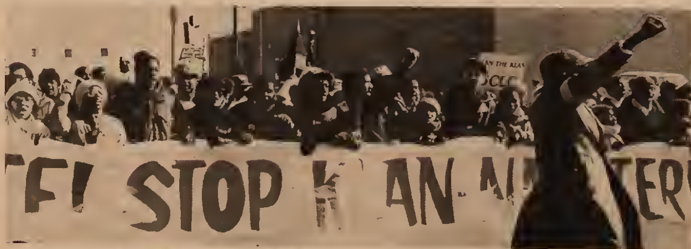
North Carolina A&T students at head of the march.

Entering the Greensboro Coliseum, the marchers' chants of "Fired Up! Death to the Klan!" were interspersed with gospel hymns, sermons and innumerable pleas to "ban the Klan." SCLC leader Joseph Lowery blasted the CWP for refusing to come unarmed. When the wives of the murdered activists came to the platform, they were greeted with thunderous applause, much to the embarrassment of the official rally leadership. Featured speaker Ben Chavis of the Wilmington Ten defended the courage of the fallen victims of Klan terror. But he was followed by the SCLC's Vivian, who sneered at the Maoists: "You're not the only ones killed." Vivian was roundly jeered for this remark.