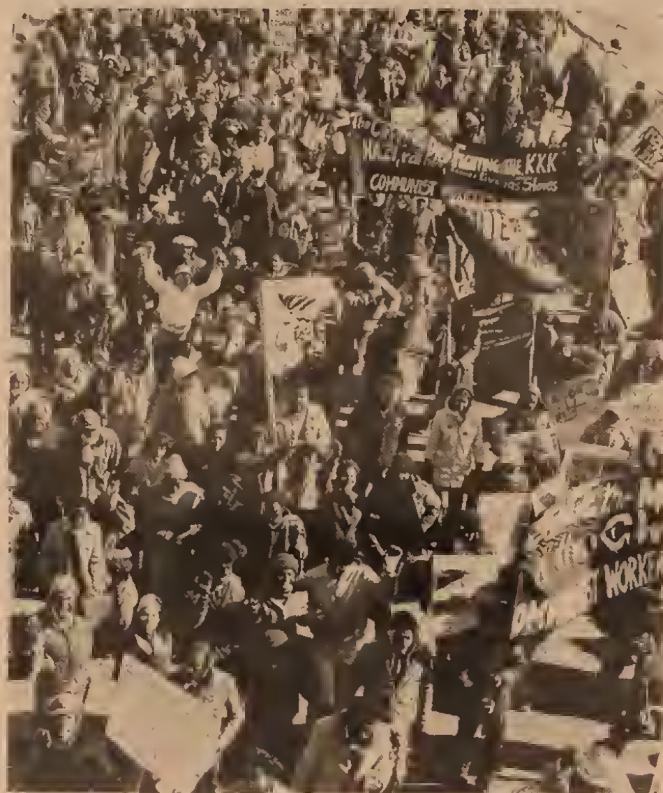
CWP banners at February 2 demo. Klan massacre sparked anti-fascist march.

The Atlanta meeting was attended by various reformist organizations as well, including the Socialist Workers Party (SWP), the Communist Party (CP) and