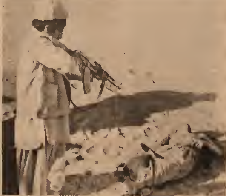
Feudalist insurgents kill Communist school teacher.

"The counterrevolutionary Kremlin bureaucracy is discrediting itself by a criminal action against the Afghan people, trampling its right to independence, intervening on its territory without any justification. Defense against external action was not the motive in telling the USSR to intervene, but, on the contrary, an obvious attempt to reinforce its own control, to maintain the status quo in the area