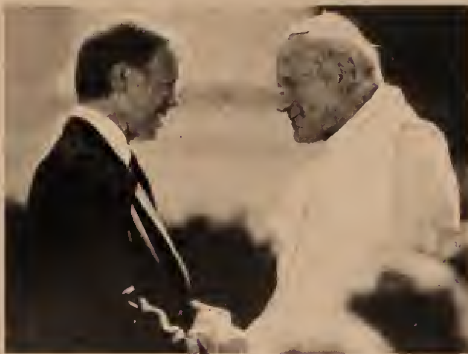
President's pope meets imperialist chief.

With the accession to the Throne of Peter by conservative Polish cardinal Wojtyla, product of the most reactionary bastion of Catholicism in Europe (outside Ireland), the crackdown on Küng and other "dissident" Catholic priests was pretty much inevitable. That Küng himself had launched a major attack on Wojtyla in October—calling him among other things doctrinaire, out-of-it theologically, a "personality cultist" media superstar and a closed,