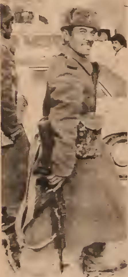
Soviet Central Asian soldier fights Islamic reaction in Afghanistan.

While the French and Spanish Mandelites slipped and slithered around all the hard programmatic positions involved, the British International Marxist Group (IMG) came out with an