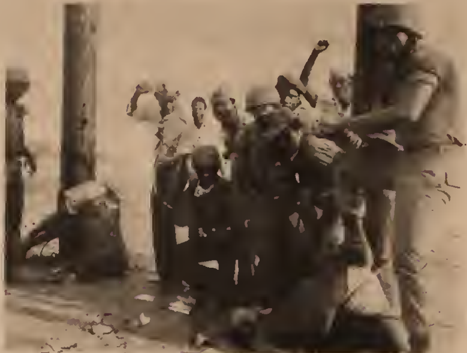
"Country people" soldiers execute True Whig leaders.

The black American colonists in Liberia were no less concerned about preserving their ethnic purity than the Dutch Afrikaners in South Africa. Today their descendants constitute a distinct ruling caste making up only 3 percent of Liberia's population of 1.8