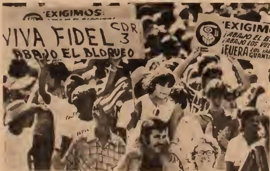
Cuban working masses demand "Down with the Blockade", "Yankees out of Guantánamo."