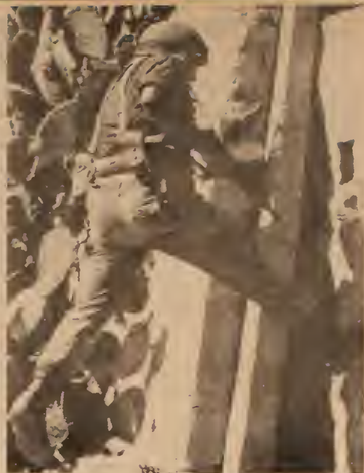
Arab Red Cross and Red Crescent

The class conflict in Israel, which today is narrowly economic, can cut across the murderous nationalist rivalries in the Near East only when it is linked by a proletarian vanguard party to the Palestinian Arab struggle for national justice. This is key to the revolutionary perspective of joint Arab/Hebrew class struggle against the Zionist and Arab rulers. Israel out of the Occupied Territories! Not Jew against Arab, but class against class! For a socialist federation of the Near East! ■