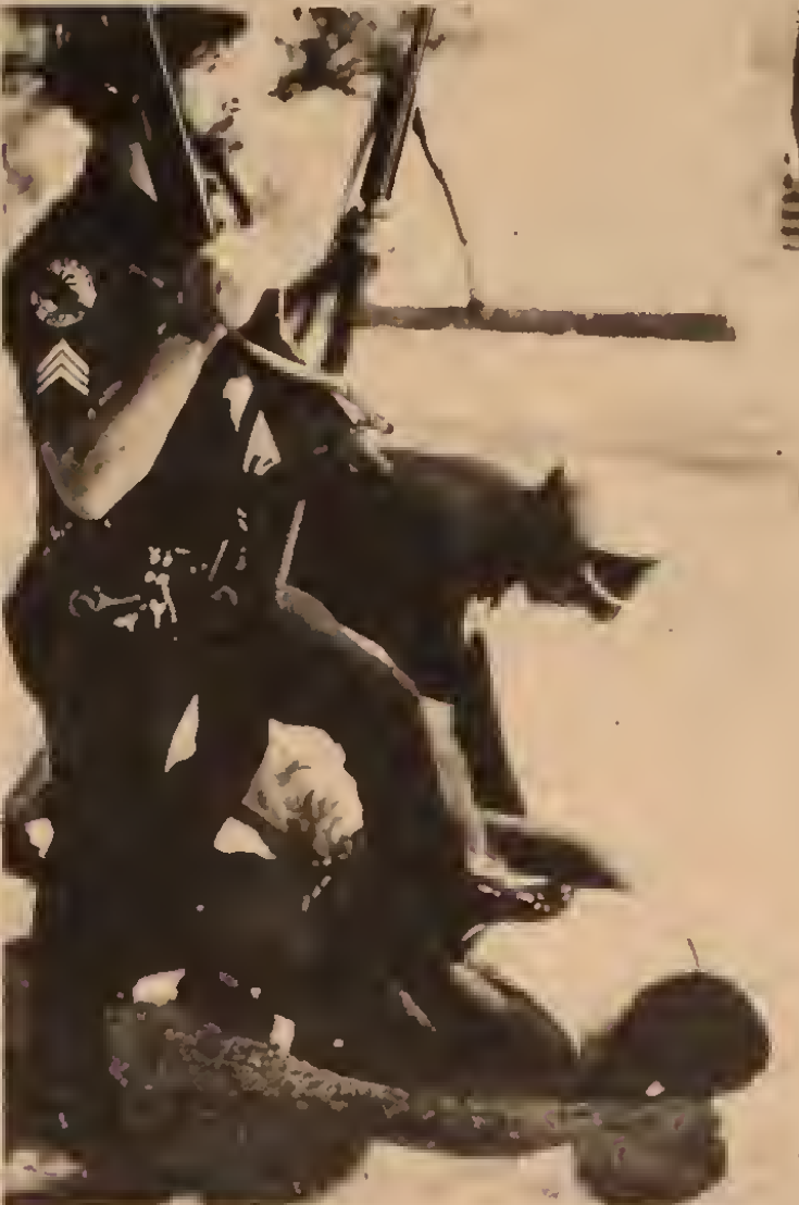
Miami 1980: Cops/National Guard out of the Ghetto! Free the victims of the racist dragnet!