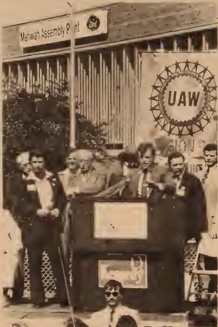
Mahwah, NJ May 5: Ted "wage freeze" Kennedy and Victor "CIA" Reuther (to his right) address crowd of soon-to-be-laid-off auto workers.