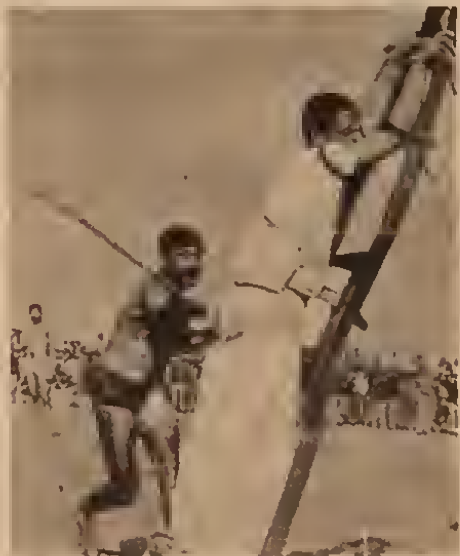
Islamic "justice" in Pakistan.

WV replies: As the comrade correctly points out, Zulfikar Bhutto was guilty of acts of terror against the working masses and national minorities. However, Bhutto was neither overthrown nor tried and executed for his crimes against bourgeois-democratic legality. Within the context of Pakistani bourgeois politics, he was a modernizing nationalist. Like all such (e.g., Nasser, Sukar-