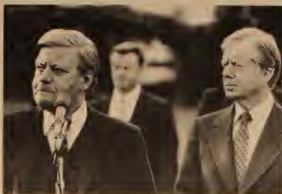
A plennig for West German chancellor Helmut Schmidt's (left) thoughts. And this peanut farmer is really the head of the most powerful state on earth. Gott Im Himmel!

issue in West German politics today, the state of the economy is definitely number two. And they are related. While West Germany is one of the strongest economies in the world, it is critically dependent on exports. The sharp depression in the U.S. and economic difficulties in many of its other capitalist trading partners threatens to pull German capitalism into a general world slump. As it is, industrial production has been flat for some months, and the consensus among bourgeois economists is for zero growth and one million unemployed by next winter. Under these conditions, West German trade with the East becomes even more important. On the eve of Schmidt's recent visit to Moscow, Beitz