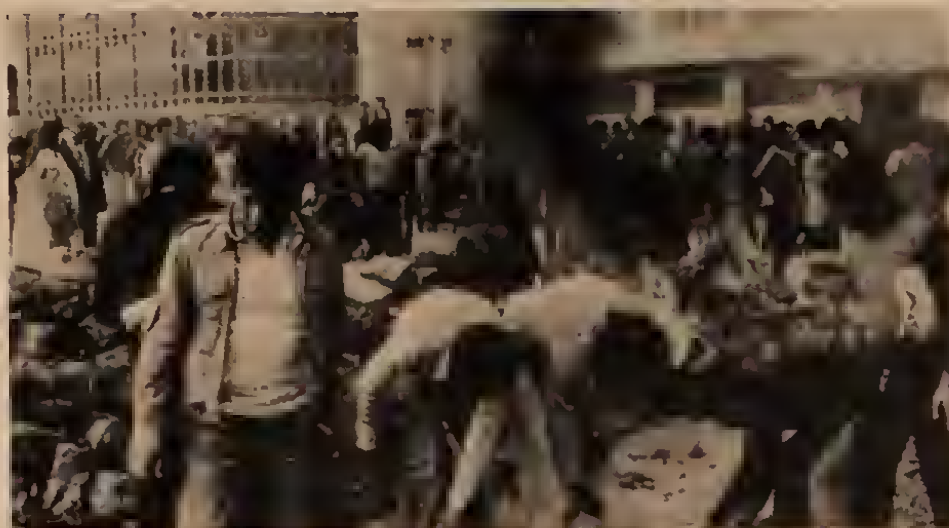
Resistance to coup: La Paz masses erect street barricades

The Bolivian working class mounted immediate resistance to the coup. In response to a call by the COB and the politicians, barricades were thrown up in the streets of La Paz and a completely effective general strike paralyzed manufacturing and transport. But the strongest response as usual was centered in the mountainous mining region southeast of the capital, where thousands of tin miners armed with dynamite occupied the mineshafts. They undercut the press blackout with their own network of clandestine radio transmitters, rallying