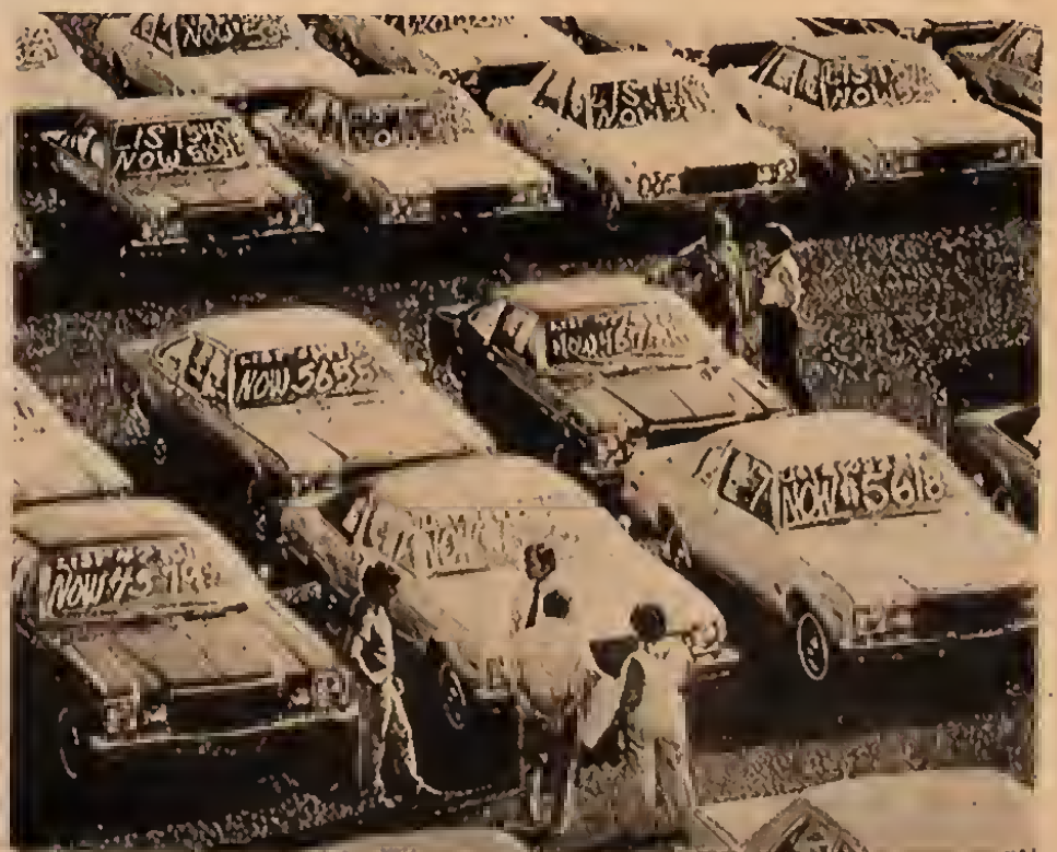
Workers must not pay for unsold Chryslers.

Since the company continues to lose continued on page 8