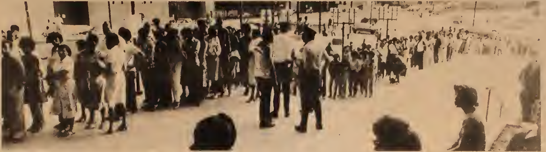
Baltimore, September 1980—10,000 people apply for 70 jobs.