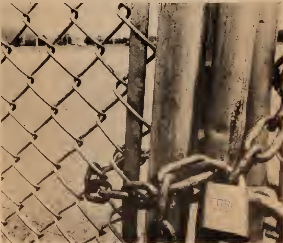
Ford Mahwah, N.J. gate closes shut behind 3,500 jobless auto workers.

Messrs. Kemp and Stockman demand that Reagan call "an economic state of emergency" to enact a few "modest proposals": reduce social-welfare programs such as unemployment compensation, Medicaid, food stamps, school