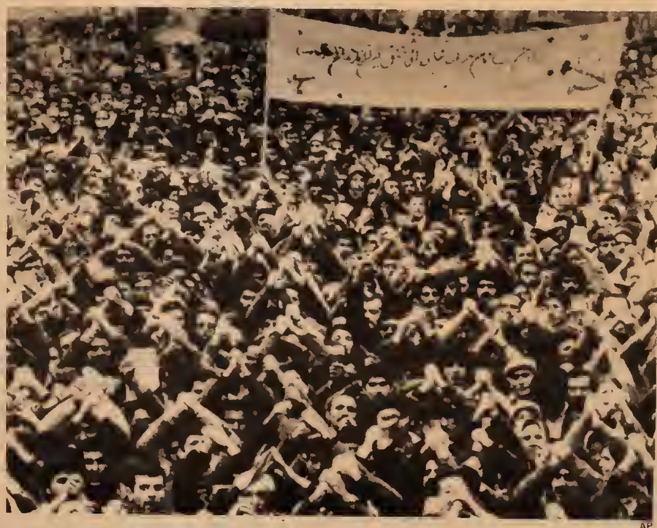
February 1979, leftist-populist Fedayeen rally behind "Islamic Revolution." Soon Khomeini reactionary fanatics terrorized left, national minorities.

From the national-defensist social-patriotism of the Fedayeen Majority to the "defend the masses" Guevarism of the Ashraf group and the social-patriotic tailism of the Fedayeen Minority, there are only differences of nuance over the Iran/Iraq war. And a "pox on both your houses" neutrality sometimes expressed by the Fedayeen Minority is only the beginning of wisdom. What is necessary is the forging in both Iran and Iraq of Trotskyist parties that can win the working classes and oppressed minorities to a common internationalist struggle. As Trotsky wrote in "War and the Fourth International" (1934): "modern war between capitalist nations carries with it a war of classes within each of the nations...the task of the revolutionary party consists in preparing in this latter war the victory of the proletariat." ■