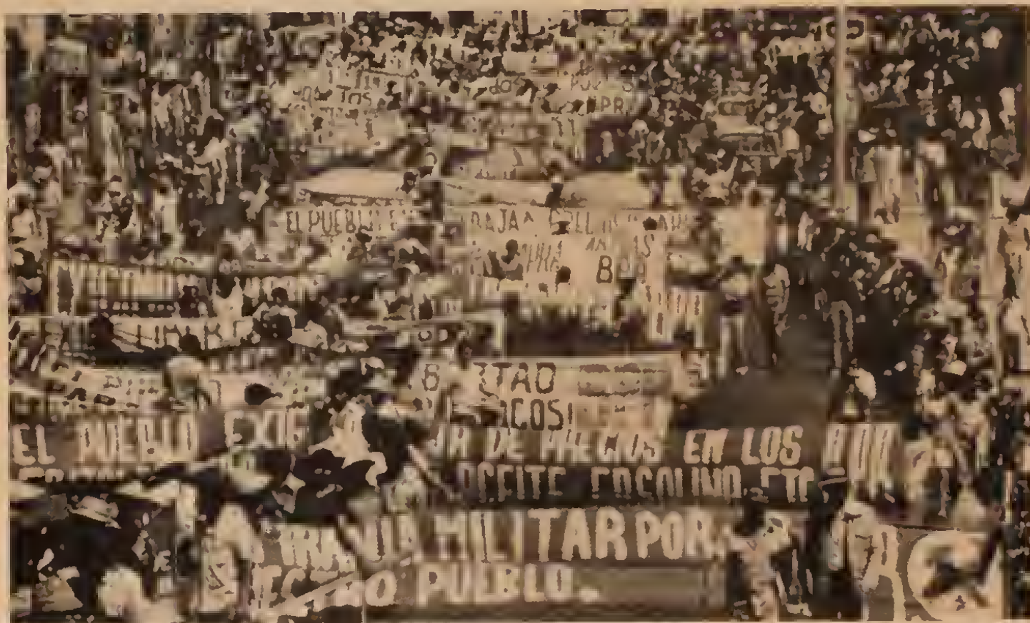
Salvadoran masses protest junta terror. Only workers revolution throughout Central America can sweep away the bloody oligarchs and their butcher generals.

Meanwhile, the anti-communist killers are in high gear with their crescendo of mass terror. The spectre of "another Cuba" in "America's back yard" has led the Republicans to signal the Salvadoran military that they will have free rein, and whatever military aid is needed, to drown the left in blood. Asked during his election campaign whether he would send the Marines into Central America, "Big Stick" Reagan replied coyly, "Never say never." There is a very real danger that El Salvador could become the victim of a Santo Domingo-style U.S. intervention, possibly with "inter-American" support from the neighboring dictatorships in Gua-