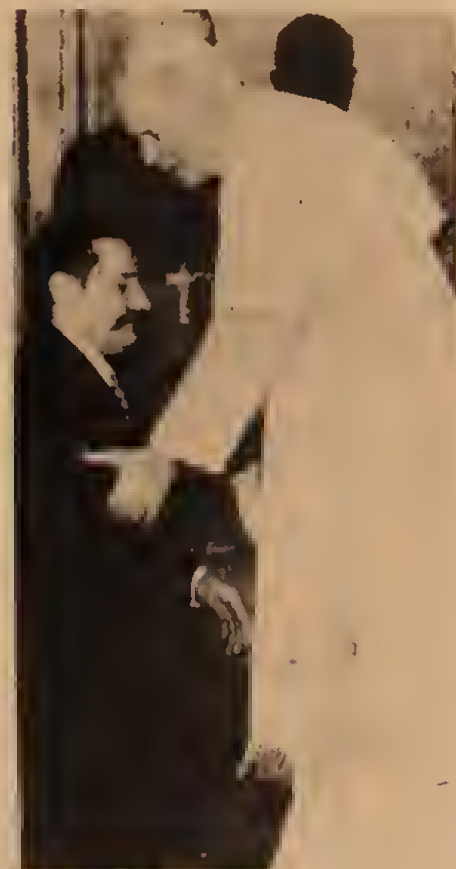
Clerical-nationalist Walesa: "I'm not a socialist."

The American Socialist Workers Party (SWP) continues in its role as self-appointed lawyer for the forces of social