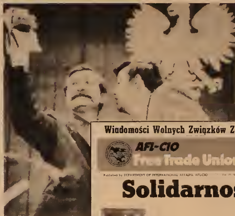
Right-wing CIA-connected U.S. labor bureaucracy sends money, propaganda to Lech Walesa's Polish Solidarity.

The AFL-CIO dollar-laundering operation, mostly via European unions (such as the Swedish labor federation,