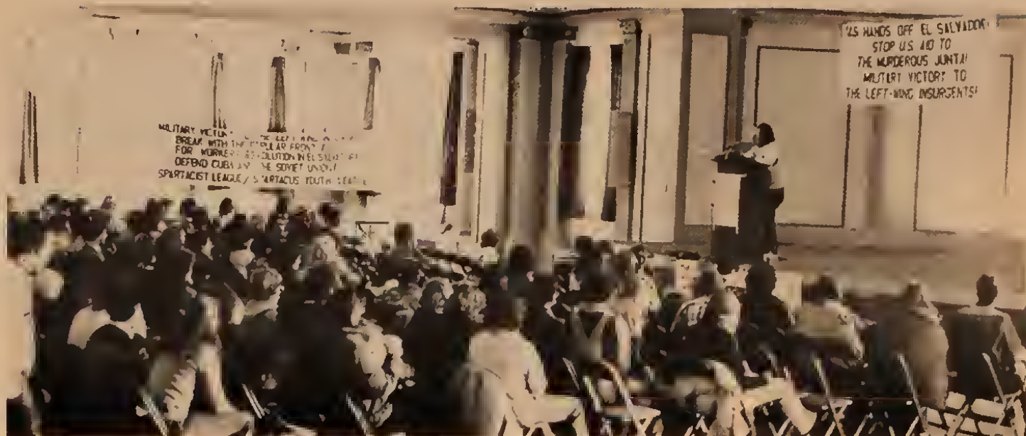
University of Wisconsin, February 4: Successful united-front rally for "Military Victory to Leftist Insurgents!"