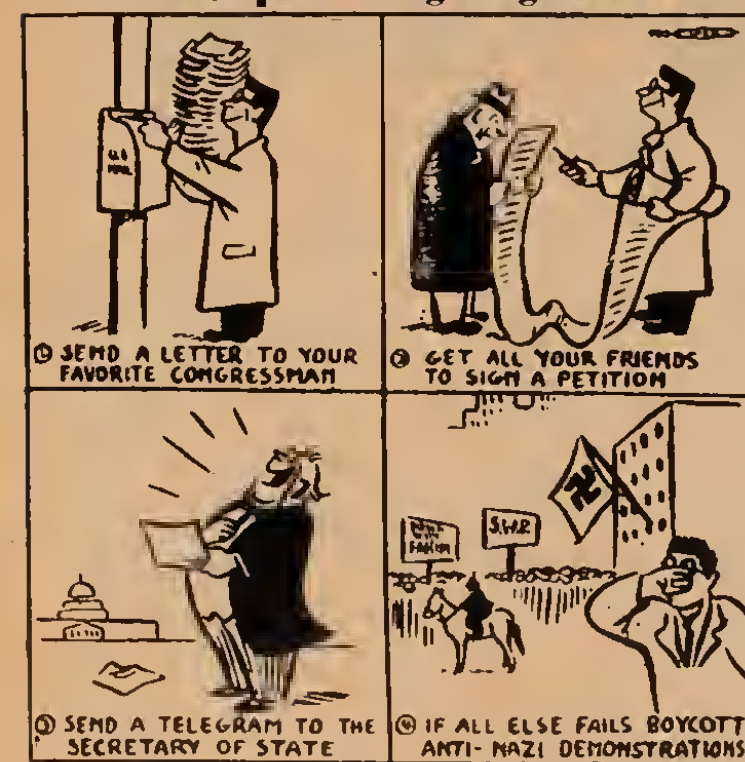
Then-revolutionary SWP cartoon: Socialist Appeal, 1939.

rhetic. This is the task which the "National Anti-Klan Network" (NAKN) set itself last weekend. Its program: beg, wheedle and cajole the man the KKK proclaimed its presidential Kandidate to "enforce the law!"