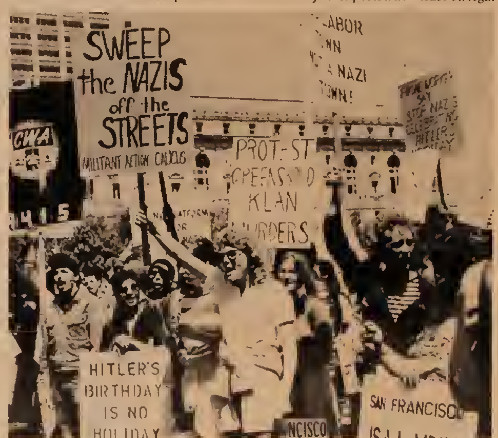
San Francisco, April 19, 1980: Phone workers contingent spearheads labor/minority mobilization to stop Nazis from "celebrating" Hitler's birthday.

The "law enforcement" Deukmejian wants is the legal framework for police action against the left, replacing the legally discredited Smith Act. The Smith Act and "Criminal Syndicalism" laws against "advocacy" were rendered moot by court decisions beginning in 1957. The Justice Department dropped hundreds of its cases against the Communist Party (CP). With a new "advocacy" law aimed at "terrorism," Deukmejian expects a new lease on legal