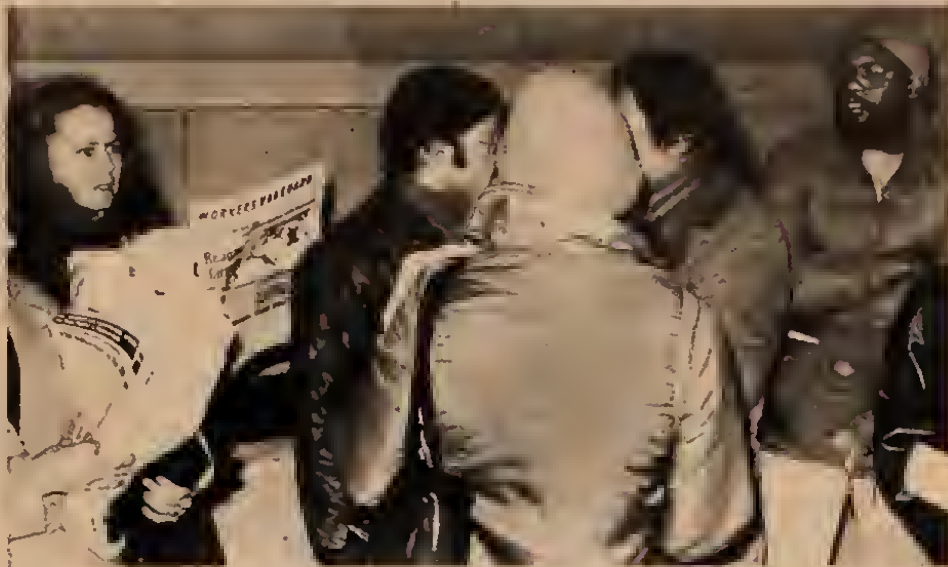
New York City, 7 February: Reformist SWP excludes communists from its "public" civil liberties meetings, but it is proud to debate the Klan.

The SWP began by harassing our comrades as they tried to sell and distribute literature on the sidewalk outside. The action got going in earnest when three Spartacist comrades tried to enter the meeting hall to attend the rally. As they mounted the steps, a goon squad of at least a dozen SWPers forcibly blocked their path. Then this wall of beef backed the three SL women down the steps and onto the sidewalk.