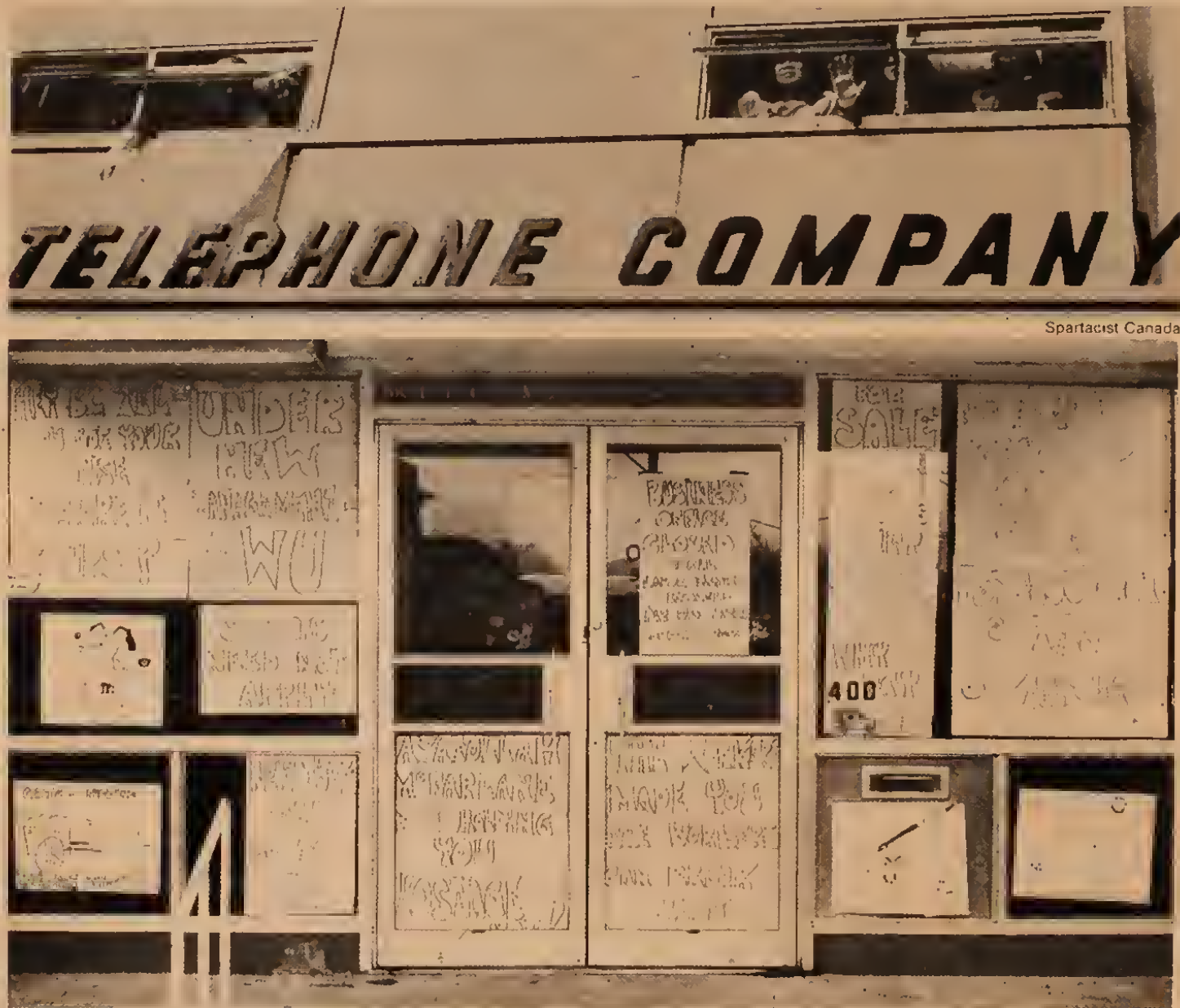
Phone workers occupy B.C. telephone installations in province-wide sit-down strike.

B.C. Tel is notorious for its anti-union arrogance. It took a bitter 81-day strike to force management to sign the last contract, and since it expired the company has been on a concerted campaign of threats, provocations and