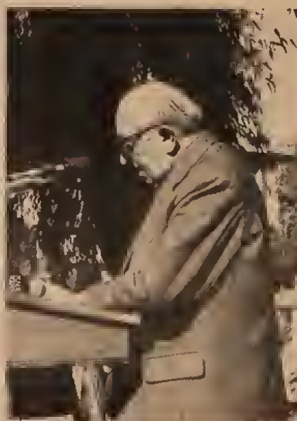
Los Angeles, January 25: Nazi-hunter Simon Wiesenthal speaks at Holocaust Center.

On January 25, 2,000 people rallied for a ceremonial "cleansing" of the Nazi slogans and swastikas painted on the walls of the Wiesenthal Center. The Nazi-hunter flew from Vienna to participate. Apart from a ritual cleansing, the only other "action" proposed was the circulation of a petition calling on Ronald