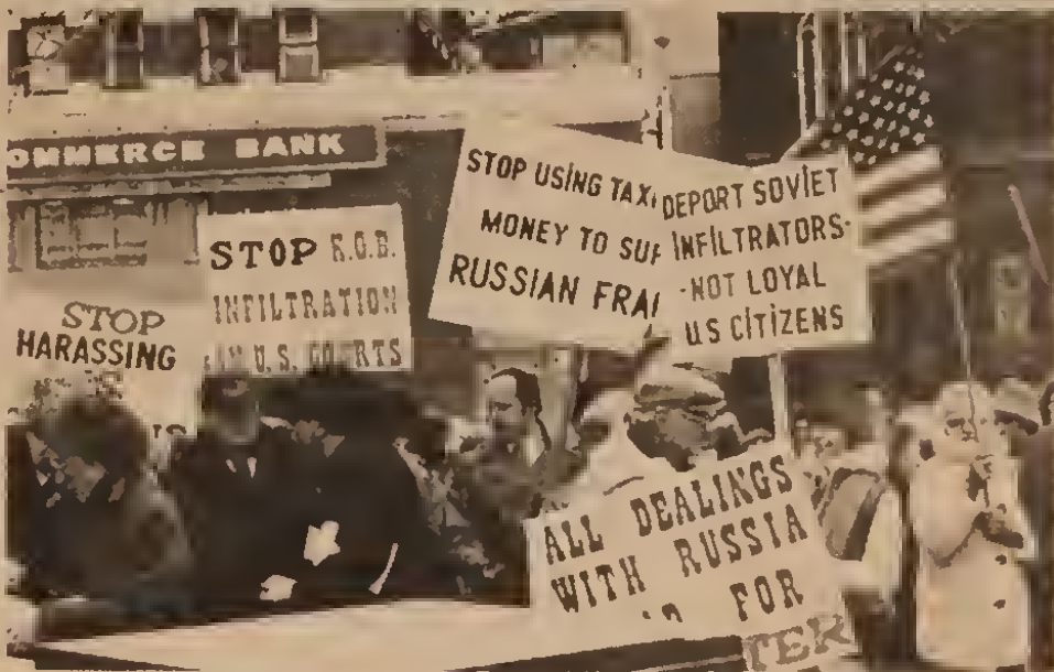
Cleveland, February 10: Anti-Soviet Ukrainians demonstrate for Nazi war criminal.