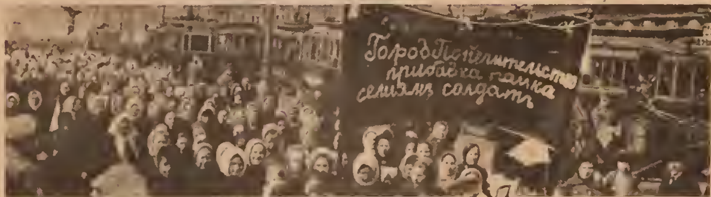
Revolutionary Russia, 1917: Women demonstrate for pay increases to soldiers' families.