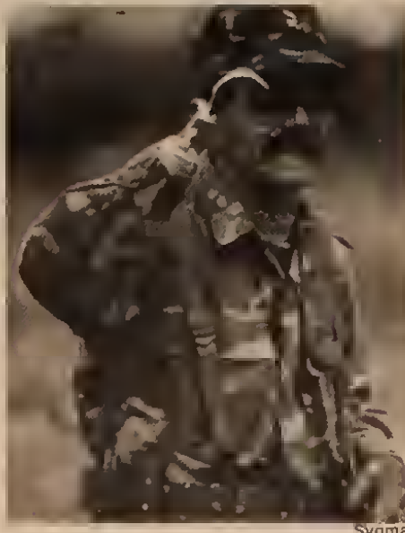
Gusano Captain Hook. Too bad he escaped the Bay of Pigs.

So far, the "objective" offered to the Nicaraguan masses has not been the expropriation of the capitalist class but