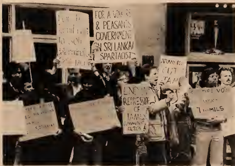
Ceylon Tea Centre, London, June 6. In London, New York and Bonn, International Spartacist tendency joined with exile Tamils to protest murderous repression in Sri Lanka.

(see exclusive photos of the destruction and murder on facing page).