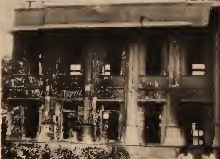
Jaffna public library with ancient archives and stacks destroyed.