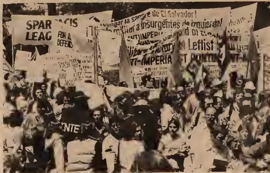
May 3 Anti-Imperialist Contingent, Washington, D.C.

When the May 3rd weekend came around I was on a bus with the PAM group. On the way down a PAM organizer asked for volunteers to help "police" the march. She said that "marshals" were needed to help keep