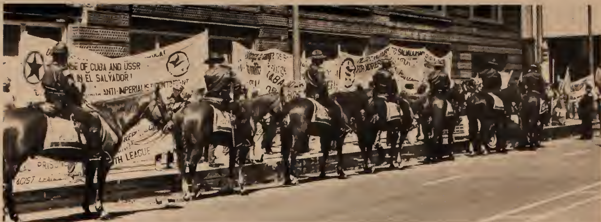
Chicago, May 30: Stalinists call capitalist cops to cordon off Anti-Imperialist Contingent.