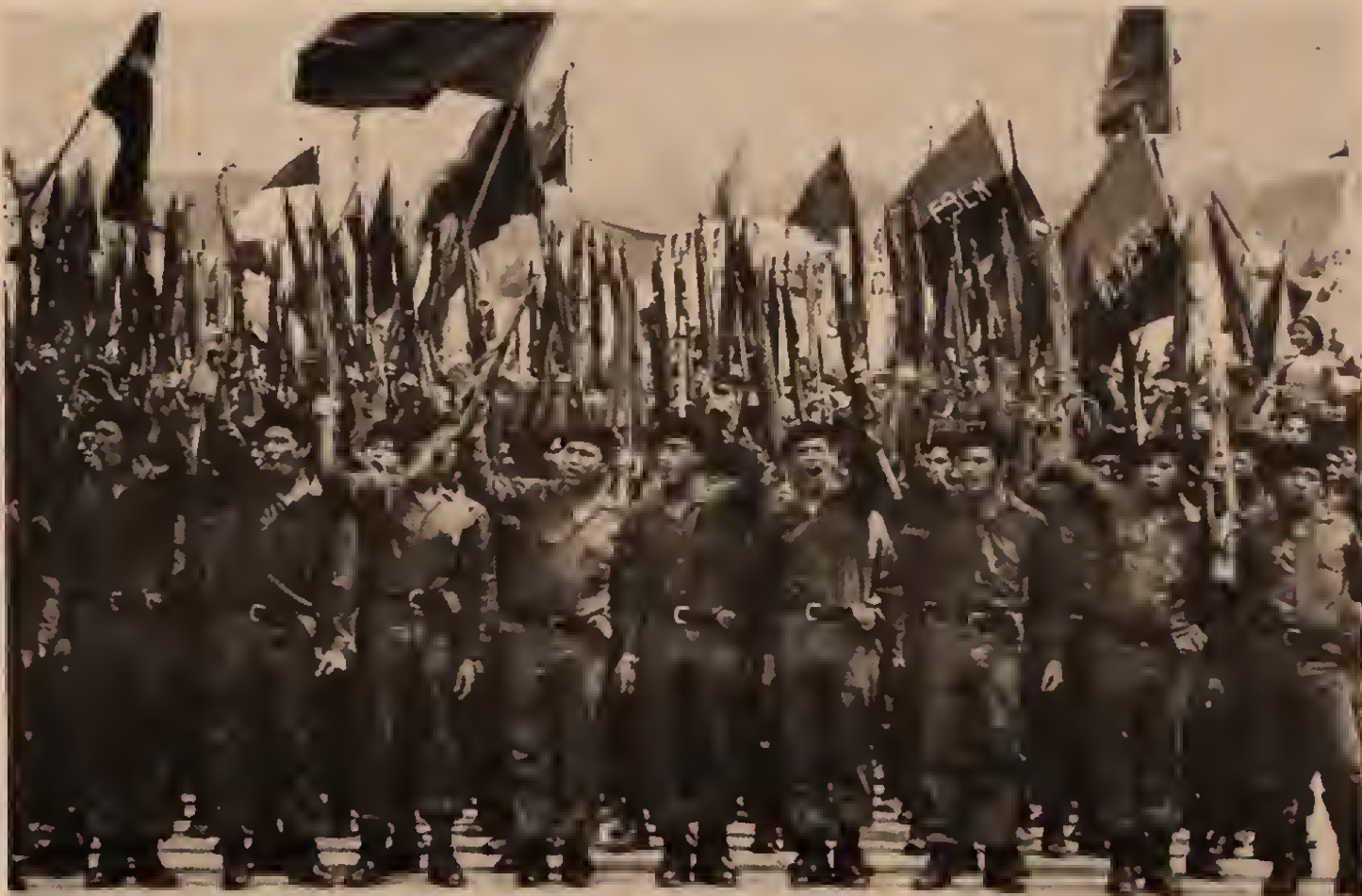
19 July 1980: Sandinista army celebrates first anniversary of Somoza's defeat.

"Détente" deals are dead. The Republicans came to power on the back of Carter's Cold War crusade vowing to roll back the "Marxist Sandinista takeover of Nicaragua." Once in office, the Reaganites have pushed Managua to the wall, vituperating against "a Soviet plan to communize Central America and use that land bridge as a dagger pointing north and south" ( New York Times , 16 May). Having made El Salvador the nexus of its anti-Soviet war drive, continuing the Carter Democrats' support to the murderous junta, Reagan/Haig threaten Cuba and Nicaragua with dire consequences over their (unfortunately) mythical aid to leftist Salvadoran rebels. But just who is it that is exporting "international