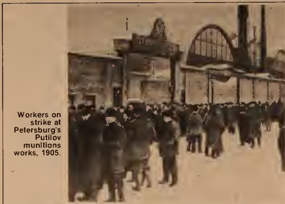
Workers on strike at Petersburg's Putilov munitions works, 1905.

So the Menshevik conference, which adopted the resolution a part of which I