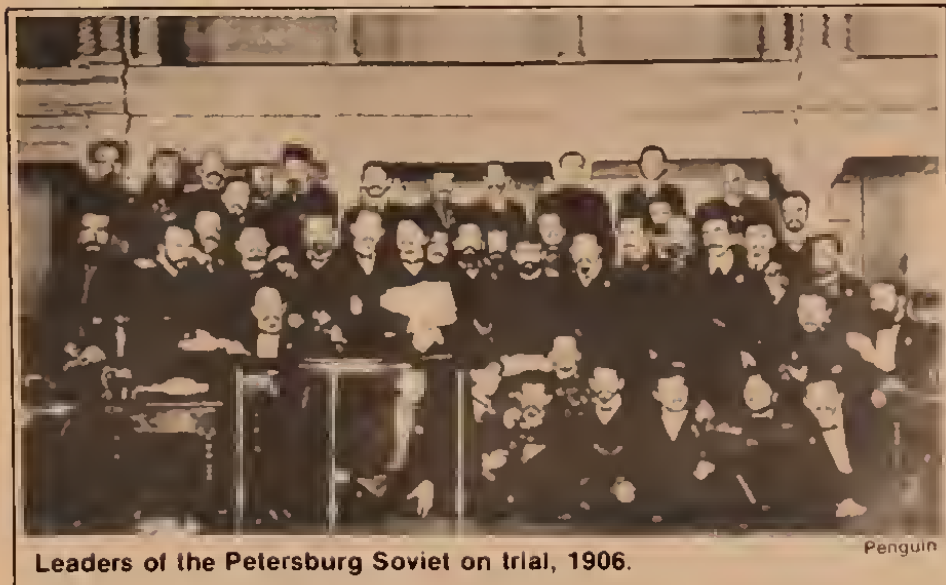
Leaders of the Petersburg Soviet on trial, 1906.