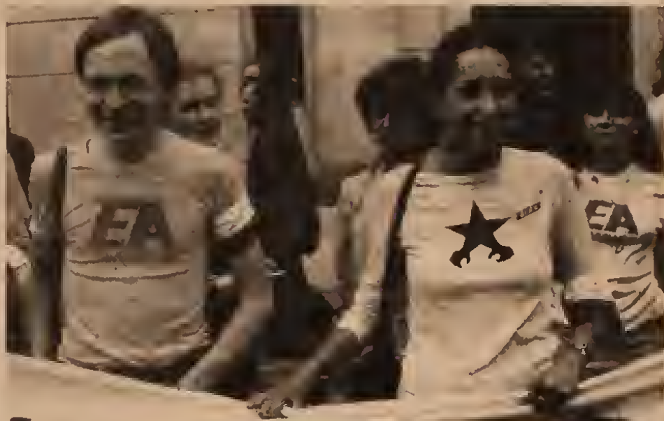
Counterrevolution is no joke. Polish university students wear "EA" ("anti-socialist element") T-shirts.

But Soviet military intervention against Solidarity will have an entirely different character than its intervention against the Islamic reactionaries in Afghanistan, which opened the possibility of liberating the Afghan peoples from the wretched conditions of feudal and pre-feudal backwardness. There we said, "Hail Red Army!" In Poland it is the Stalinists themselves, through decades of capitulation to capitalist forces,