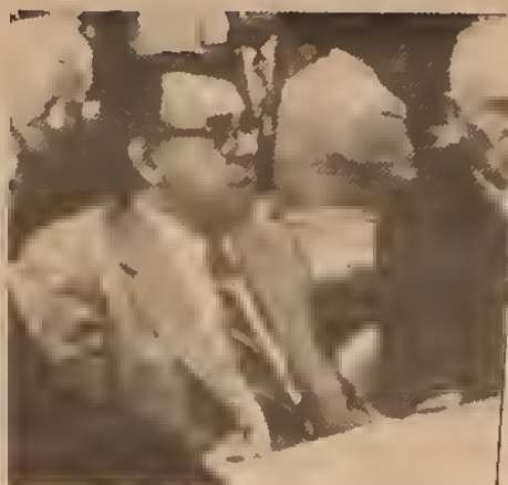
Free Trade Union News