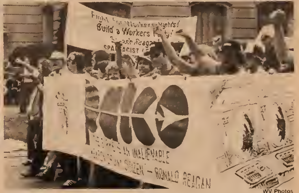
AFL-CIO organized largest labor demonstration in U.S. history, but refused to call solidarity strikes in support of PATCO.

And they are. The unprecedented labor demonstration was called to answer Reagan's charge that union leaders like AFL-CIO president Lane Kirkland were "out of touch" with their members. The 44 percent vote for Reagan by unionists in 1980 backed up this implied threat, and the administration's actions in Congress and toward the PATCO strike show it feels it can safely ignore Kirkland & Co. The response of the labor fakers and the broader purpose of September 19 was to reforge the unions' traditional ties to the