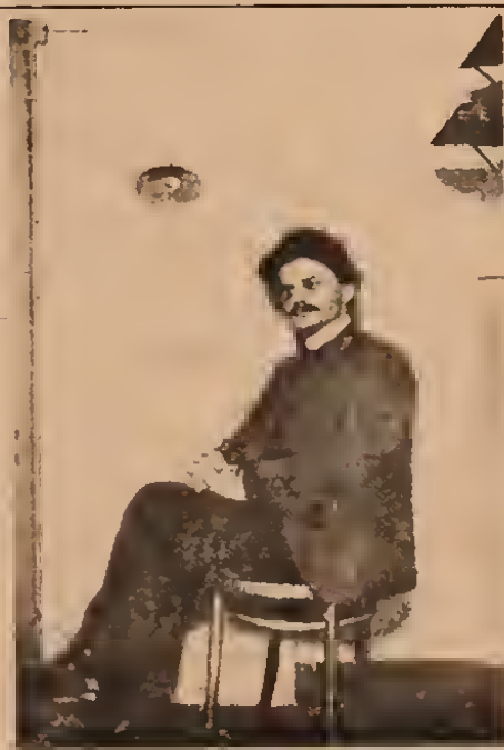
Trotsky In prison, 1906.