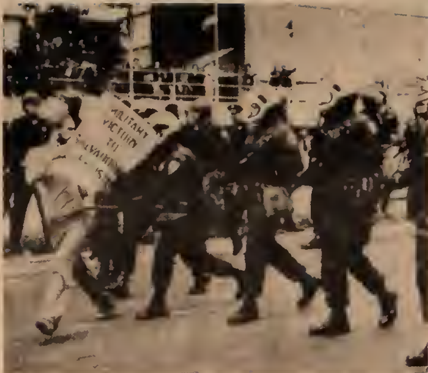
Silver/City on a Hill