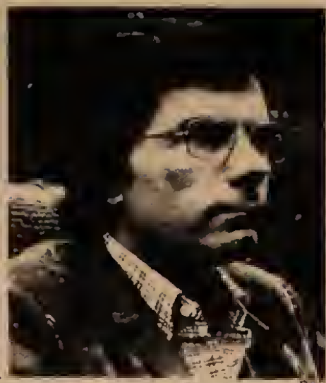
CIA nemesis Philip Agee.

The Reaganauts hope these new laws will put an end to the "Pentagon Papers/Watergate era" of widespread disgust with the CIA's Murder, Inc. and intimidate more active exposers like Covert Action . Of course the CIA, FBI, NSA et al. intend to "refurbish" themselves in any case, with or without the benefit of protective legislation, as