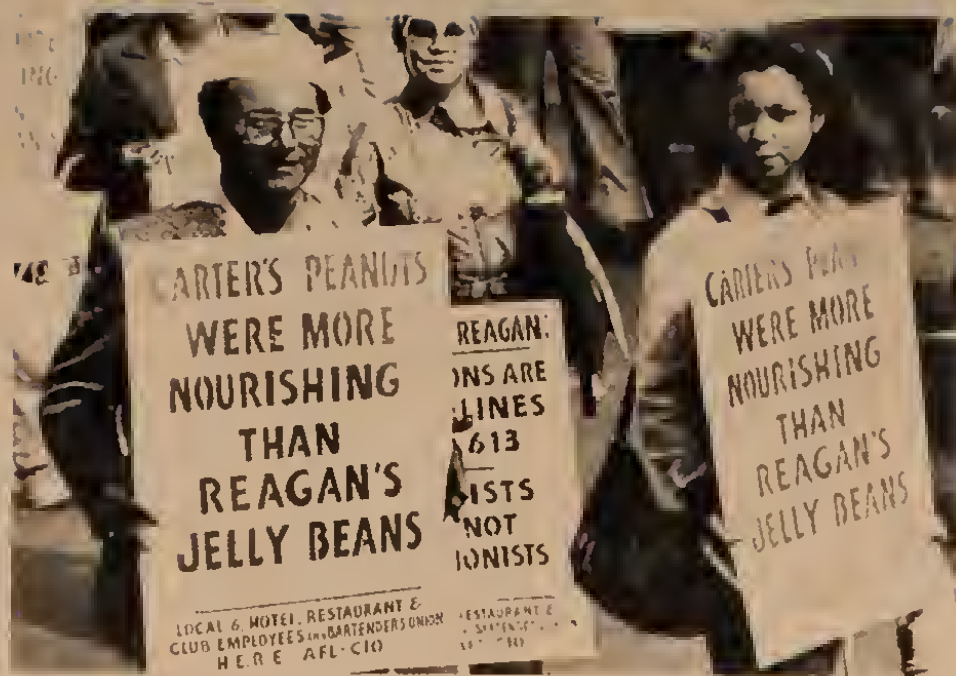
Solidarity Day, September 19: APC feeds illusions in the Democrats.

Then there are the tagalongs—reformists and centrists like the CWP, RSL, RWL who tried to cash in on the