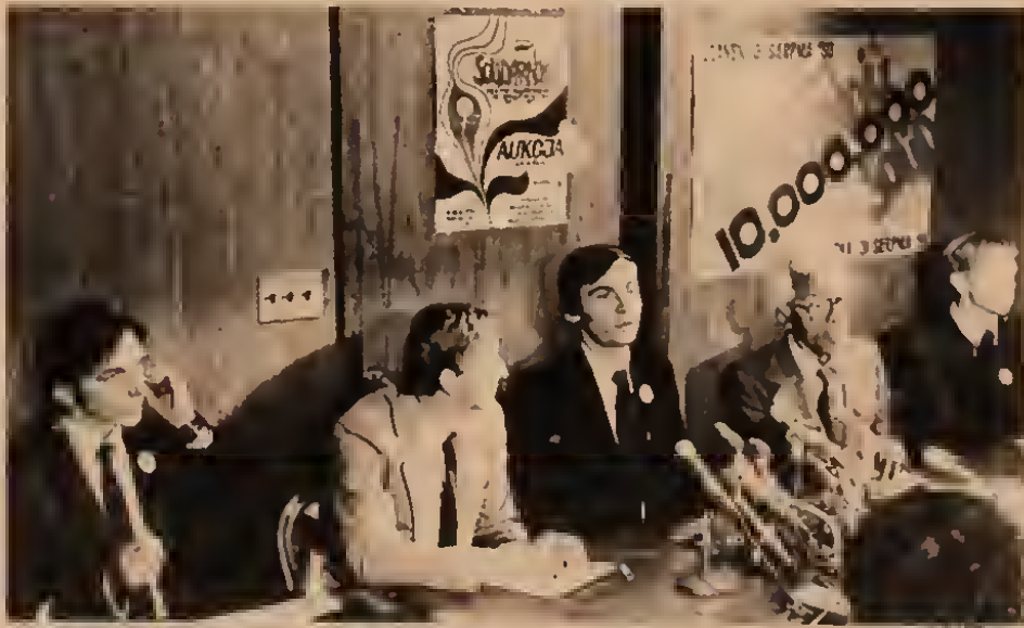
"State Department socialists" flank zippered-lip Solidarność spokesman.

But they should not be allowed to do so easily. While the American labor movement has at times in recent years identified itself too closely with political parties and administrations for our liking, on the whole it remains a free and independent force pitting its weight against state power both in the U.S. and abroad. Its efforts on behalf of political freedom are thus significant. Anyone seeking to delegitimize its performance in this realm should be aware of just how serious an attack he is launching.