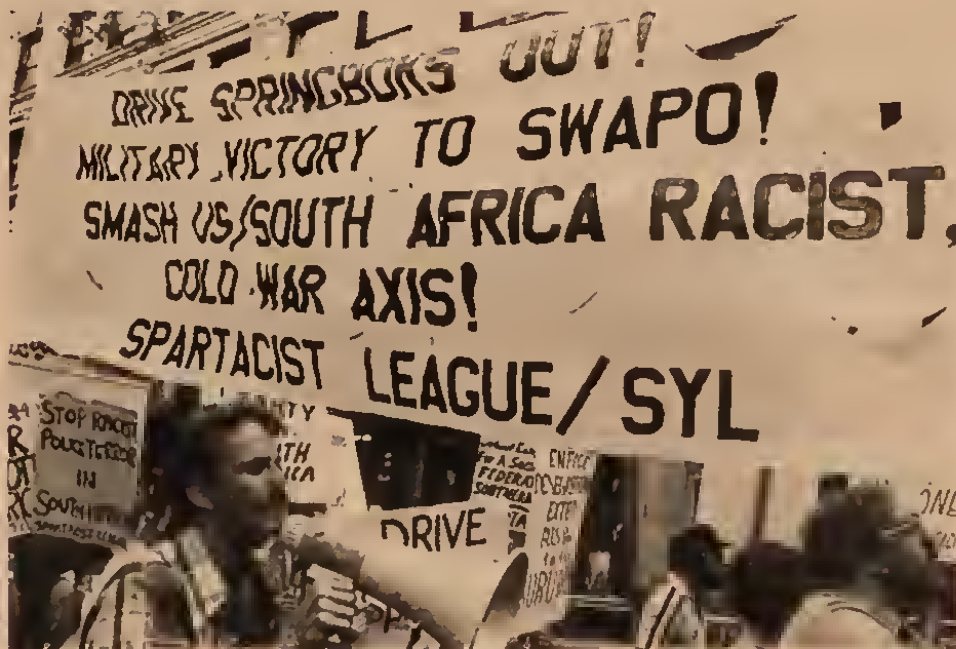
Chicago, September 12—SL/SYL said: Drive Springboks Out! Reformists asked Reagan to cancel their visas.

The Spartacist League and Spartacus Youth League actively participated in anti-apartheid protests against the Springboks tour, demanding "Drive Springboks Out! Military Victory for SWAPO! Independence for Namibia! Smash U.S./South Africa Cold War Axis!" In contrast, various liberals and reformist lefts including the Communist Party (CP) responded with the demand, "Wire Reagan: Cancel Springboks Visas." The only visas Reagan is going