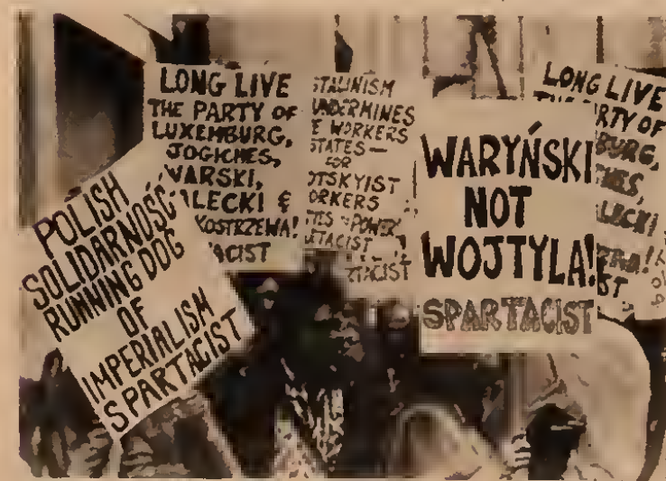
The demonstration the bourgeois press blacked out.

U.S. imperialism has gone all out to build up Solidarność as a "democratic" opposition to Stalinism. With its "press" offices, its U.S. dollars funneled through the AFL-CIO, its echoing of Cold War propaganda; Polish "Solidarity" has become an instrument of the capitalists' crusade, more than six decades old, to overturn the social and economic achievements won by the Russian October Revolution. And they don't want any Western socialists fouling up the works by exposing the counterrevolutionary danger for what it is. Newsmen reported that, on more than one occasion, references to the Spartacist demonstration in stories on the opening of the NYC Solidarność office were cut out by the editors. That was a blackout. That is, until five days later, when the Wall Street Journal published its threatening editorial, "Communists and the AFL-CIO." That made it clear who the American friends of Polish Solidarność are. ■