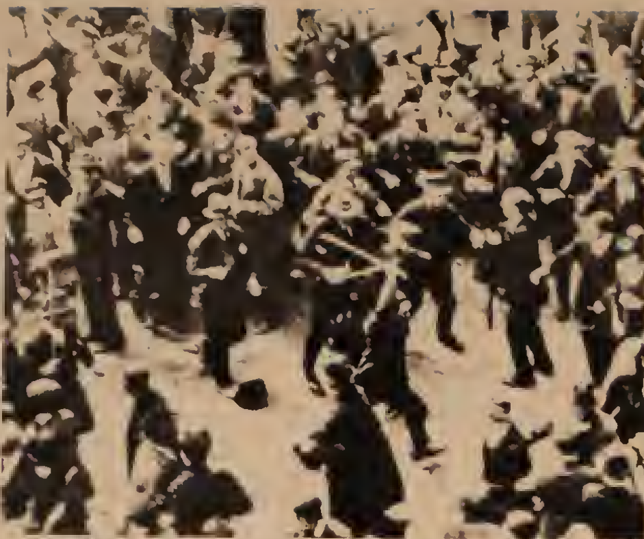
May Day, Warsaw 1928: Mass Communist-led demonstration fired on by Pilsudskilite guards and Social Democratic militia.

The misguided Communist Party leaders, like Adolf Warski, had been