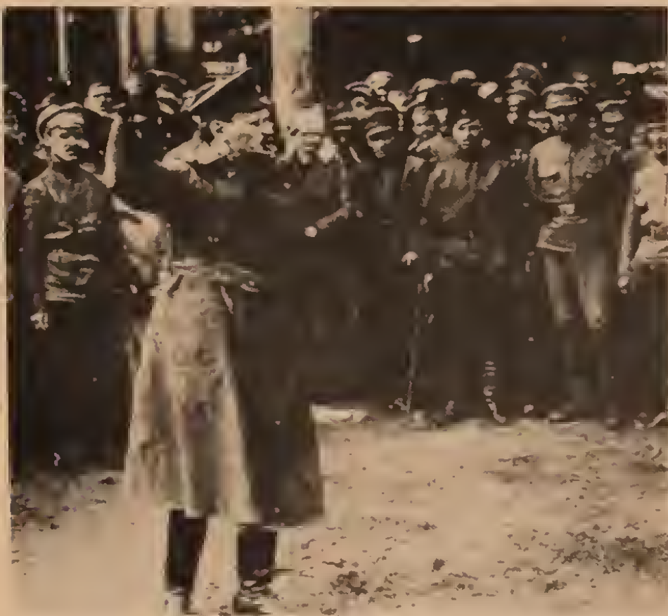
Trotsky addresses Red Army troops on the march to Warsaw, 1920.

In the years leading up to World War I, Pilsudski shifted his organizational base from his own ultra-nationalist wing of Polish socialism to paramilitary groups that were to be the core of his legionary movement. When the war broke out Pilsudski's legionnaires allied themselves with Kaiser Wilhelm's Germany against tsarist Russia. The Bolshevik Revolution and Russia's withdrawal from the war with the 1918 Brest-Litovsk treaty radically altered the situation in Poland. The Germans, no longer needing and not trusting their erstwhile Polish allies, imprisoned Pilsudski. When Germany was defeated on the Western Front in late 1918, an independent Poland, like the other new East European states, was created by the Treaty of Versailles. This new national Poland was a client state of French imperialism acting as a barrier between Bolshevik Russia and defeated Germany, then in revolutionary ferment.