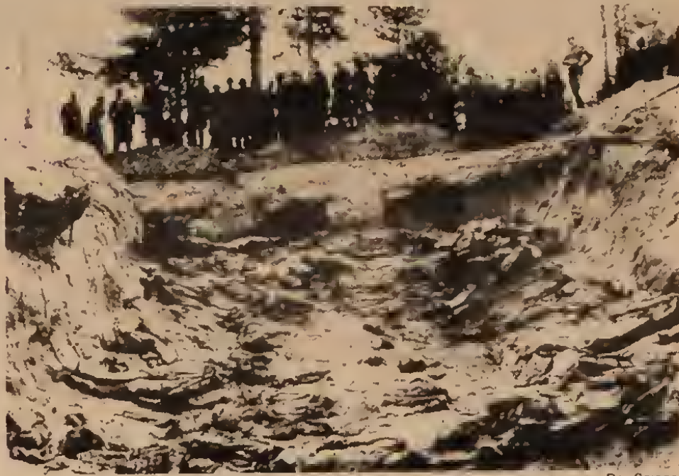
Exhuming bodies in Katyn Forest, 1943: massacre was no crime against the Polish working class.

"In the last prewar years, under the influence of the ephemeral friendship with Nazi Germany and under the pressure of radically anti-Semitic