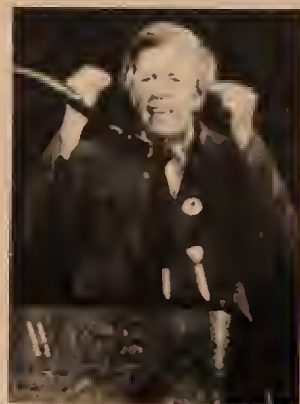
Michael Harrington, piper of Reagan's Cold War II.