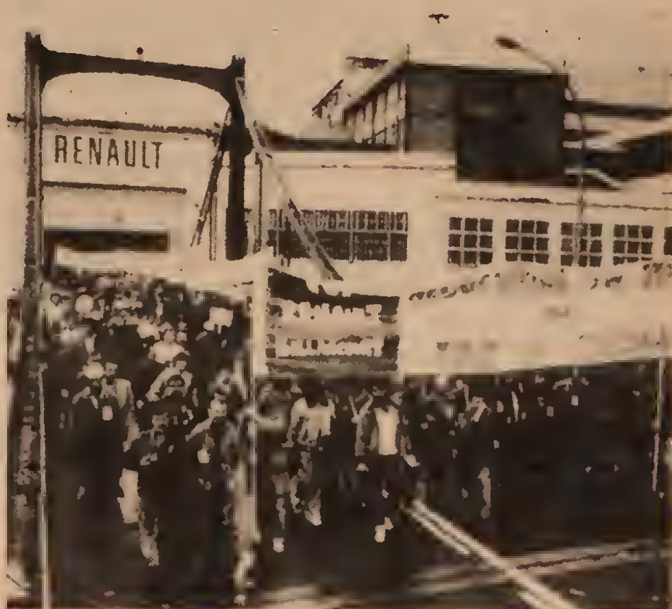
Rouge Socialist Party's François Mitterrand wants to make nationalized firms profitable. Workers at nationalized Renault strike against austerity.

The leftover French "far left," however, hailed the election of Mitterrand as the "victory of May 10" and since then has been mainly concerned to cash in on his initial popularity. The OCI proclaimed the nationalizations to be "first steps toward socialism," while the LCR withdrew its slogan for a general strike in order "not to play into the hands of the right." The Ligue Trotskyiste de France (LTF) was unique in proclaiming "No to NATO Popular Front!" in last spring's cycle of elections,