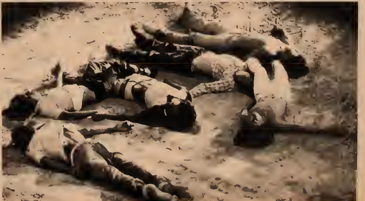
Salvadoran junta has murdered more than 30,000 in the past two years.