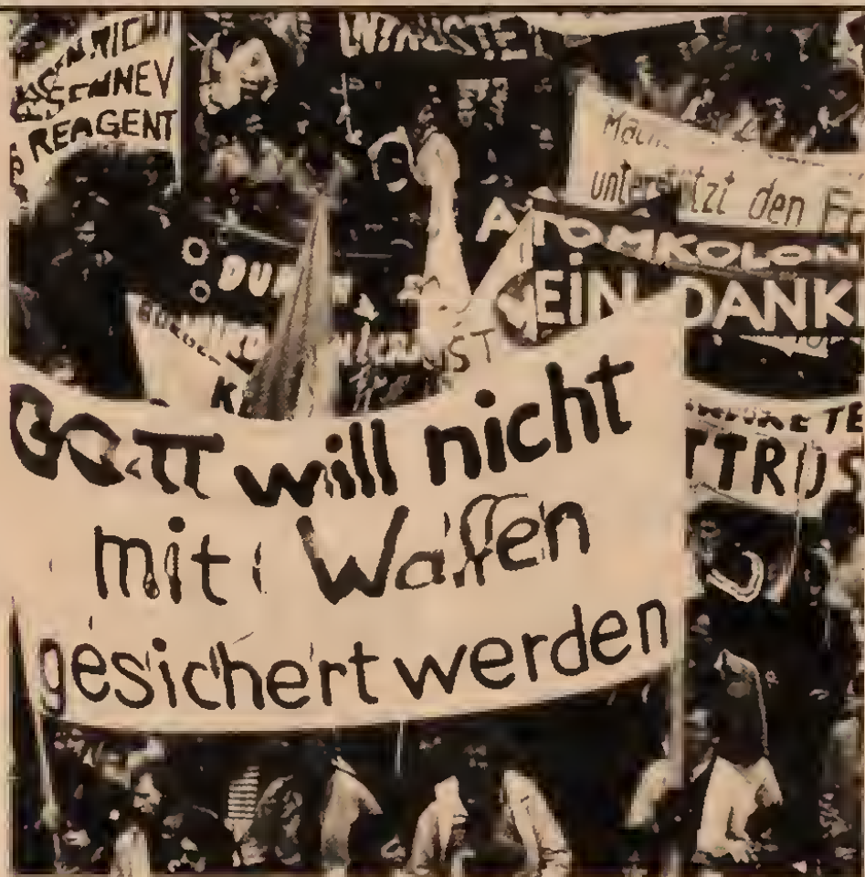
300,000 march in Bonn 10 October 1981 against new Euro-missiles. German Social Democrats exploit fear of Reagan’s war drive to push German imperialist ambitions.

The controversial December 1979 NATO “two-track” decision (rearmament plus arms talks) had two purposes. First, the new generation of nuclear weapons are intended to enhance the imperialists’ first strike capability since they can reach Russia more quickly than American-based ICBMs and more accurately than submarine-launched missiles in European waters. Second, they are an integral part of the Pentagon’s strategy for a war against the Soviet Union to be fought entirely in Europe. It is the second factor, not the first, that has produced widespread opposition to the Pershings and Cruises. As West German Social Democrat Günter Gaus, a confidant of SPD chairman Willy Brandt, put it: “West Germany would become an American province in the meaning the term ‘province’ had in the Roman Empire.”