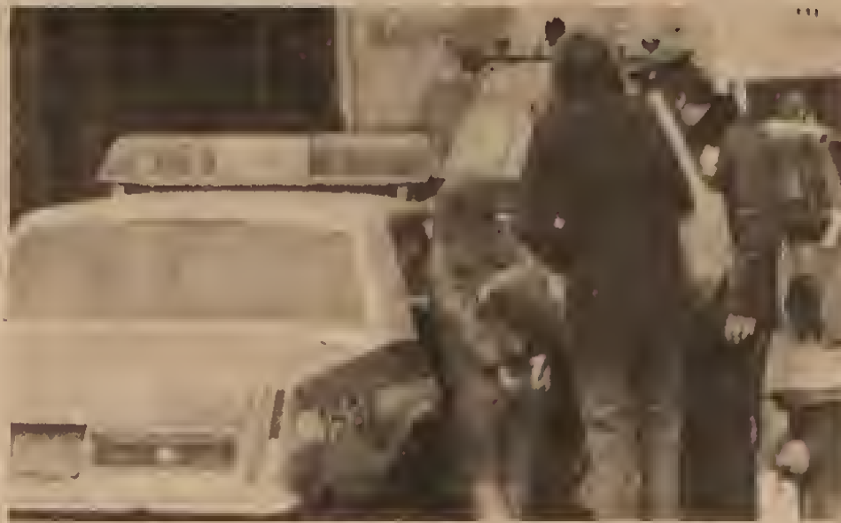
NYC, February 2: AT&T has phone militant dragged out and arrested by city cops.

"This is a basic union principle. You never cross a picket line and you don't have finks in the union. But the CWA has let the company force union members to do this kind of work. The union has to put a stop to this! If the CWA allows finking, it comes down to whether we're going to have a union or not."