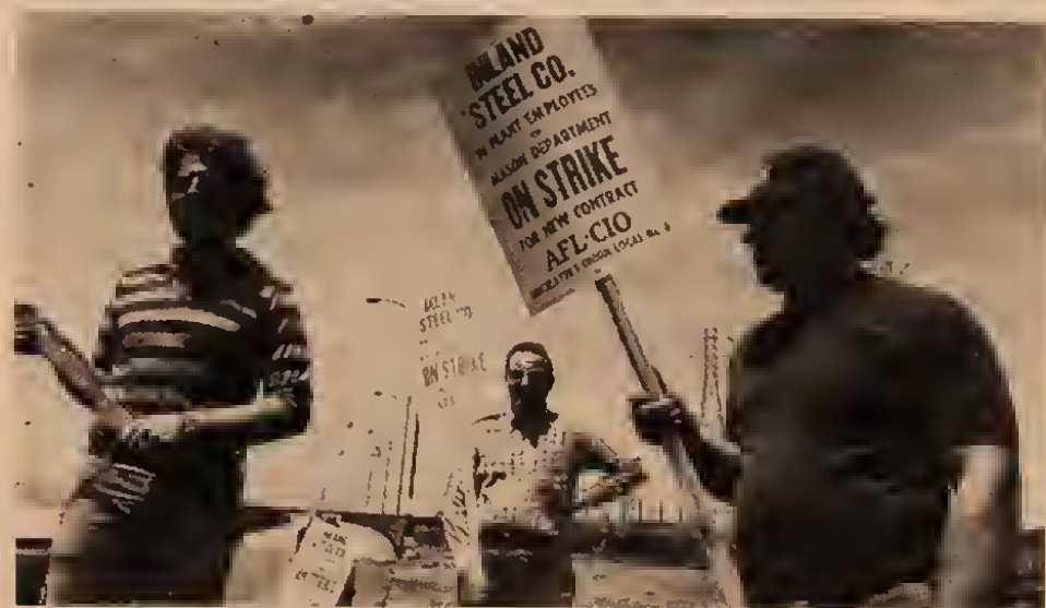
The picket line Anwar didn't cross. Inland bricklayers go out in 1978.

The Inland bricklayers' victory came on the heels of a 110-day coal miners' strike. In 1978 the miners showed that the powerful traditions of working-class solidarity—honoring picket lines and refusing to handle struck products—could beat back even the strikebreaker in the White House, Jimmy Carter, and his Taft-Hartley injunctions. In con-