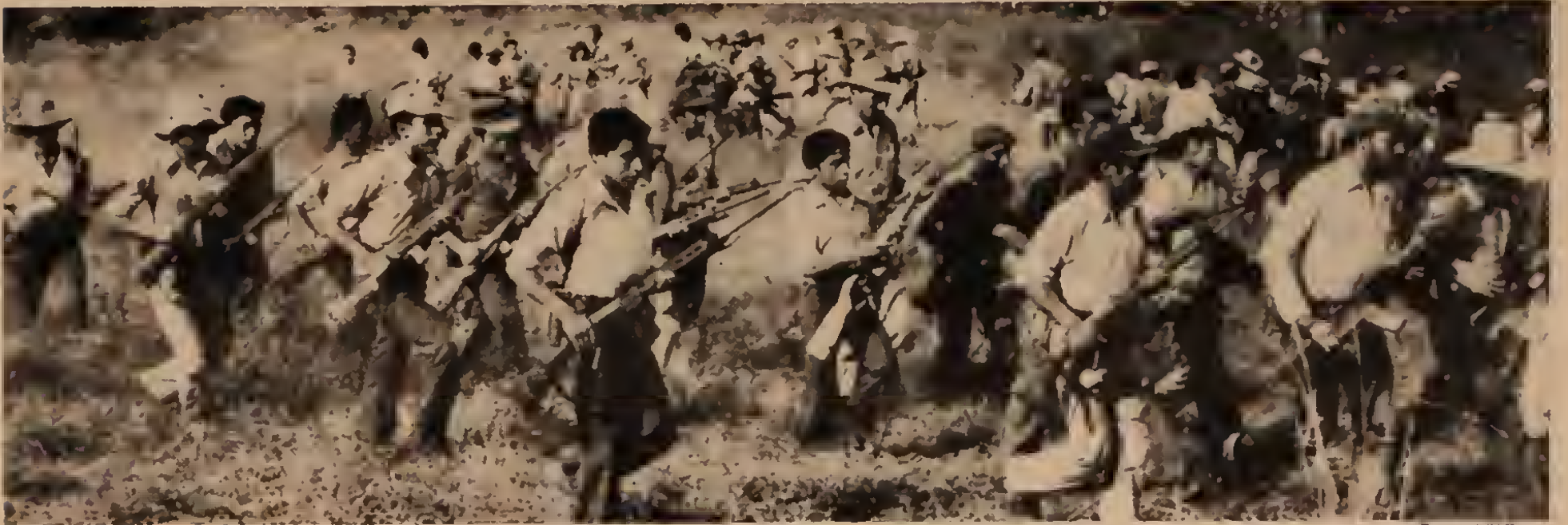
Salvadoran rebels on the offensive.